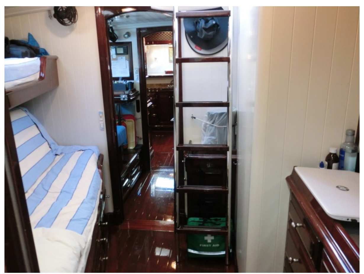
Crew Stateroom Aft