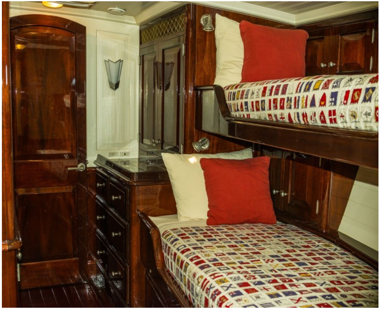
Guest Cabin Bunk 3