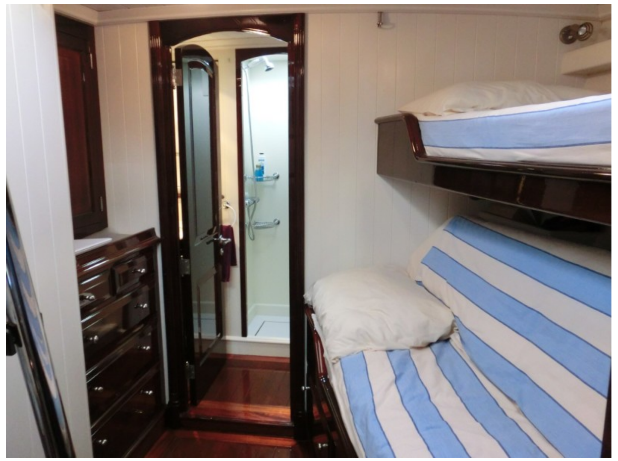
Crew Cabin Forward