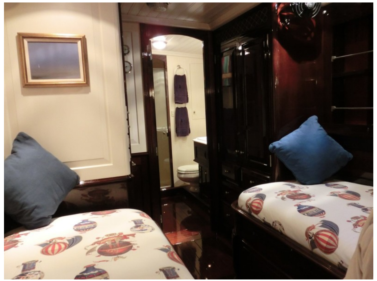
Twin Cabin Forward