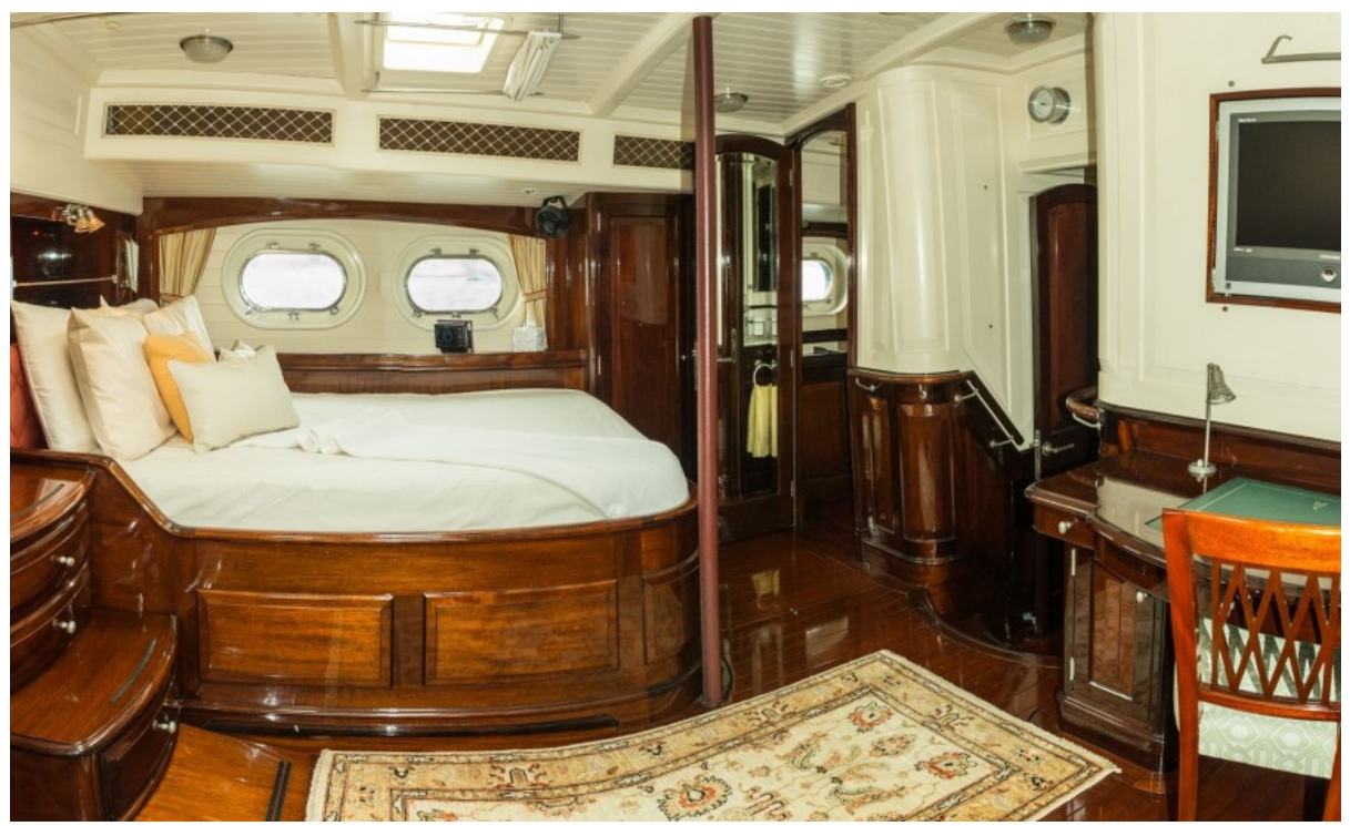
Master SR Port