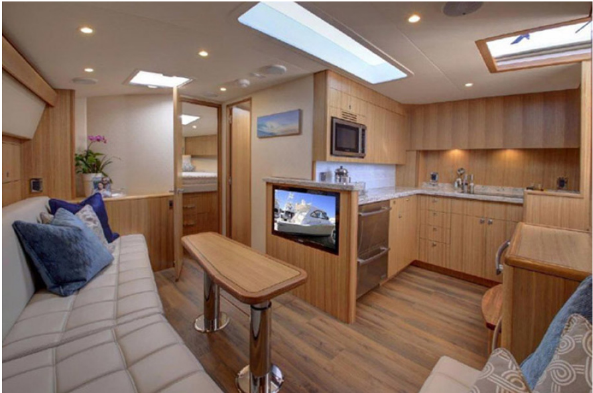
Salon and Galley