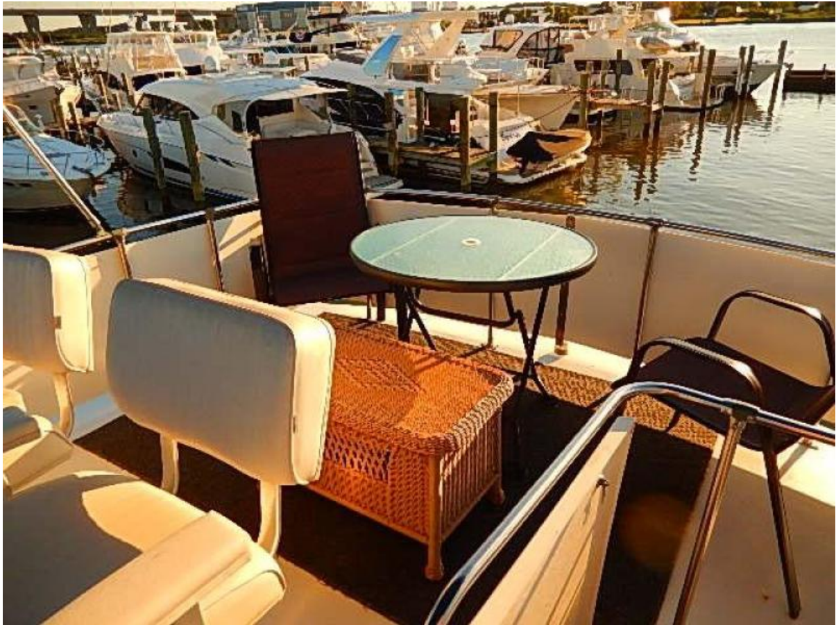
Fly bridge seating