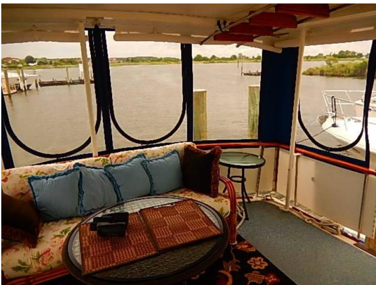
Bridge ladder hangs from ceiling