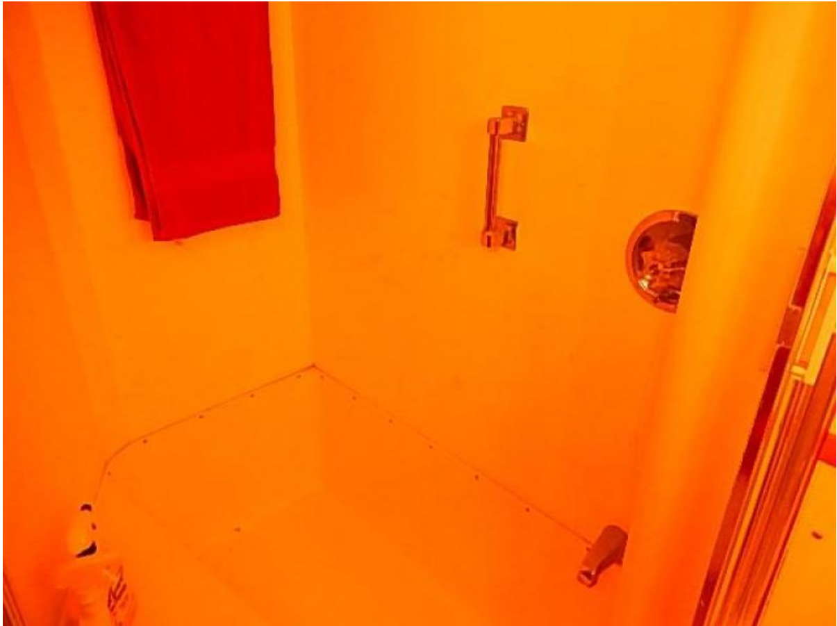
Bath tub aft stateroom