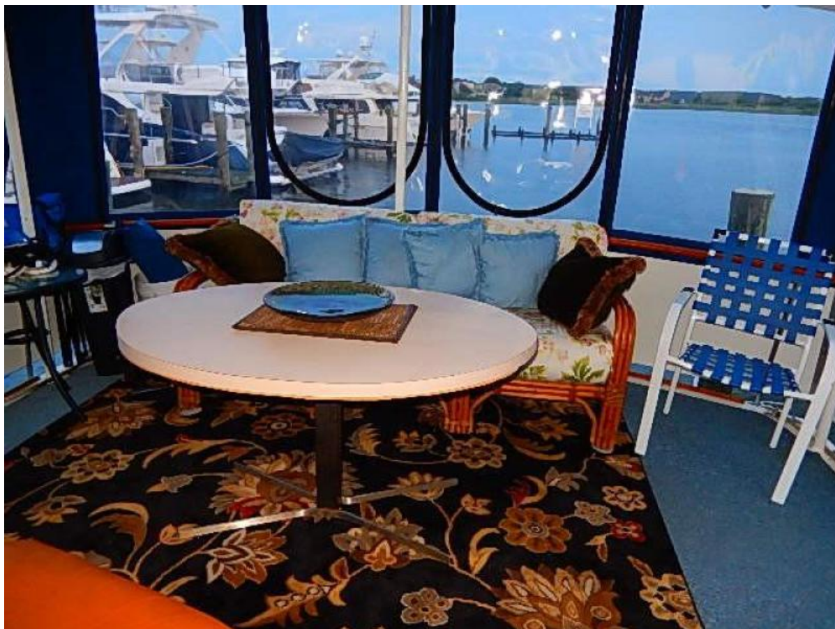
Converts to coffee table