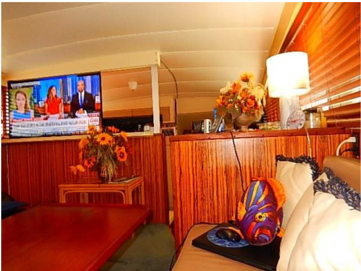
Salon looking forward