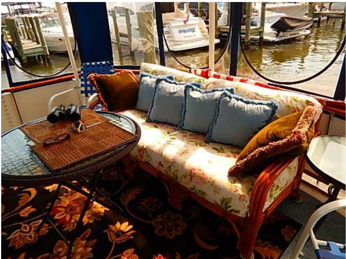
Gel memory foam couch