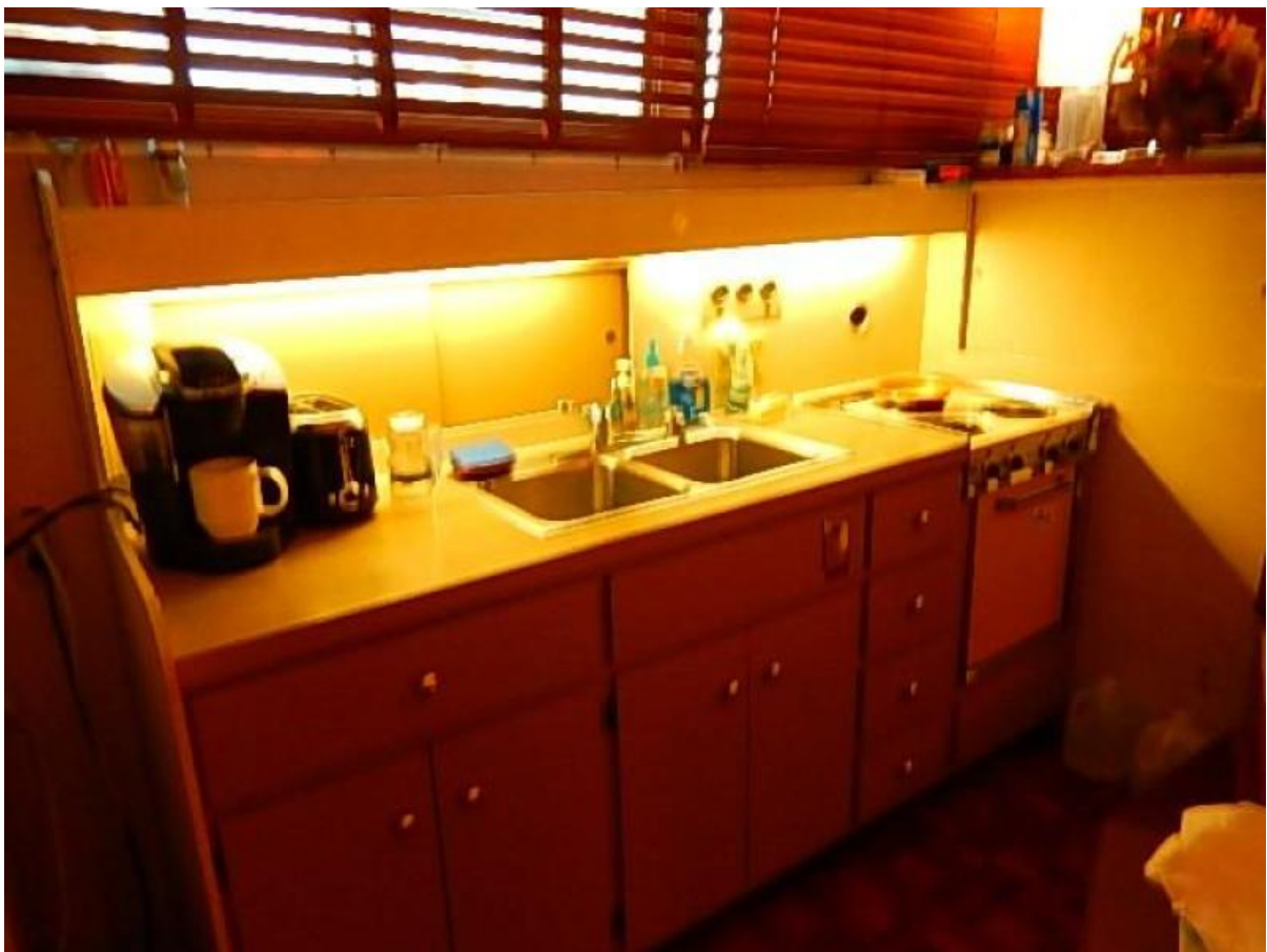
Galley down one step