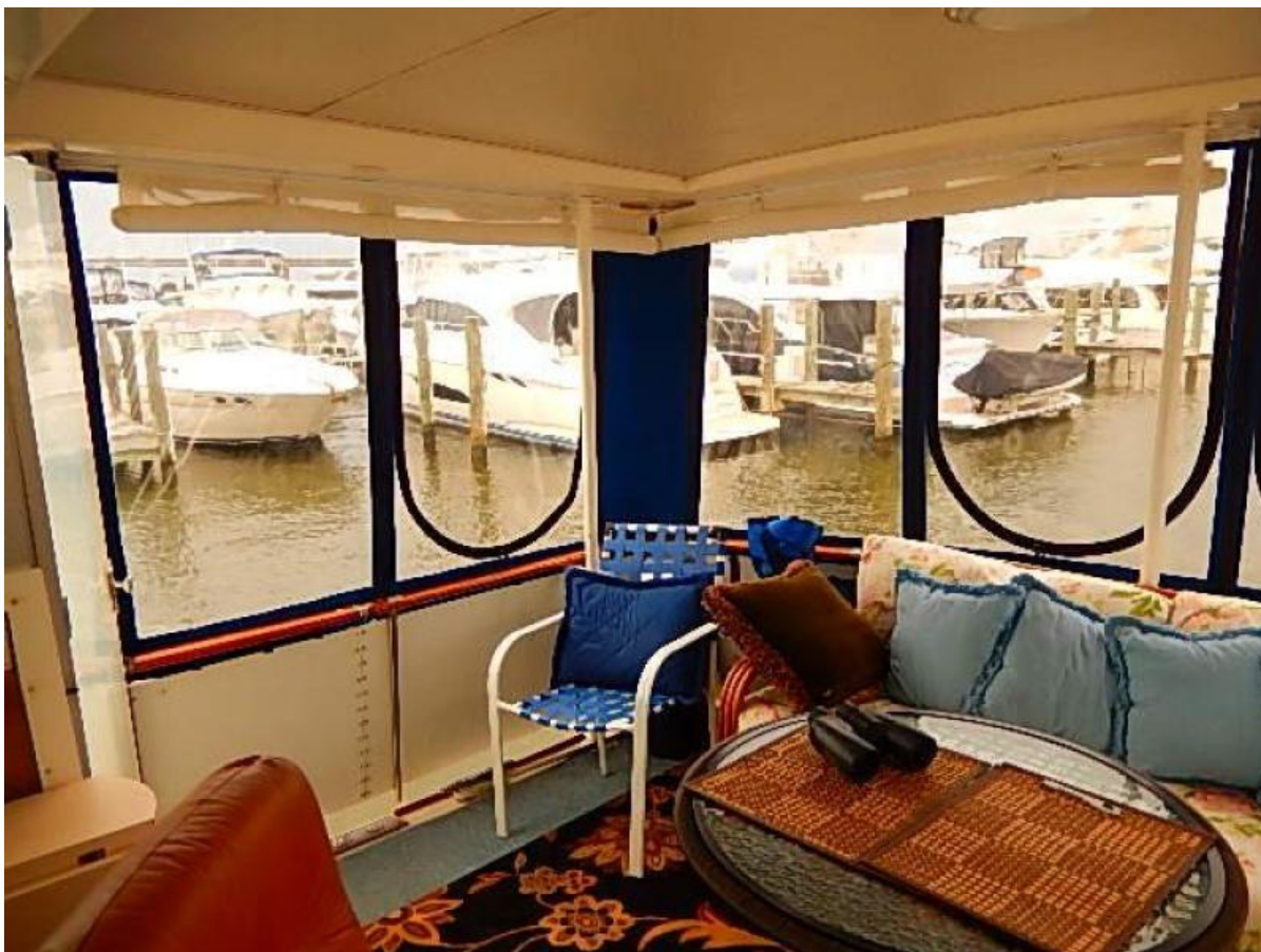
Aft enclosure great for fall cruising custom made pull down white sun shades to keep sun out of aft deck