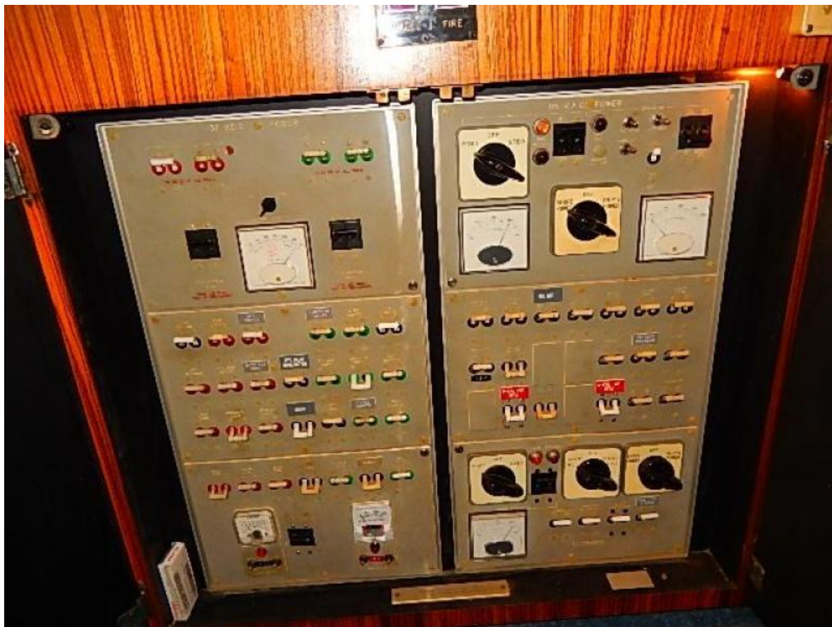
AC / DC panel