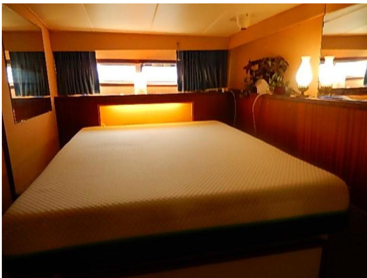
New Memory Foam full Queen