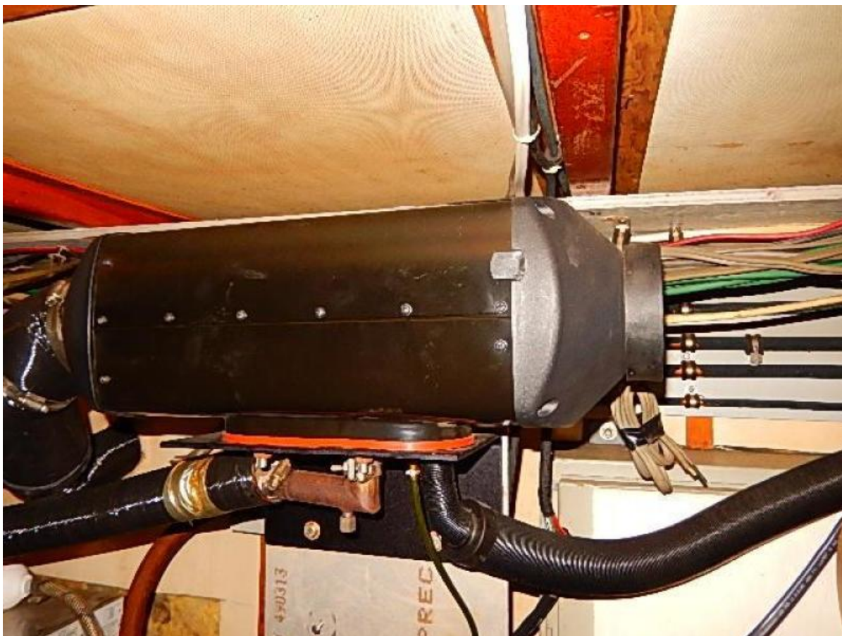
Recent Diesel heater/great in fall and winter