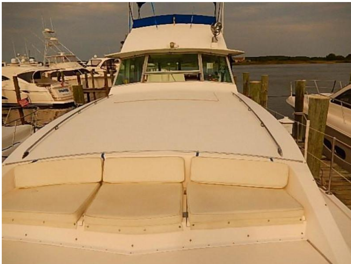
Looking aft from bow