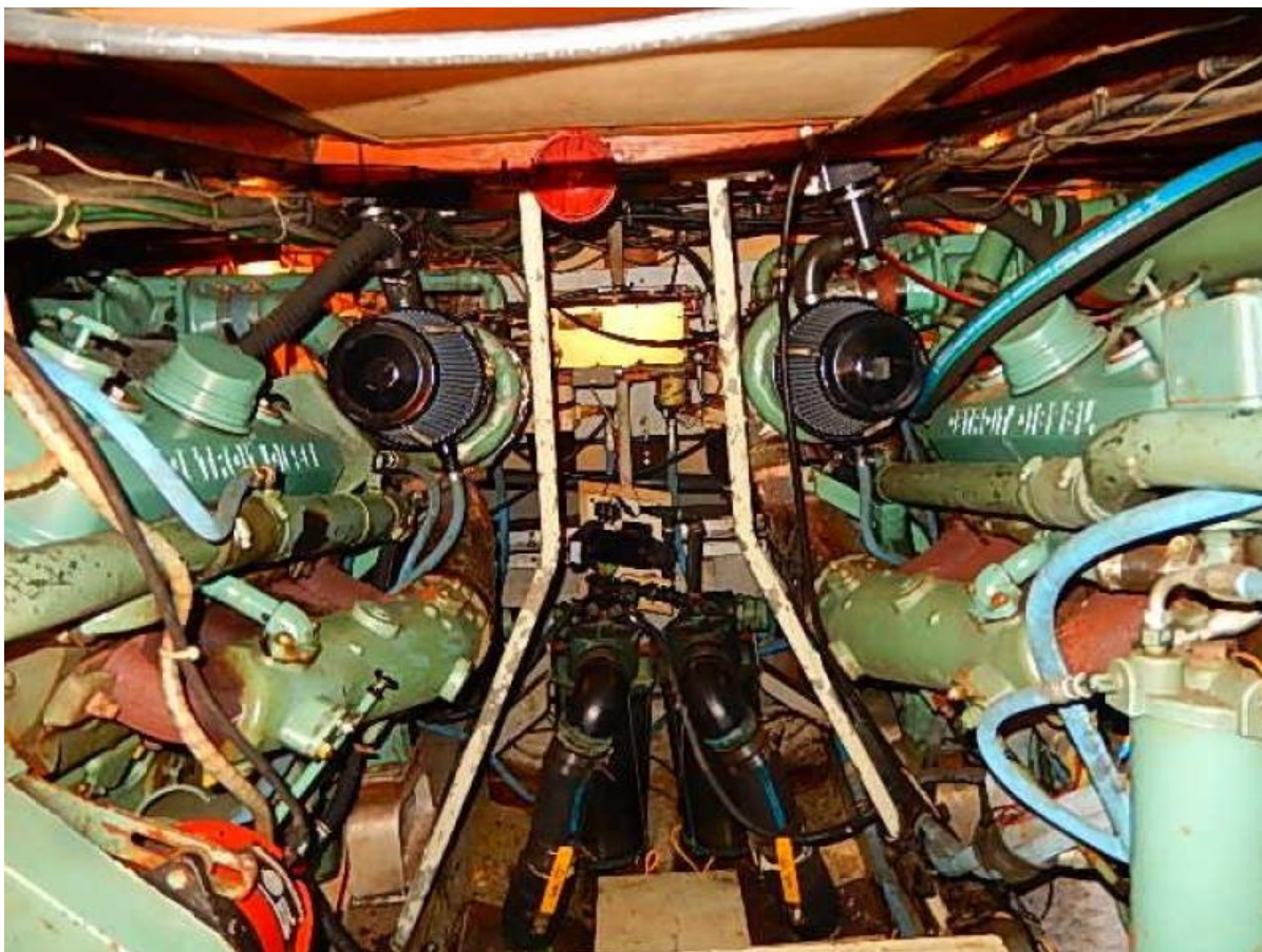
Engine room / twin 8-71 Detroit's