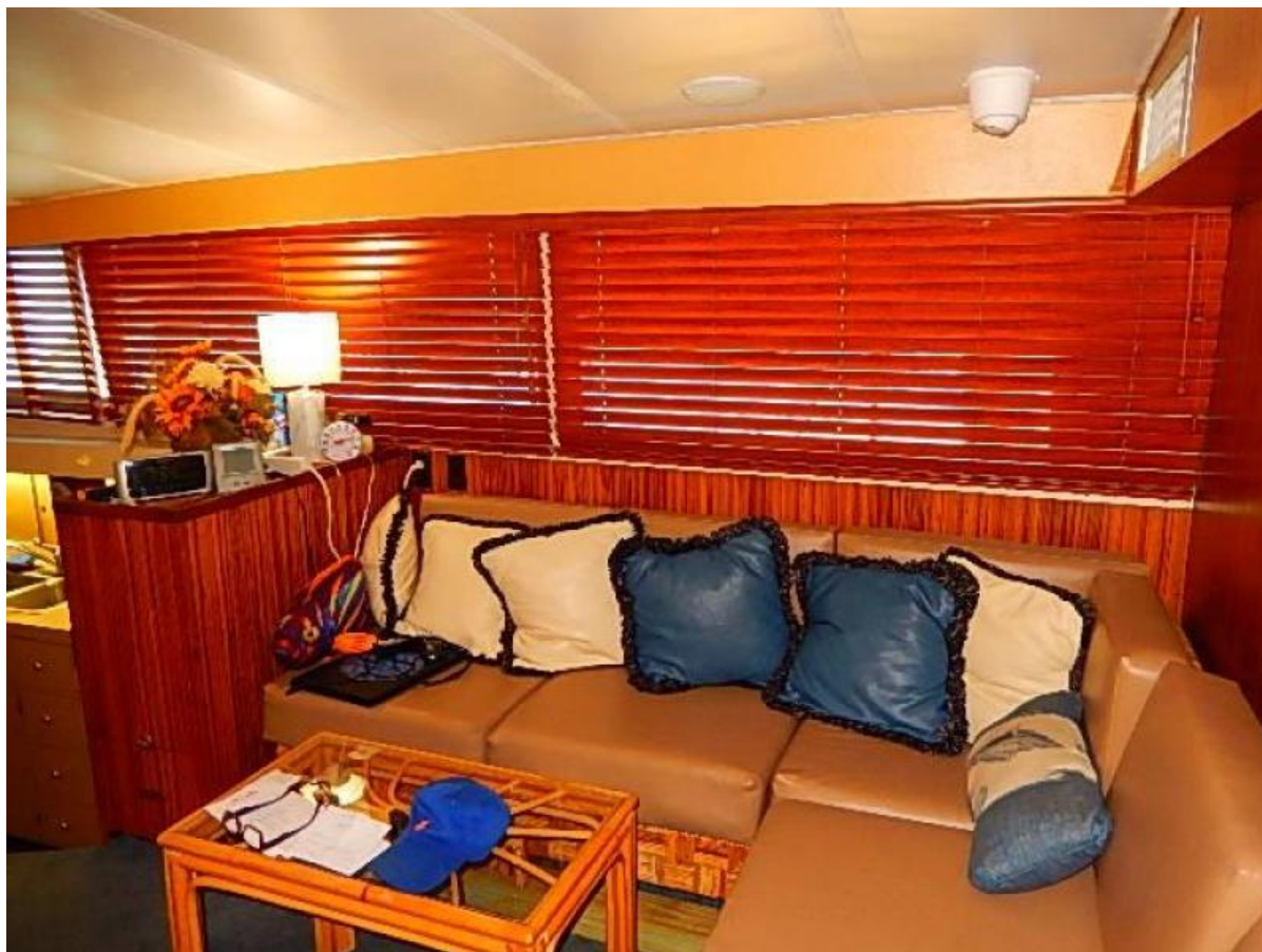
Salon Custom made window treatments