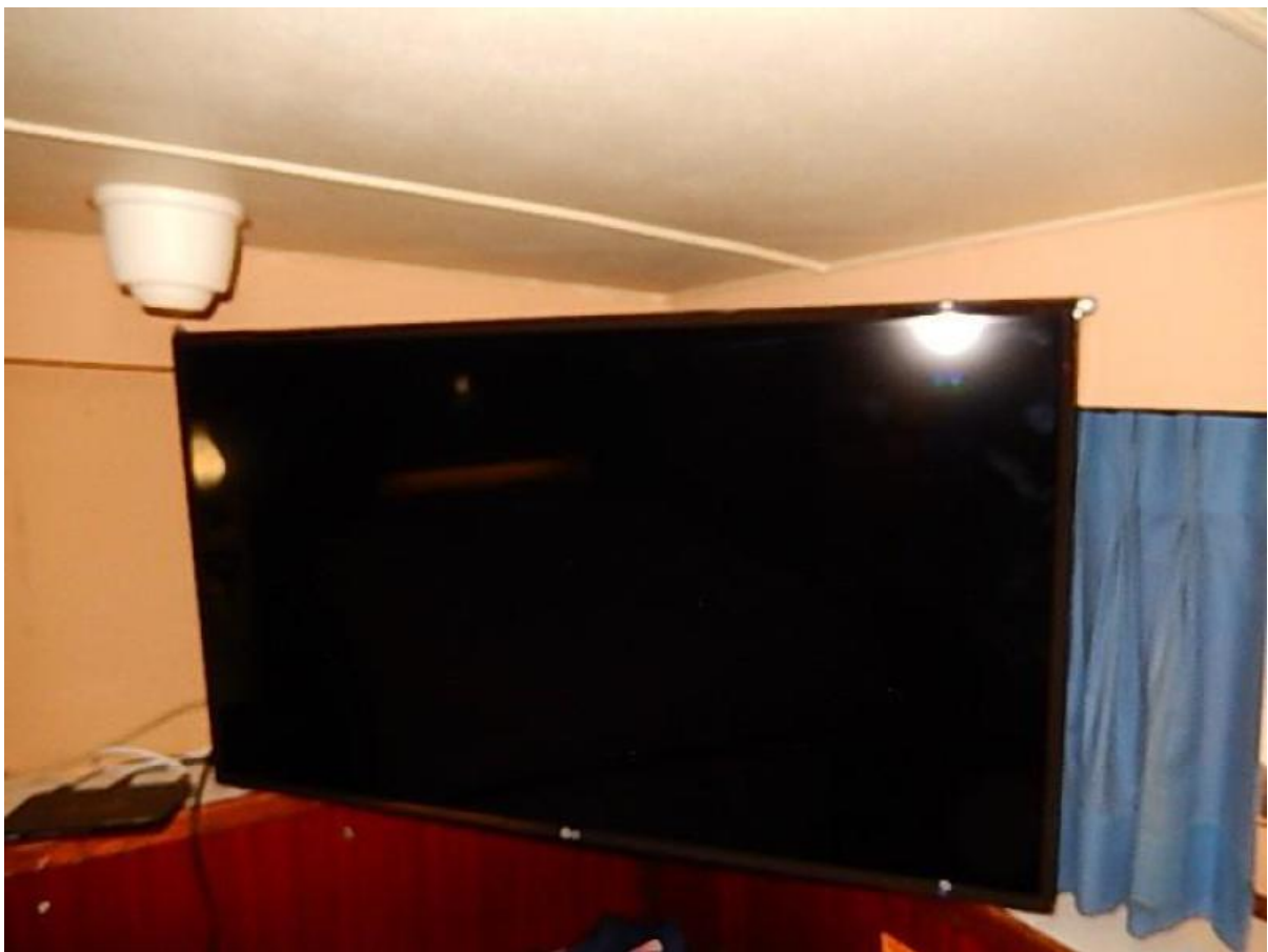
43" smart TV in aft cabin