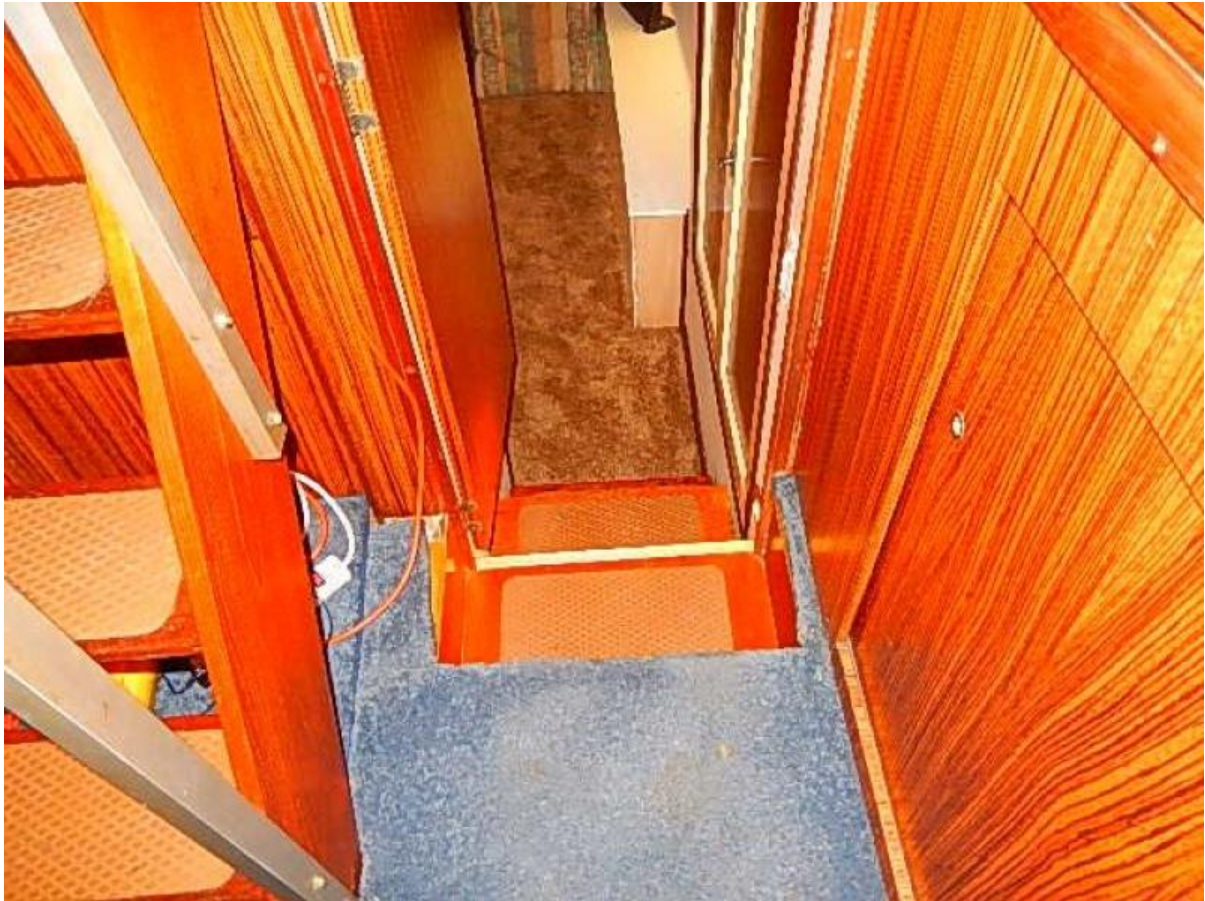
down to aft stateroom