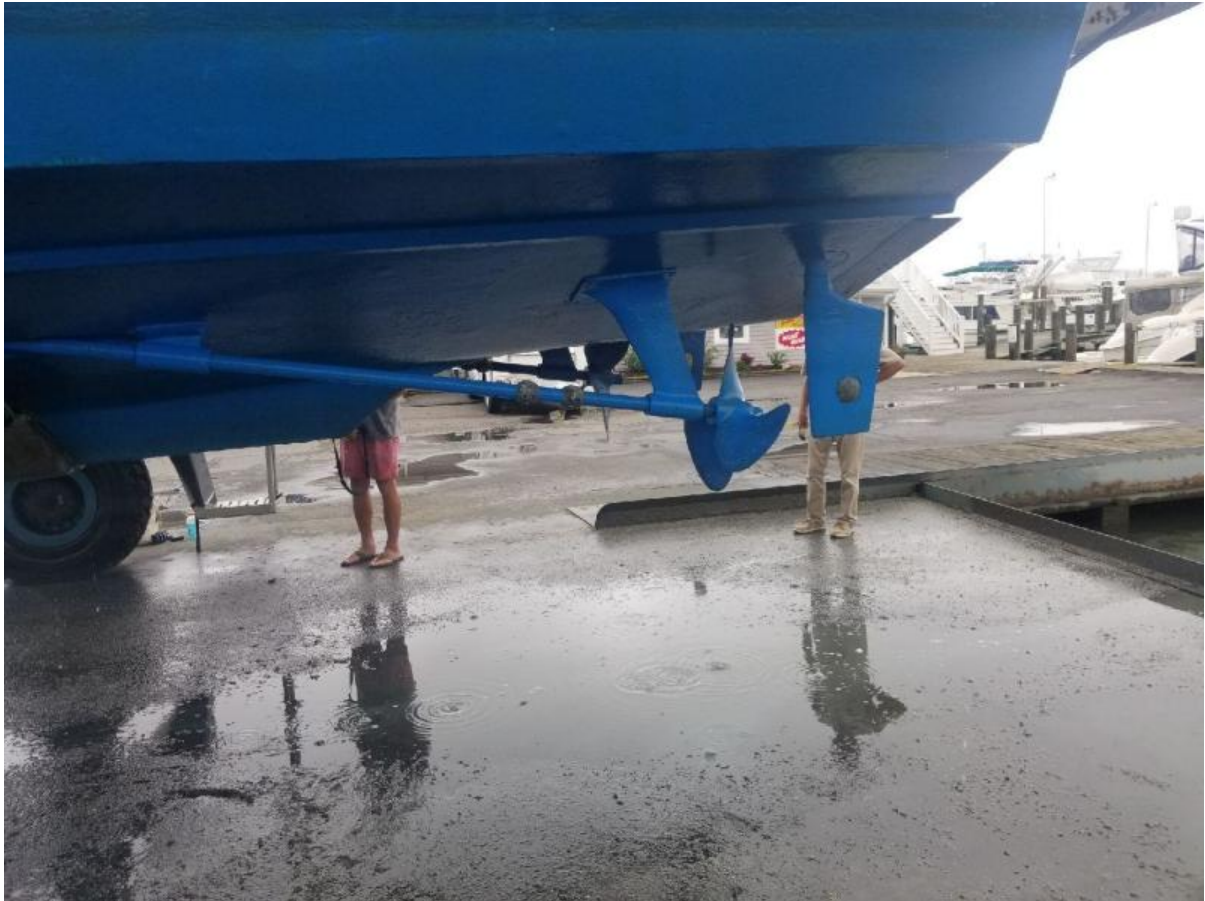
Haul out July 2018