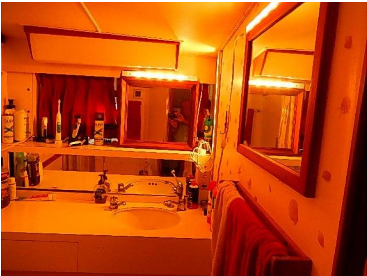
Aft head with tub shower