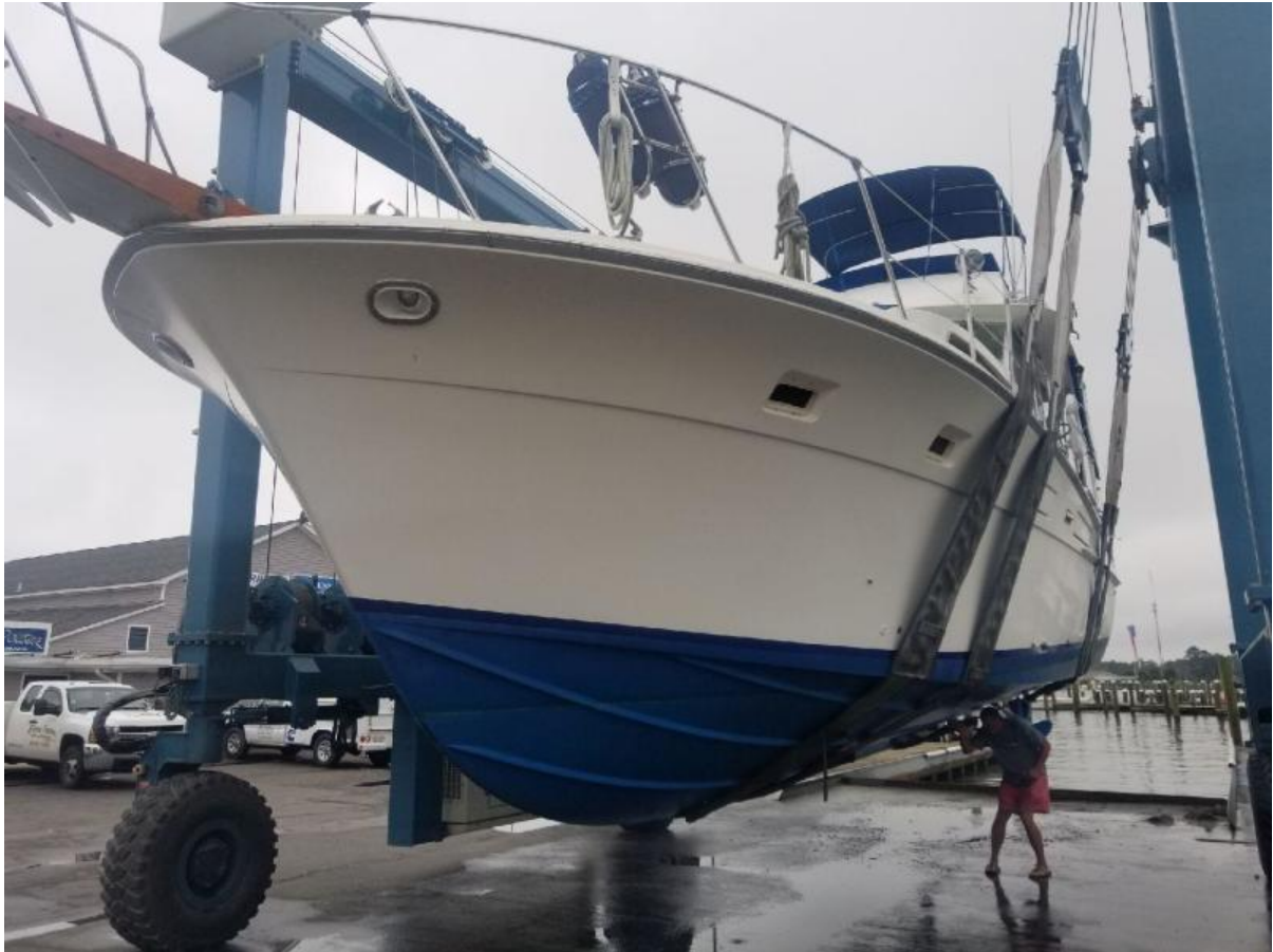
Gel coat still shines