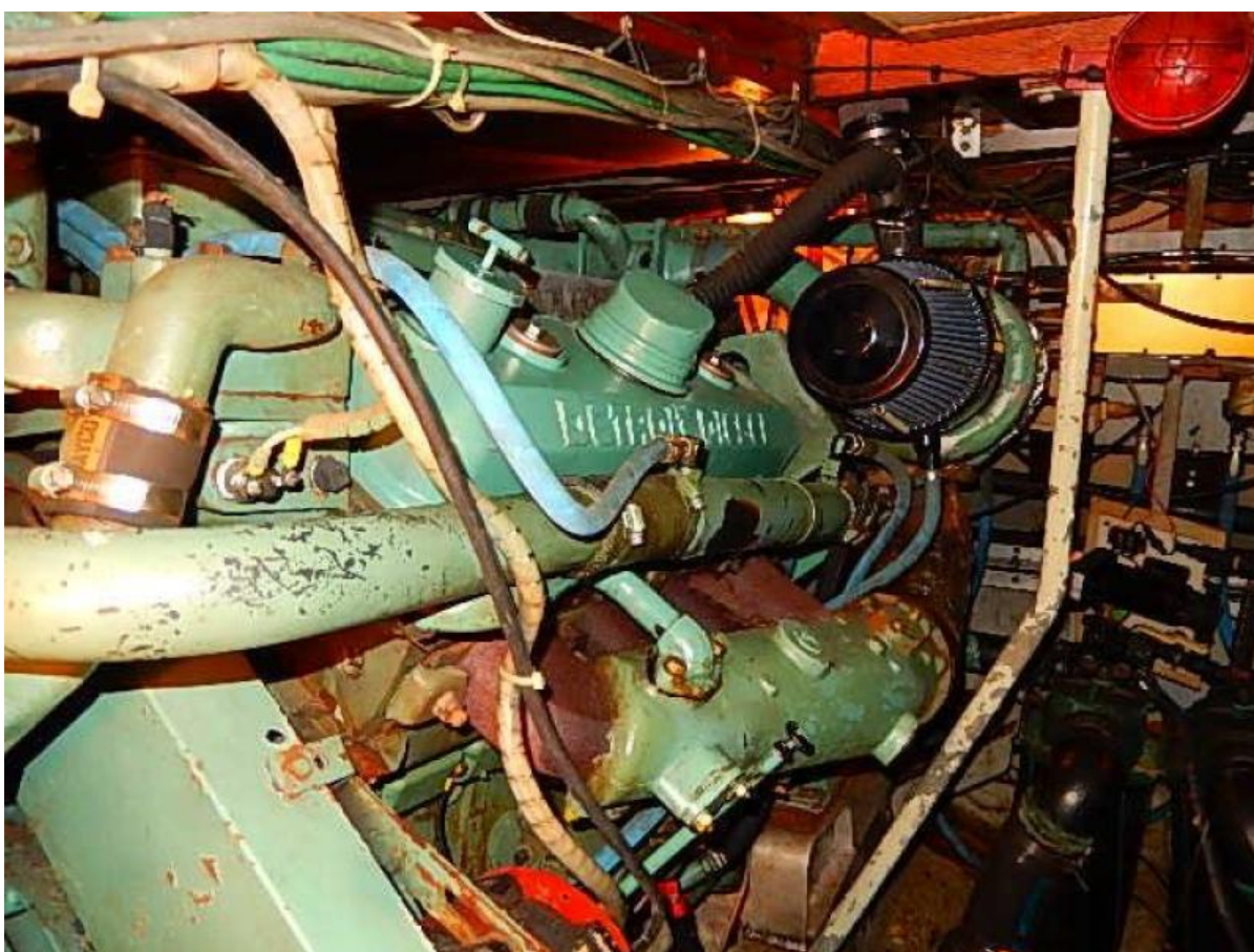
Twin Detroit's 1,200 hours since Rebuild