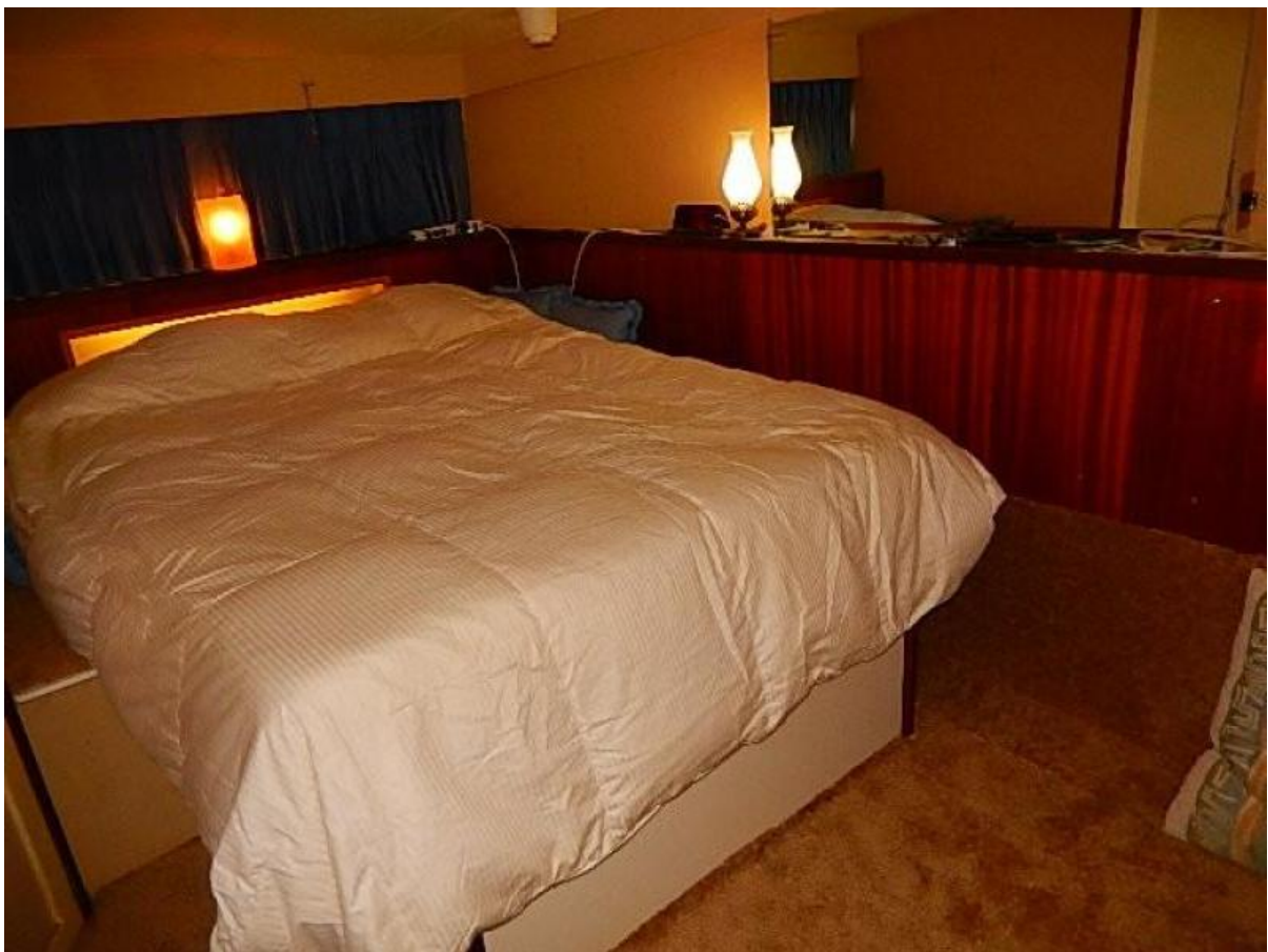
Walk around Queen bed aft stateroom