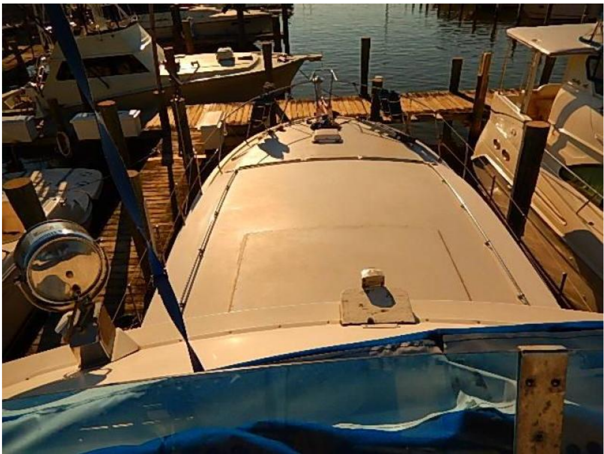
View from bridge