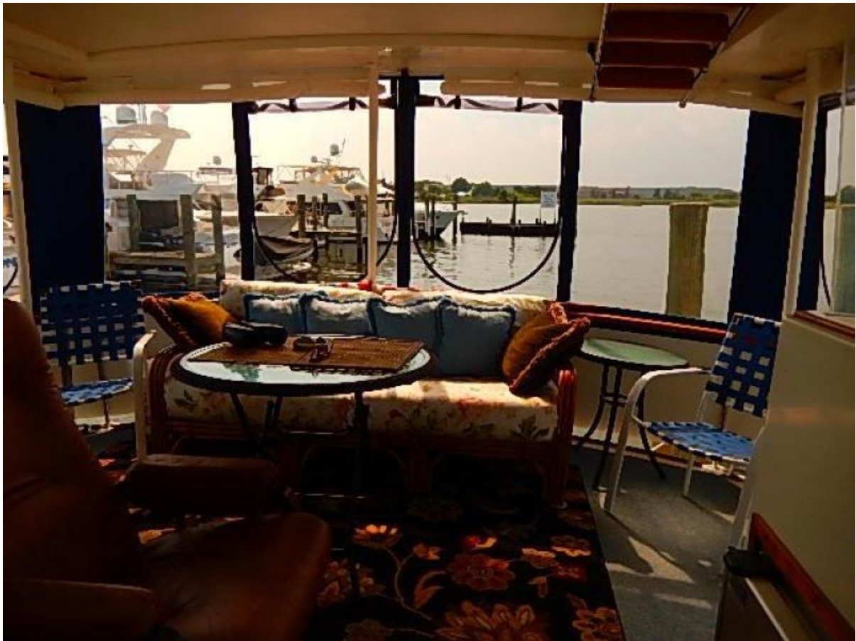
New aft deck furniture