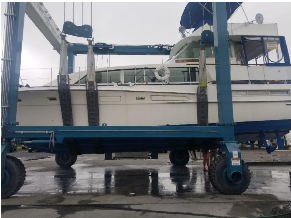
Recent bottom paint, sinks and thru-hulls