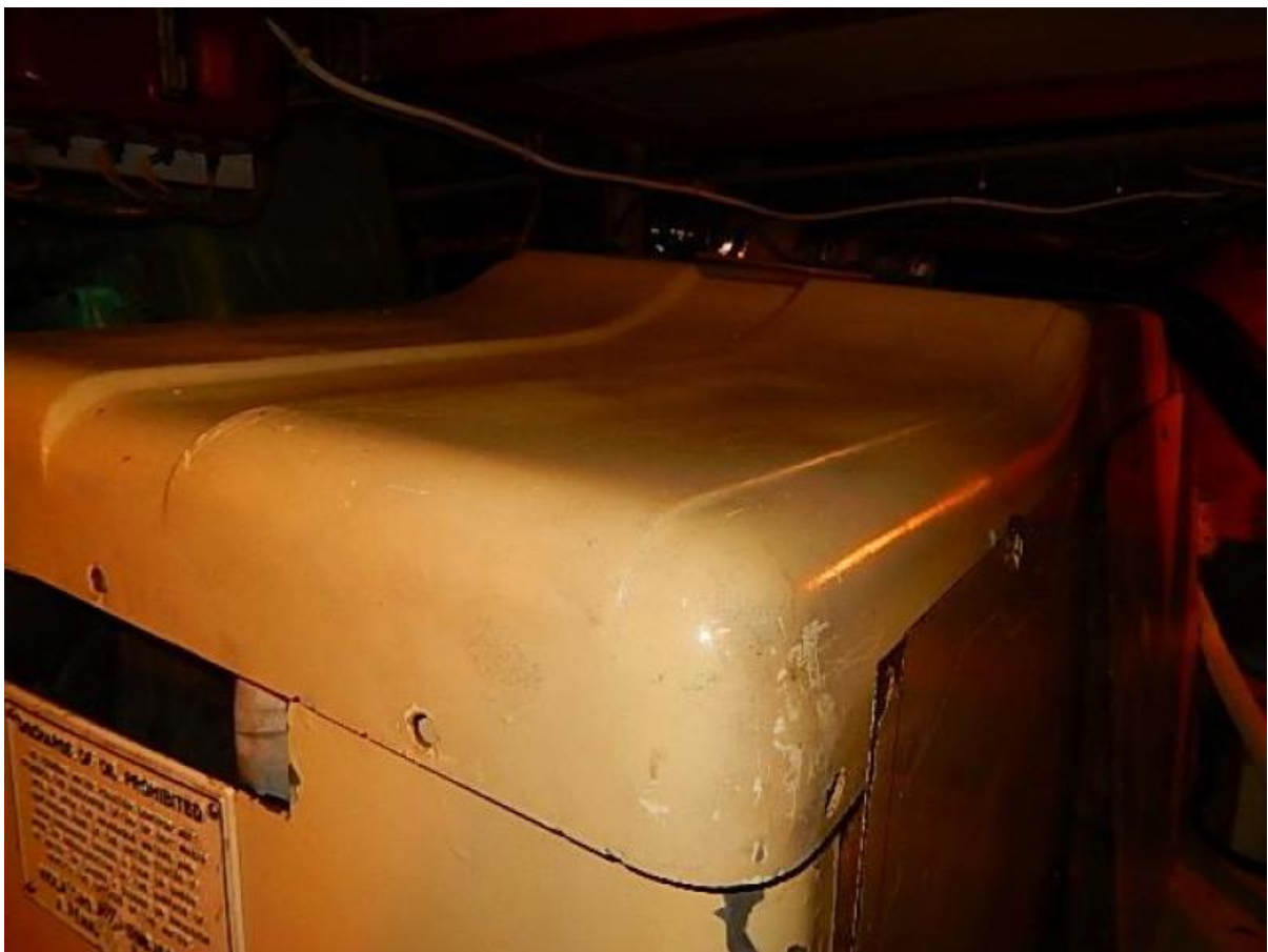
18 KW Onan generator