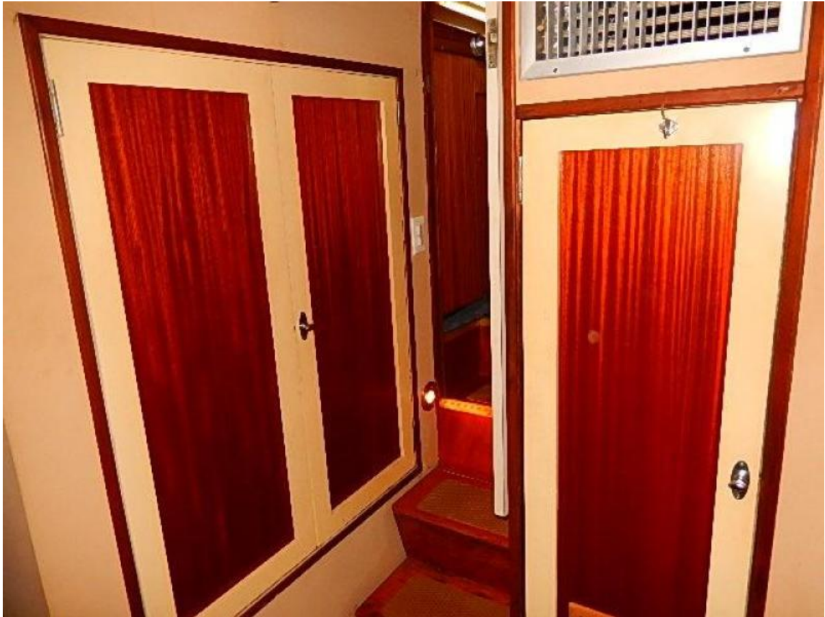
Up to saloon