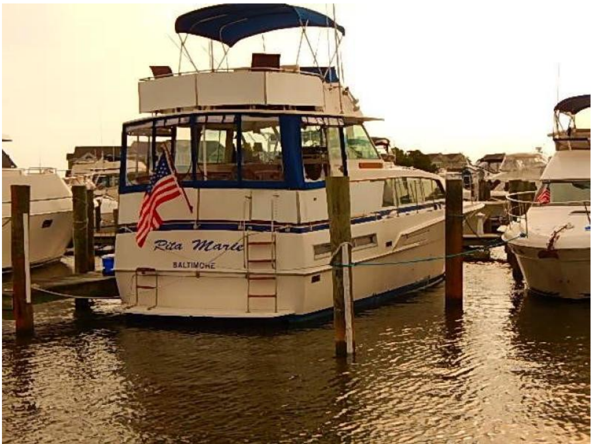
Recent aft deck enclosure