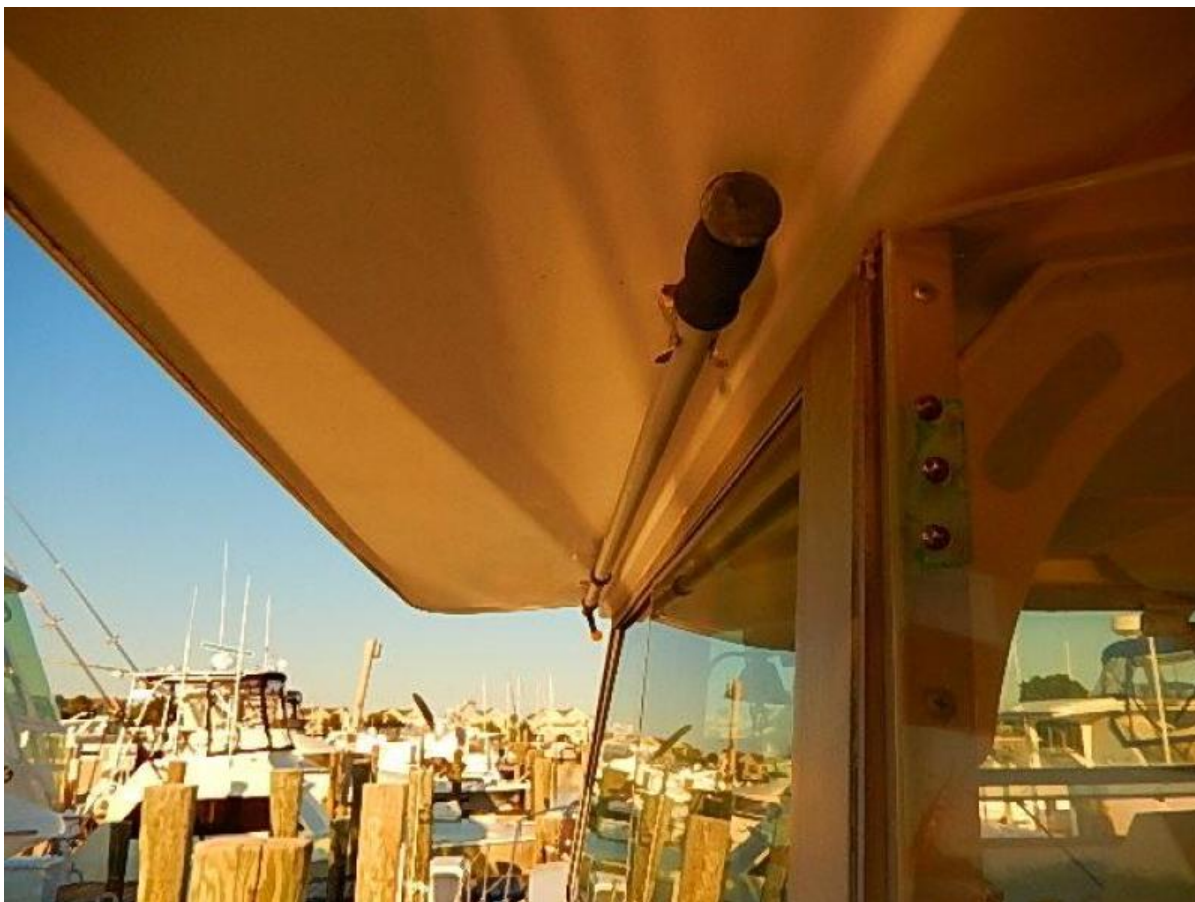
Wide over hangs protect windows