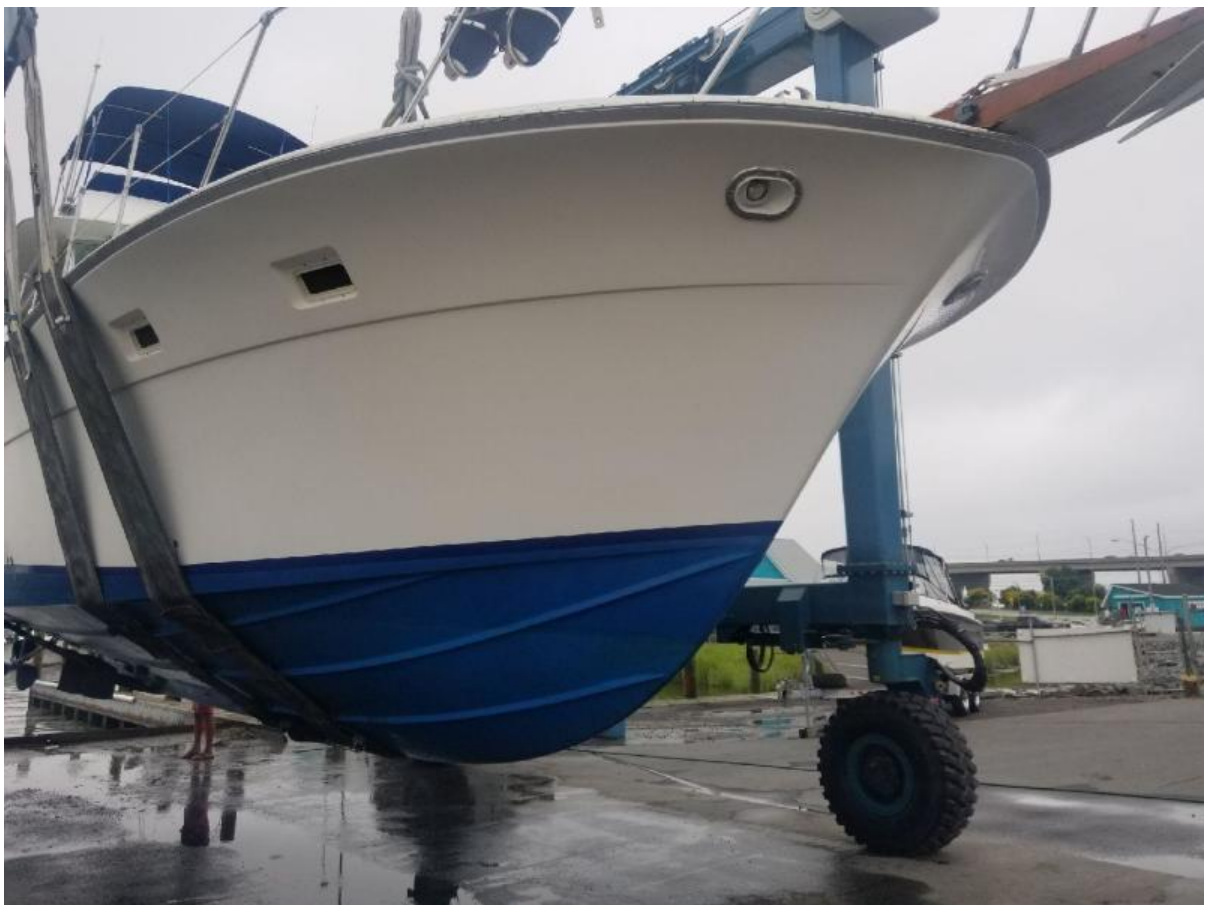
all new 8 D batteries replaced during haul out