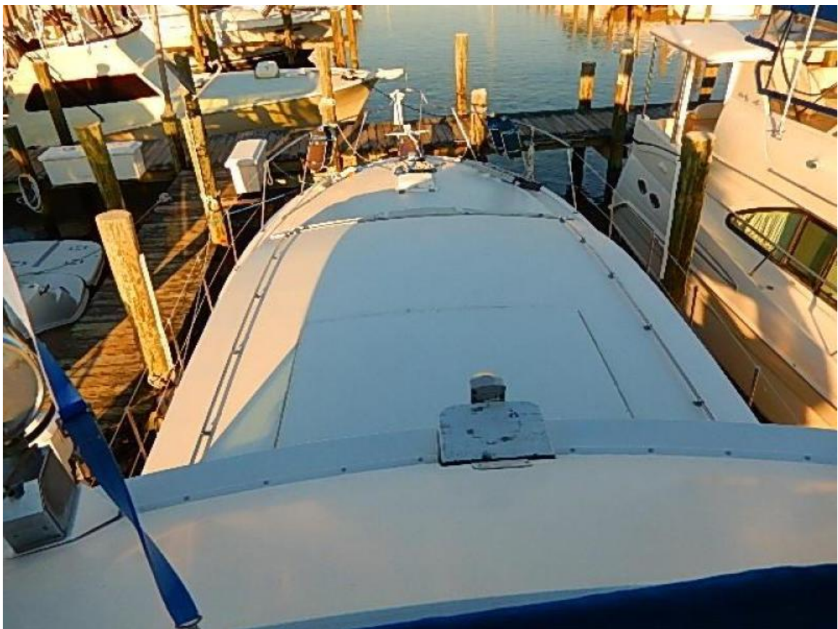
View from upper steering