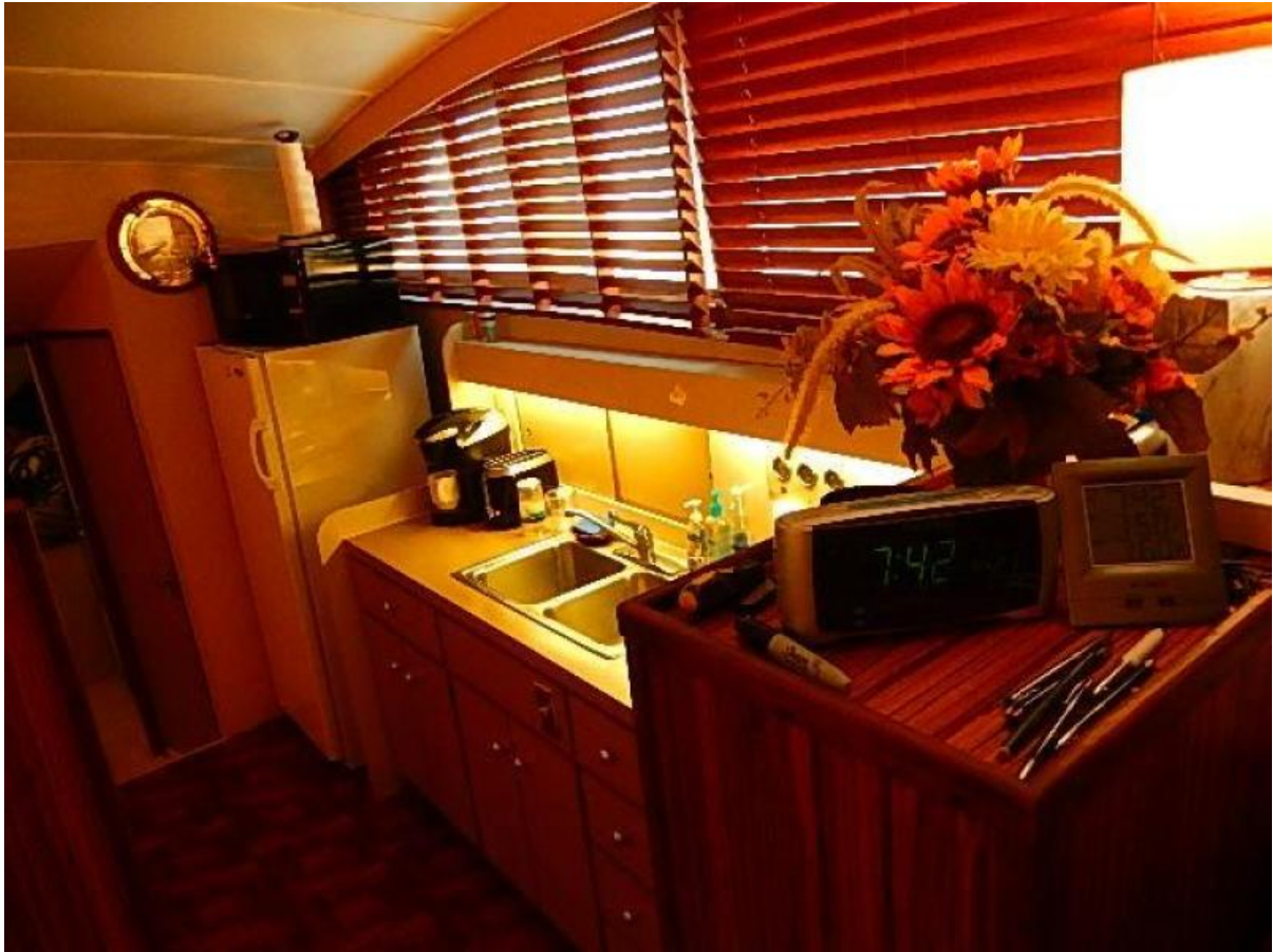
Galley starboard side one step down