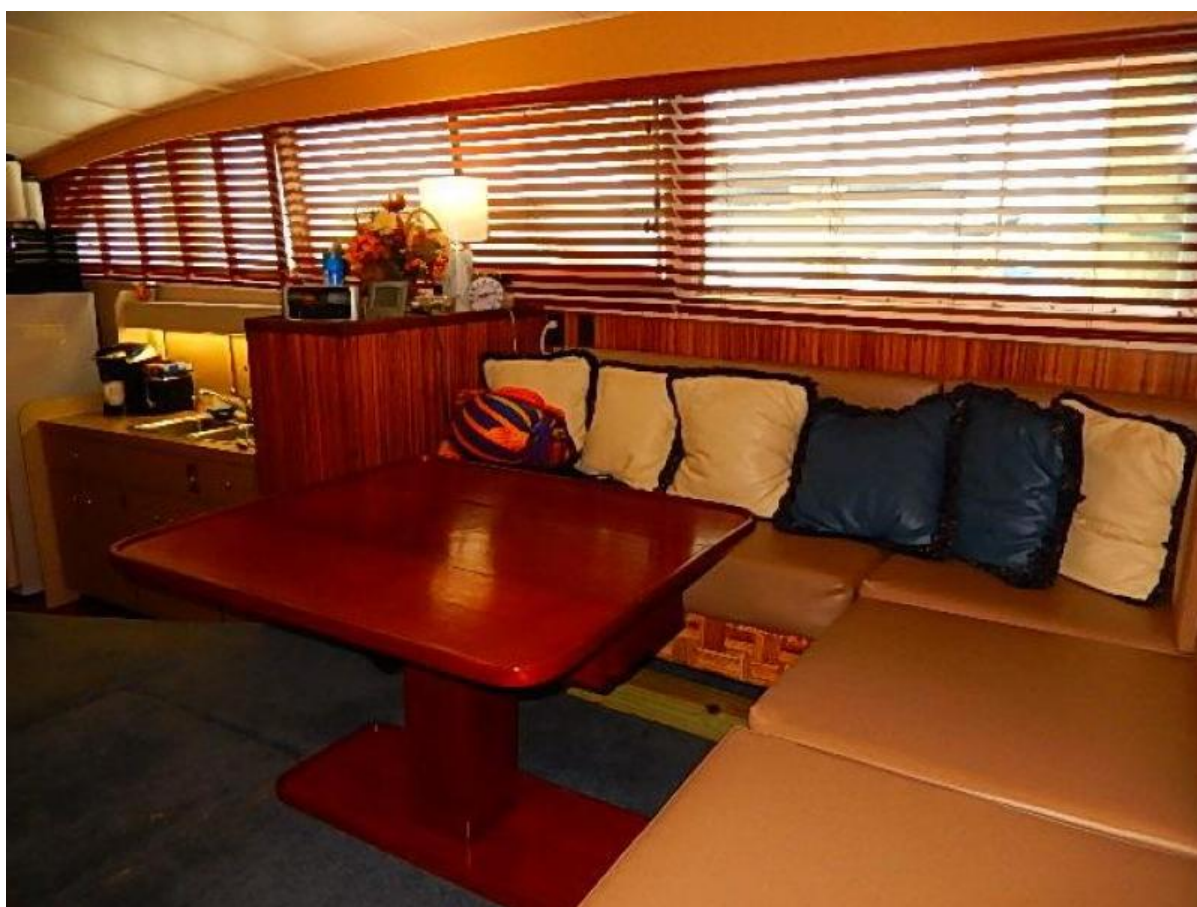
Recent custom teak window shades