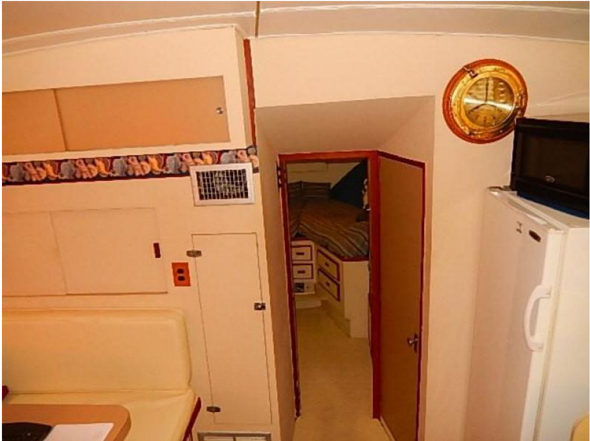
Forward guest stateroom/ head and stall shower