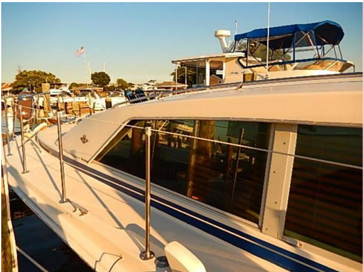
Walk around to bow