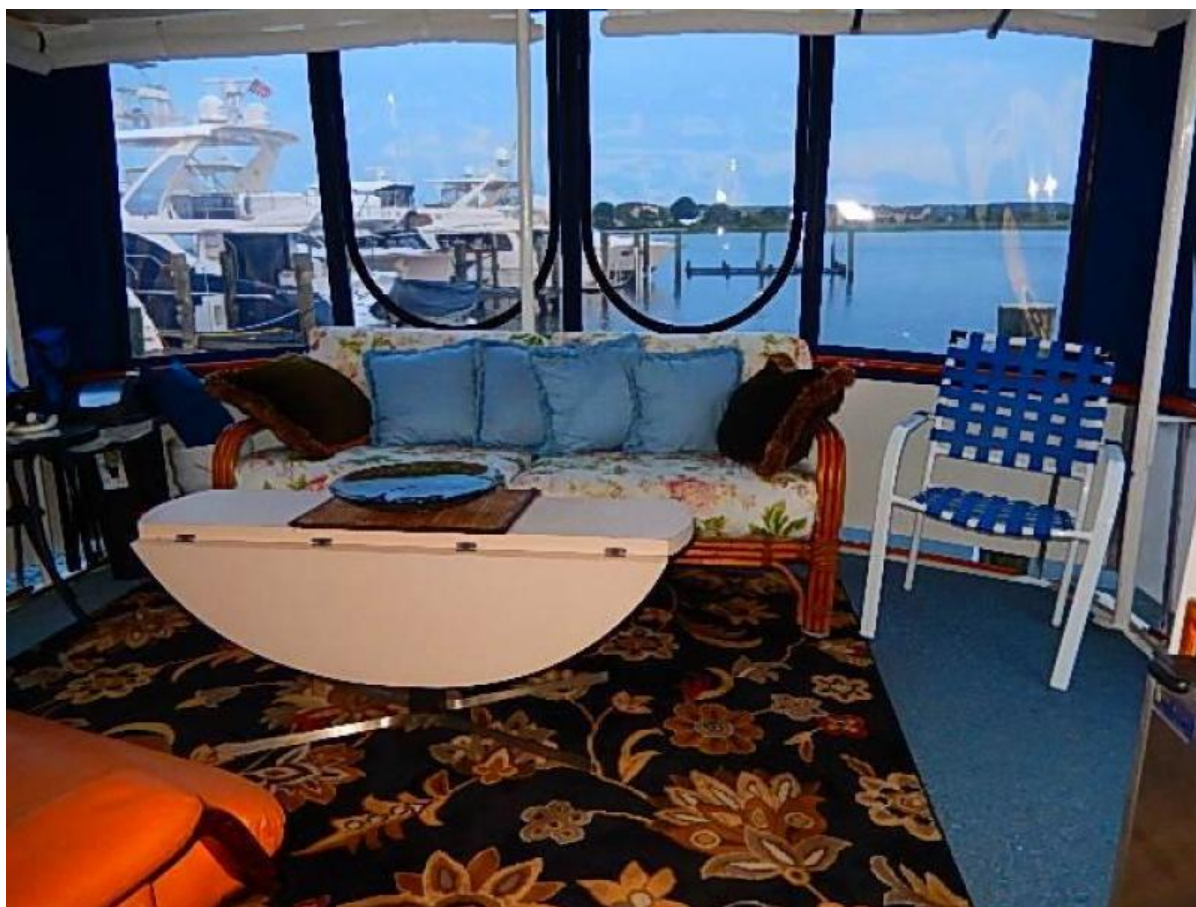
High low table