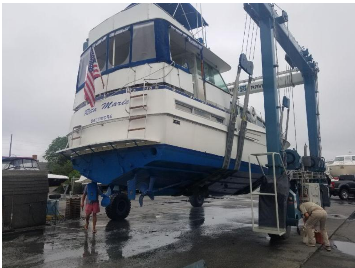
Bertram deep V hull