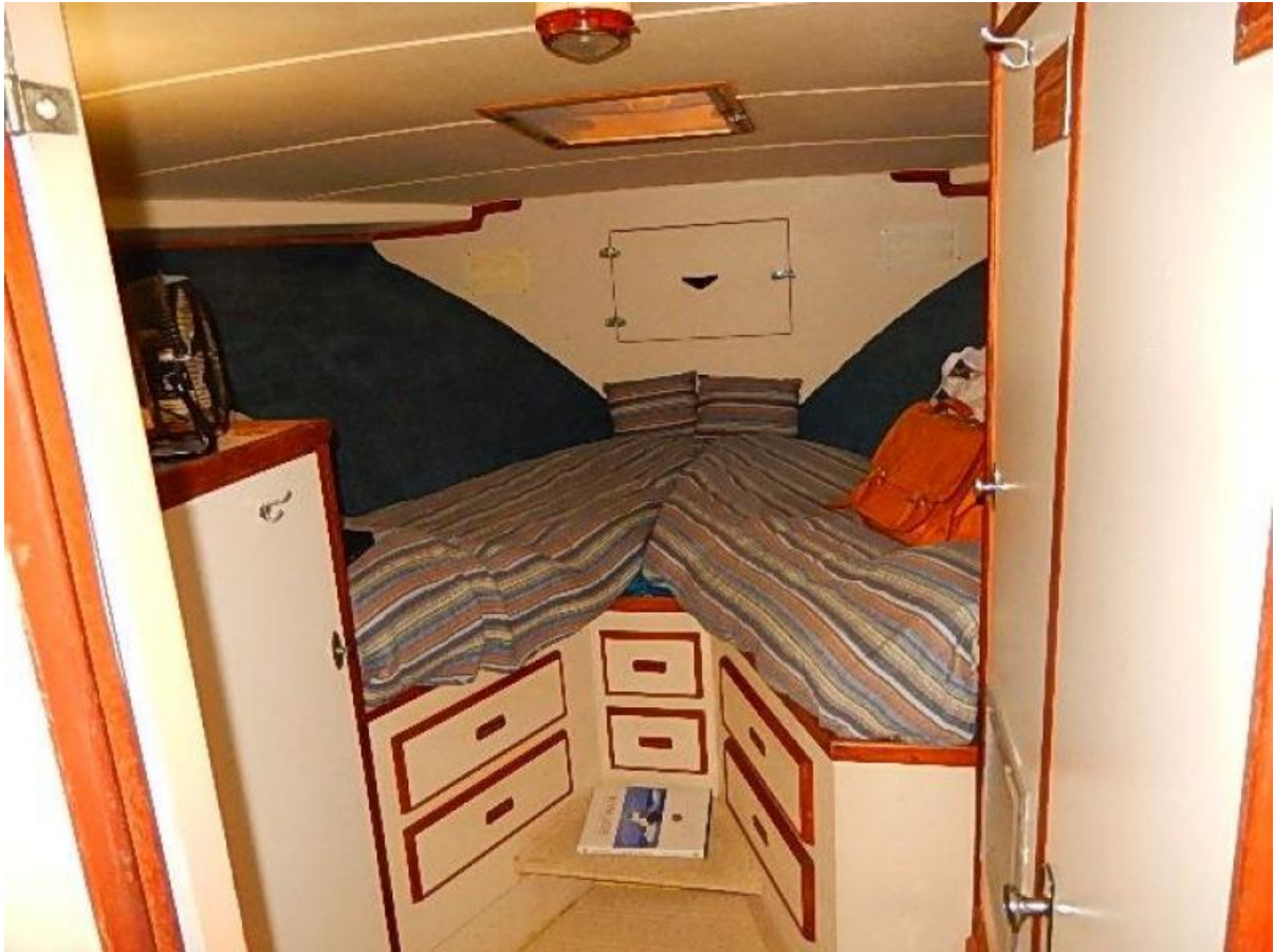
Guest stateroom forward