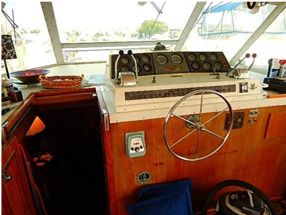
Lower steering station