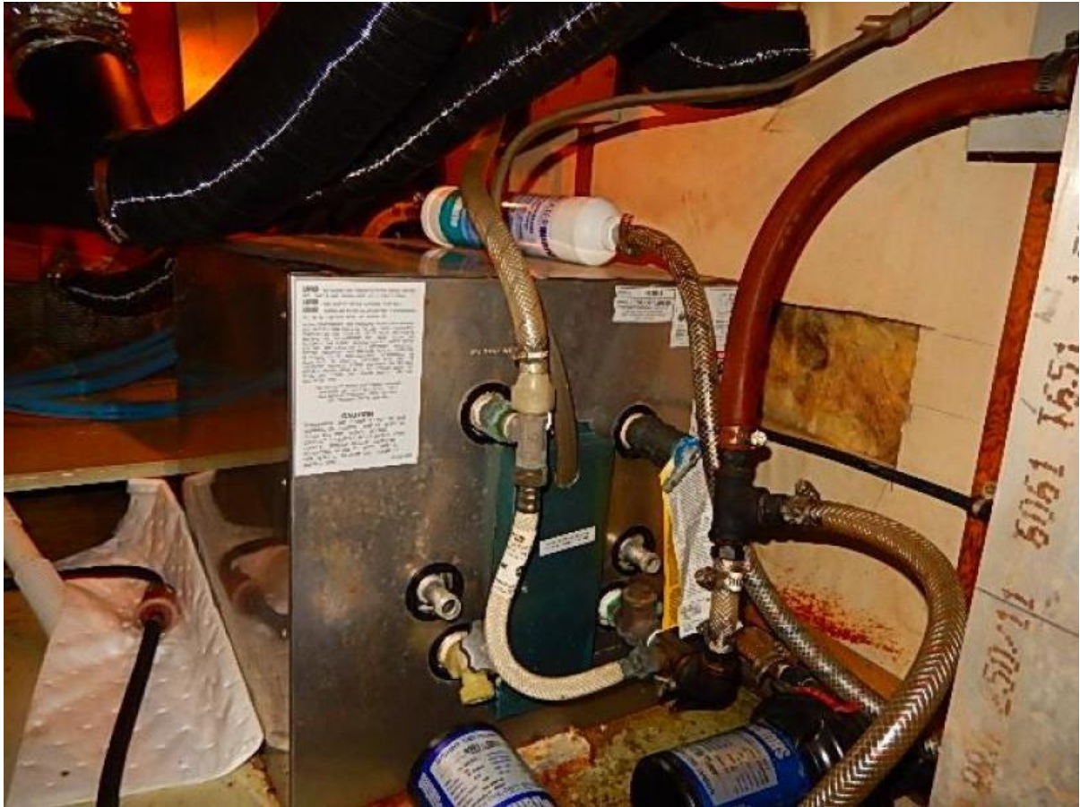
11 Gallon water heater