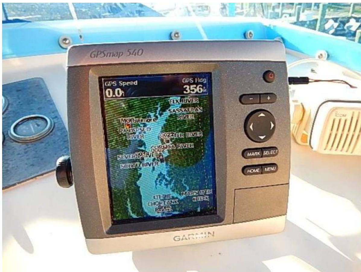
Garmin chart plotter