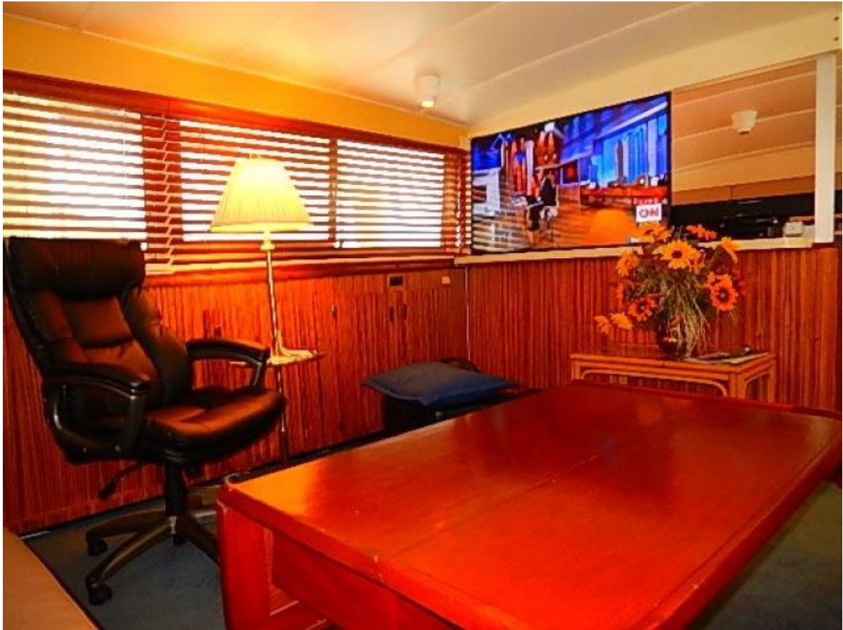
55" Samsung smart TV