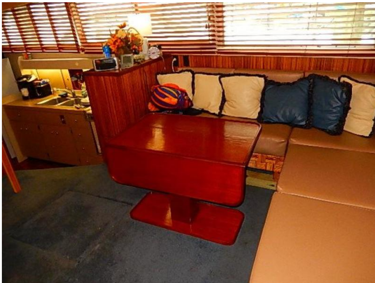
Beautiful teak hi low dining table