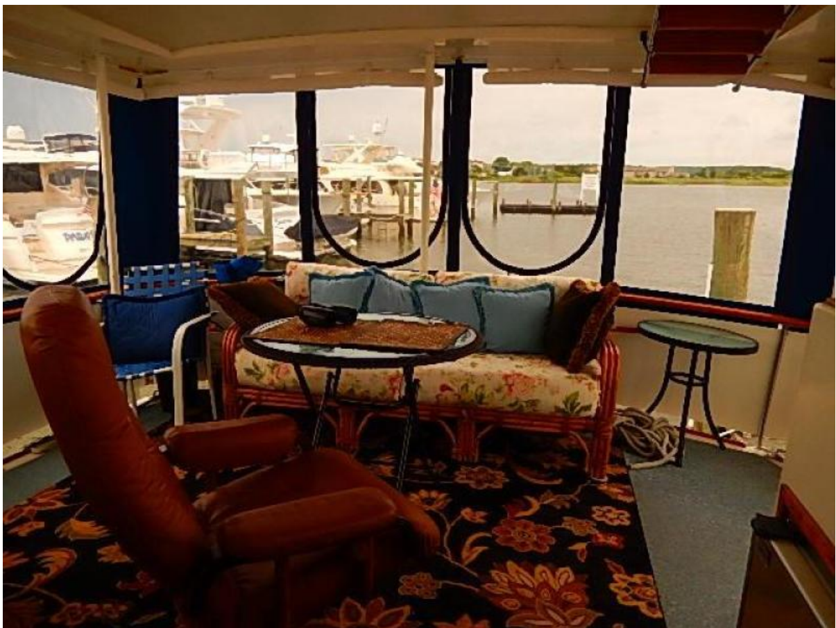
Full enclosure / all weather comfort