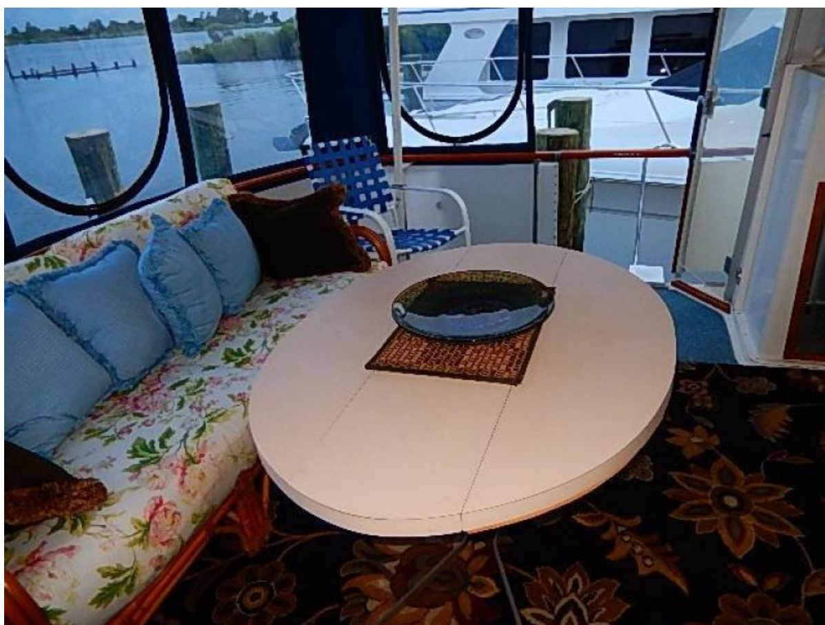
Wing doors port and starboard