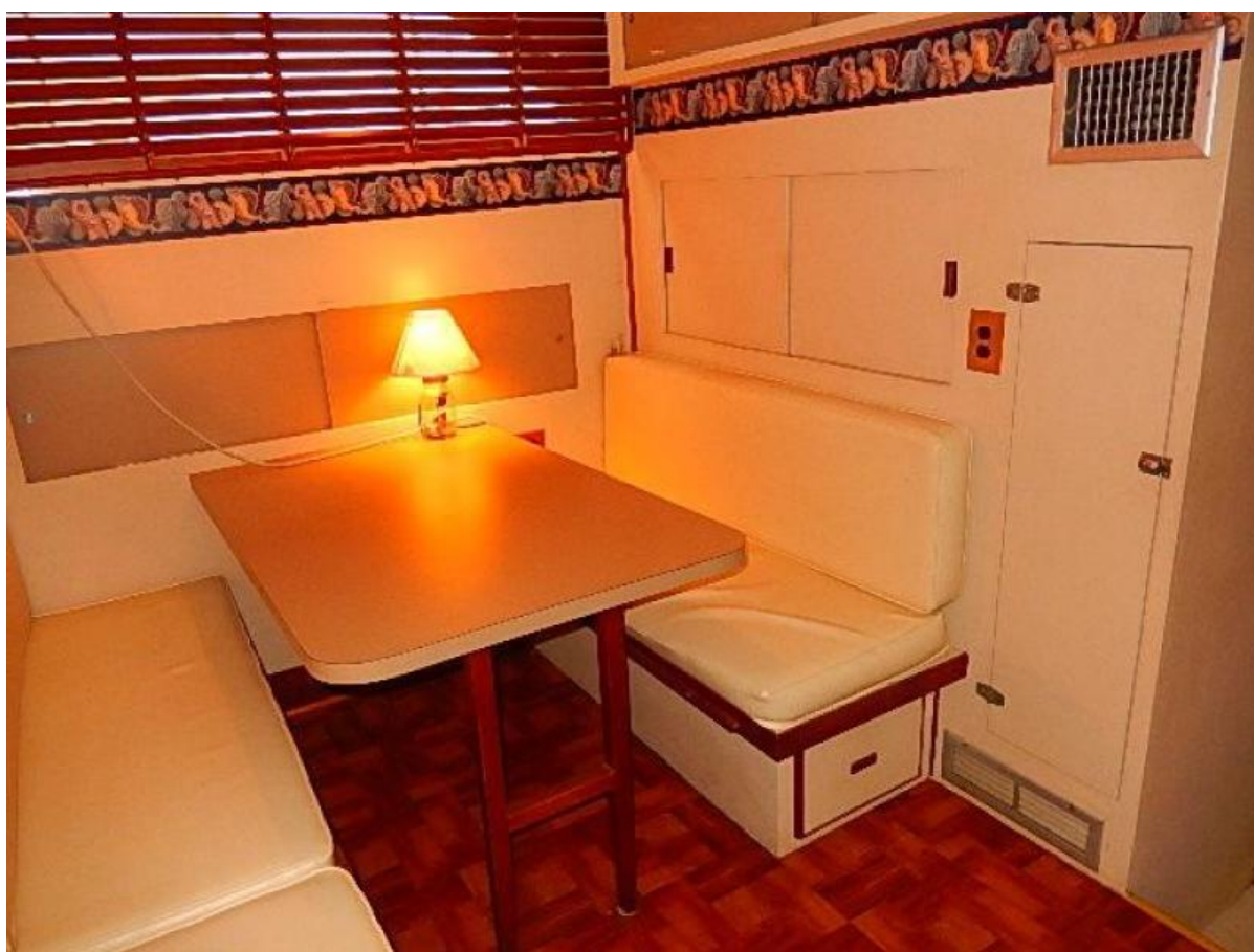
Large dinette converts to double bed