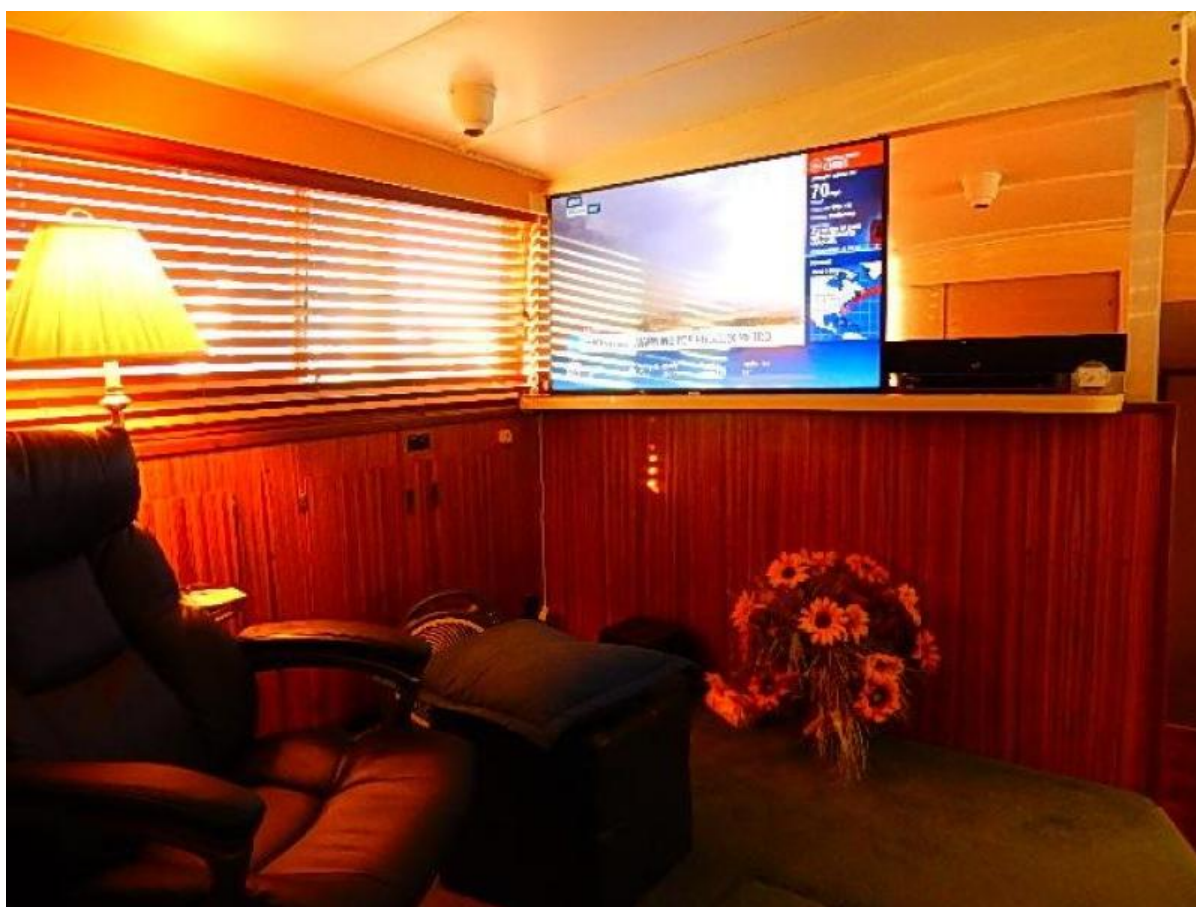
New 55 " flat screen Smart Samsung