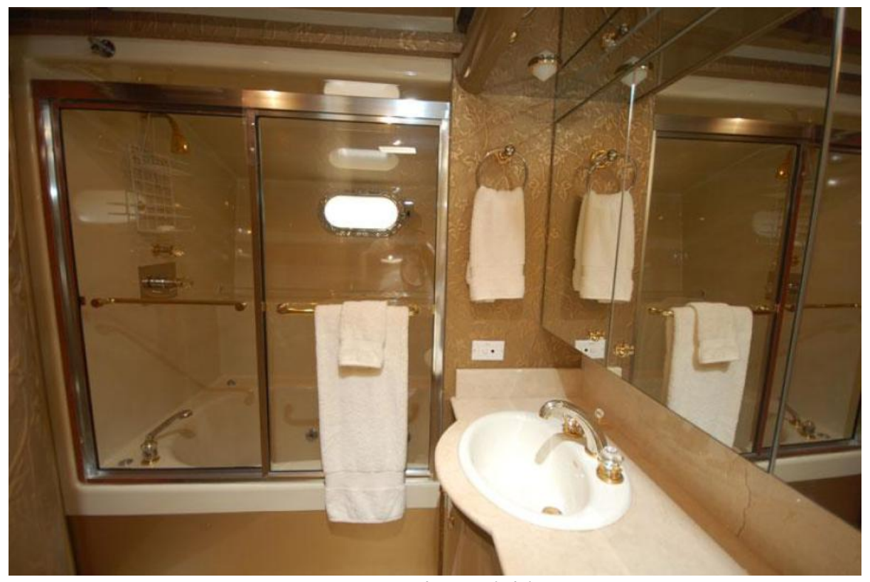
Master Bathroom (His)