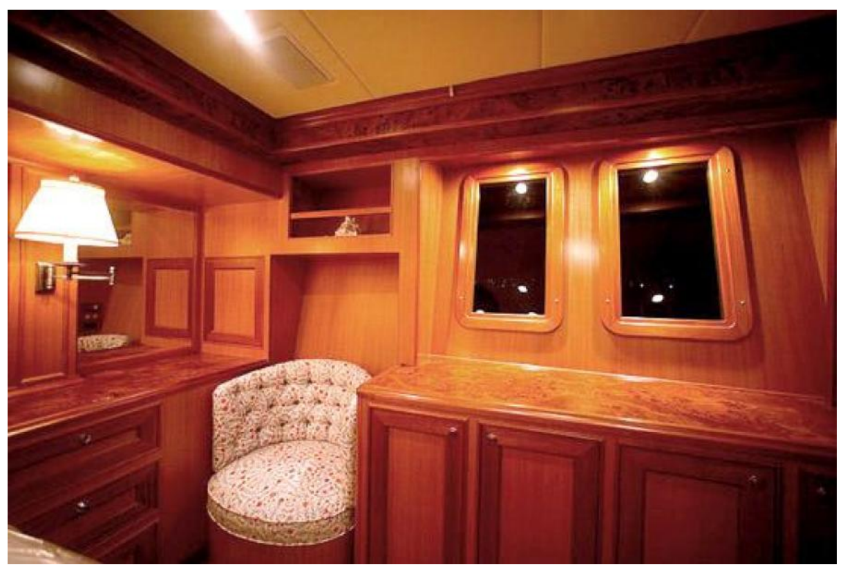
Master Stateroom Windows Master Stateroom Windows