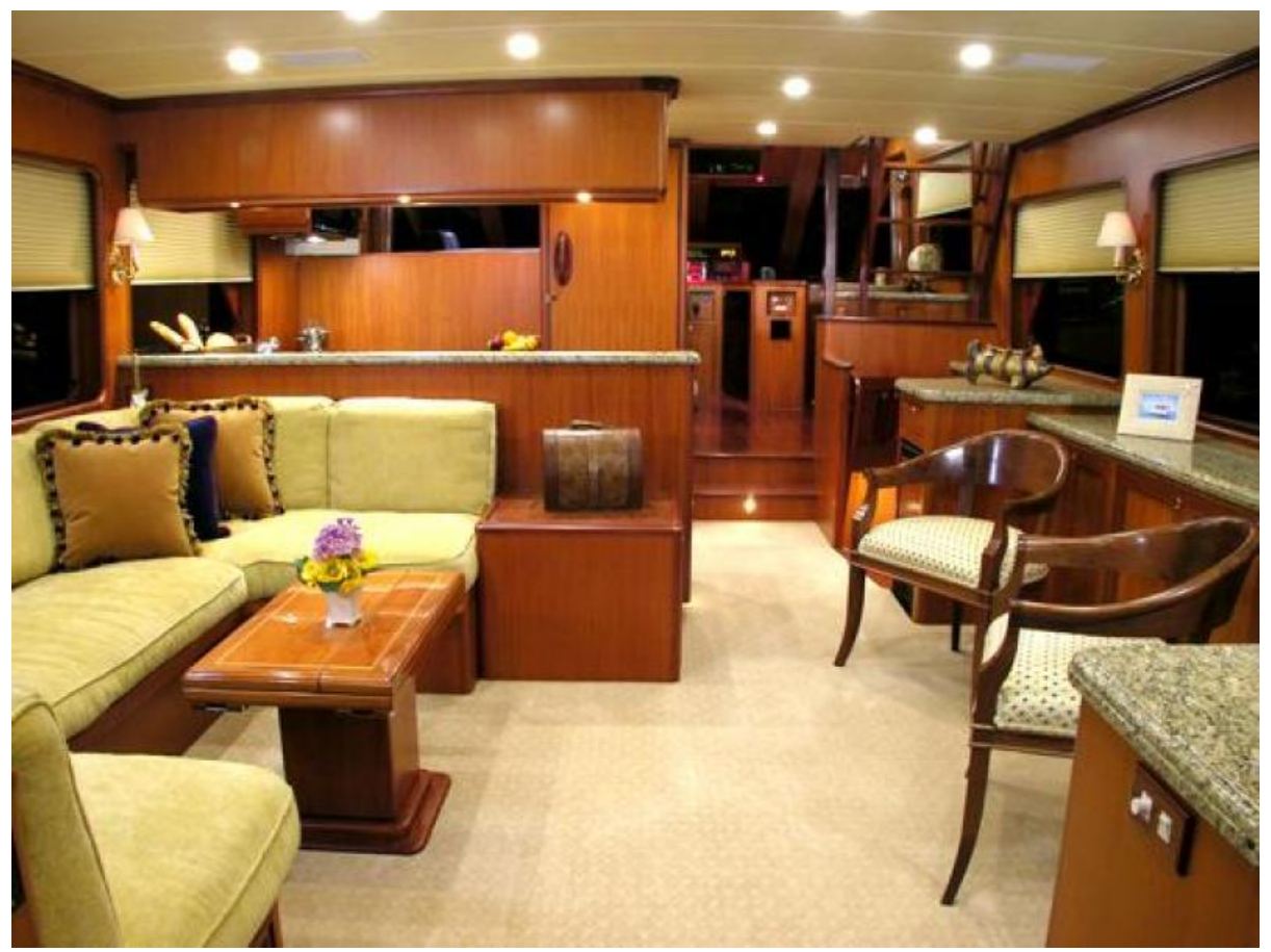
Salon Looking Forward Salon Looking Forward