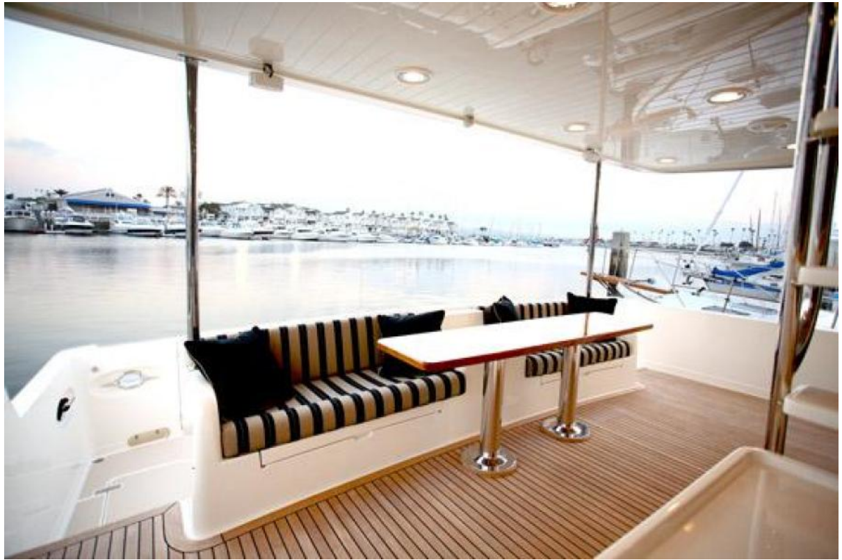
Cal Deck Settee Cal Deck Settee