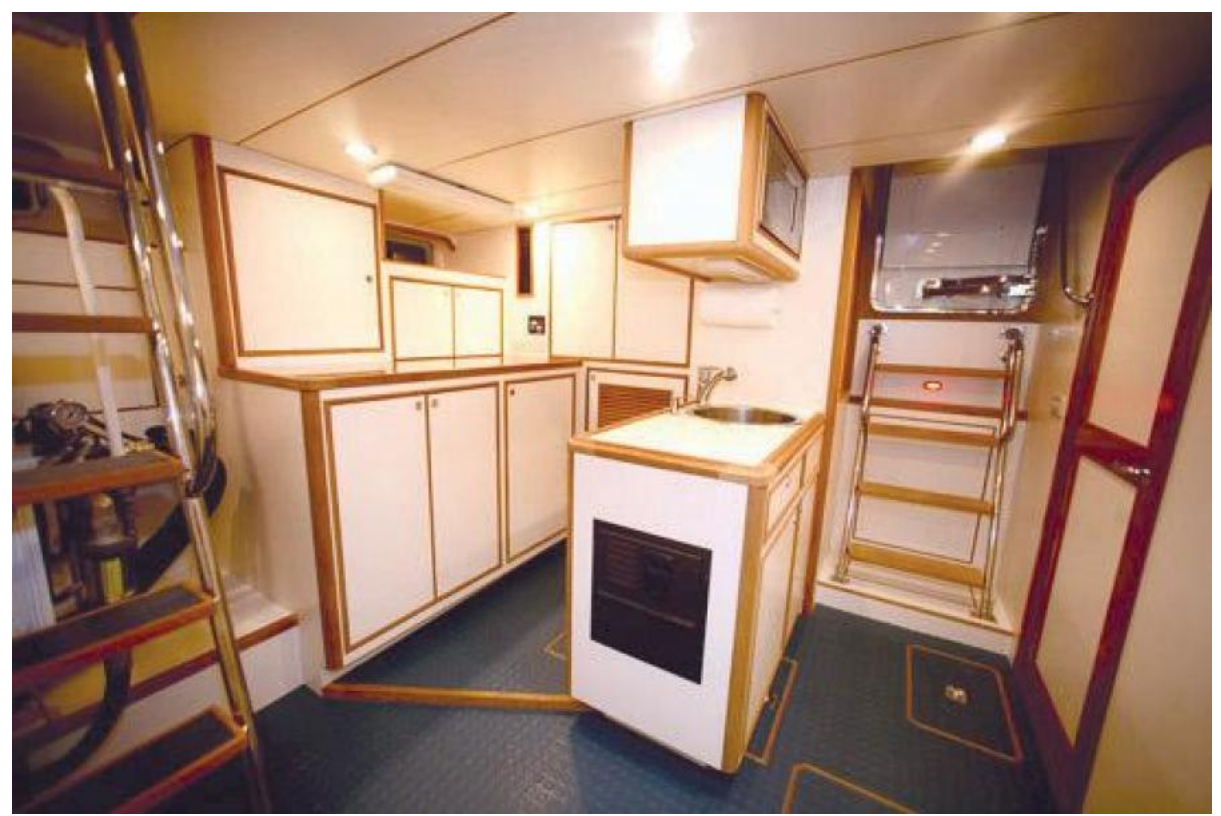
Utility Room Utility Room