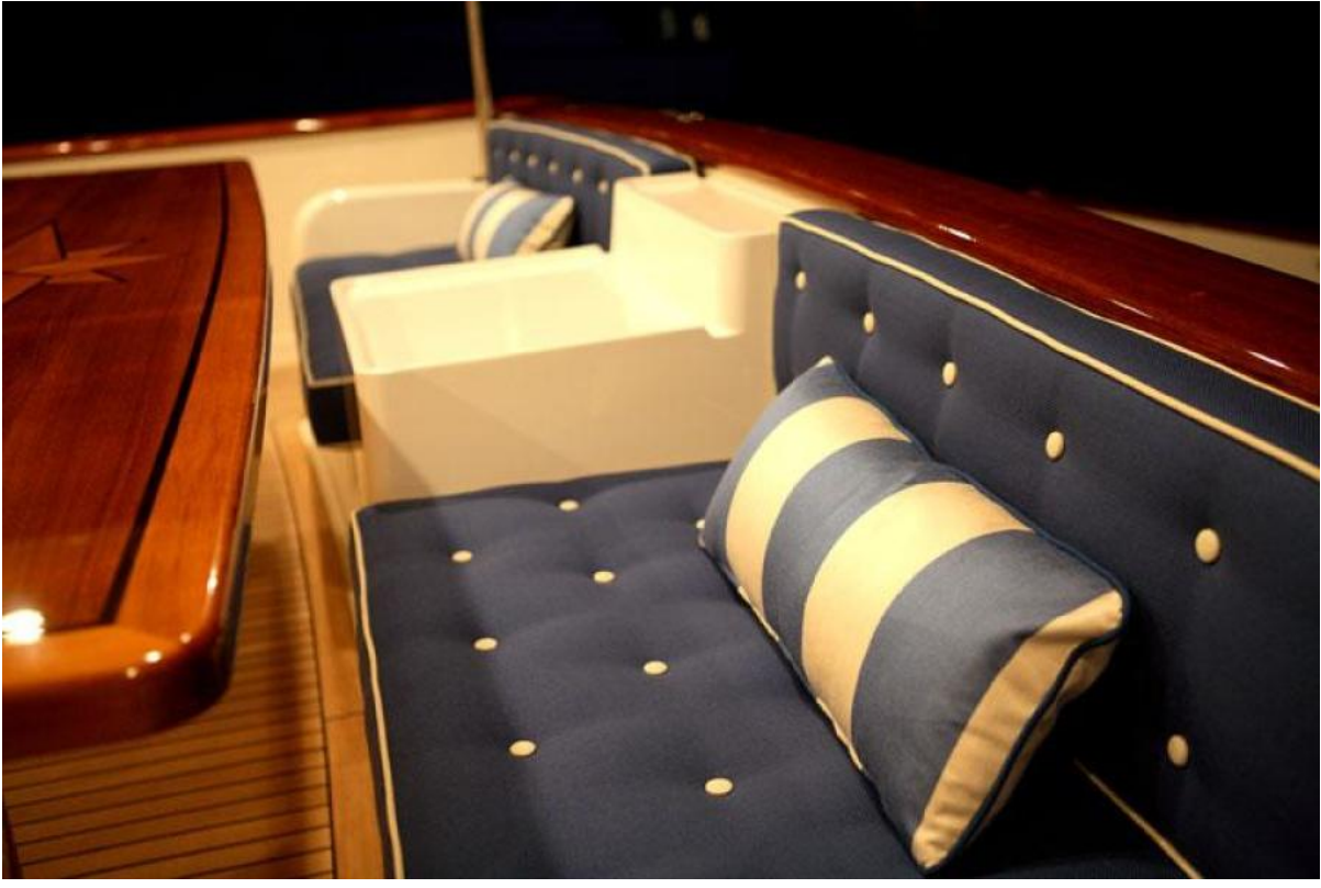
Cal Deck Settee Cal Deck Settee