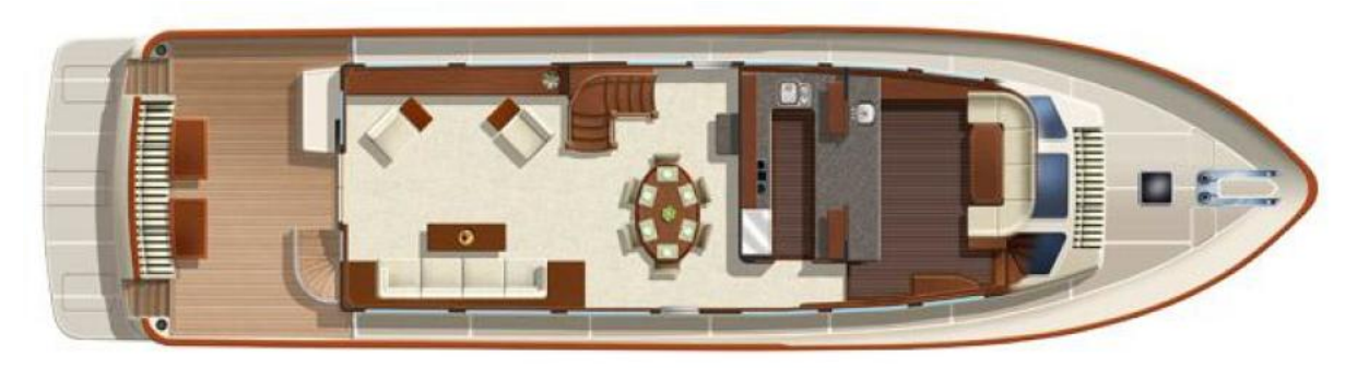
87 Standard Main Deck 87 Standard Main Deck