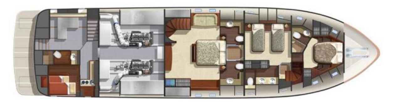
87 Standard Lower Deck 87 Standard Lower Deck