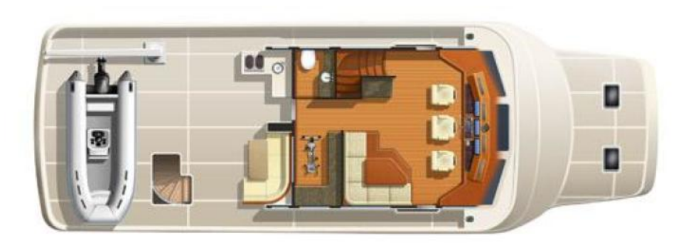
87 / 92 Wheelhouse & Boat Deck