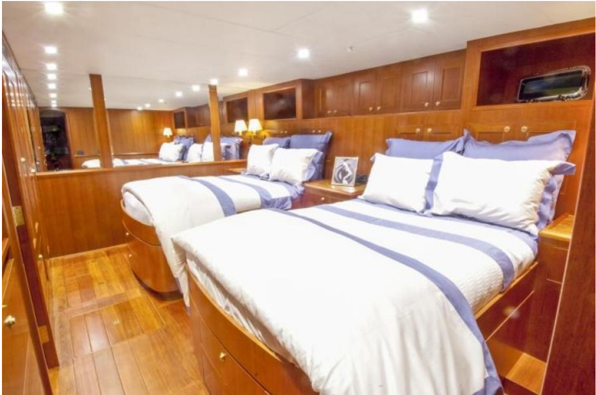
Guest Stateroom Guest Stateroom