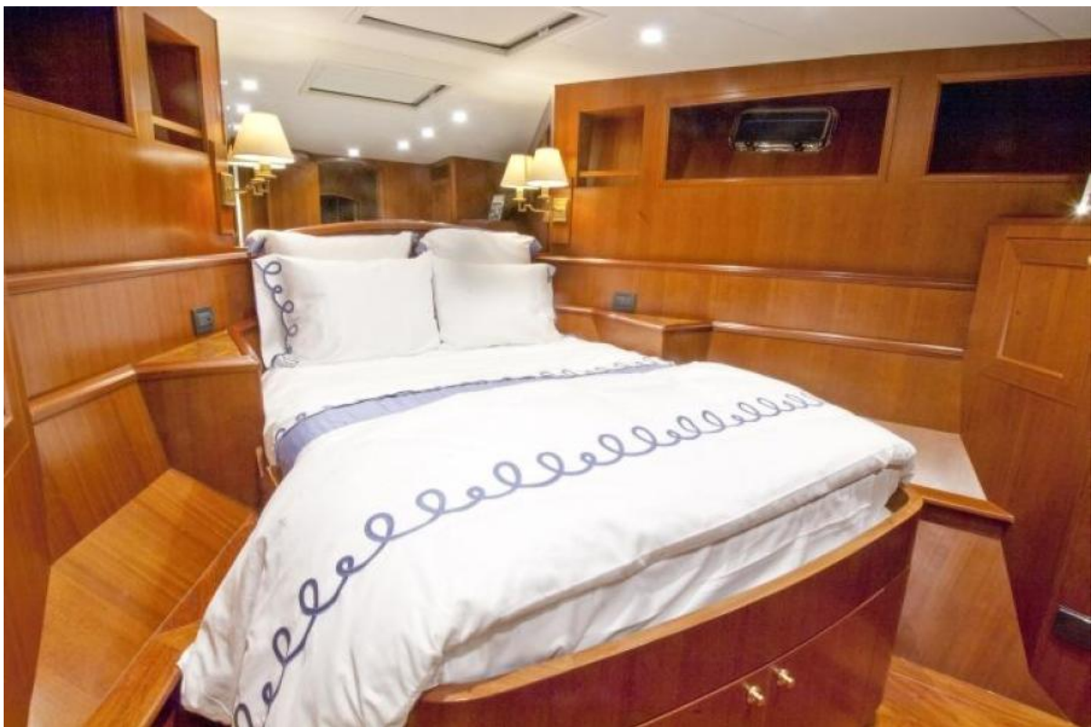
Forward VIP Stateroom Forward VIP Stateroom