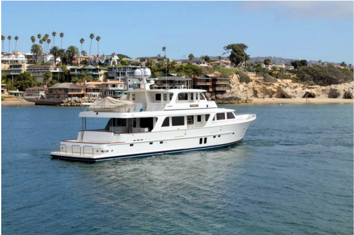
Aft View Profile Aft View Profile