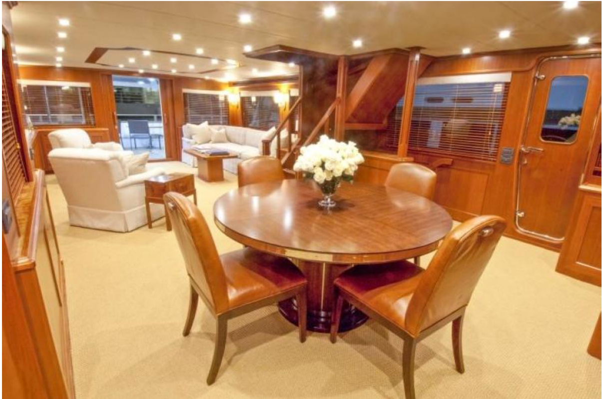
Salon Looking Aft Salon Looking Aft