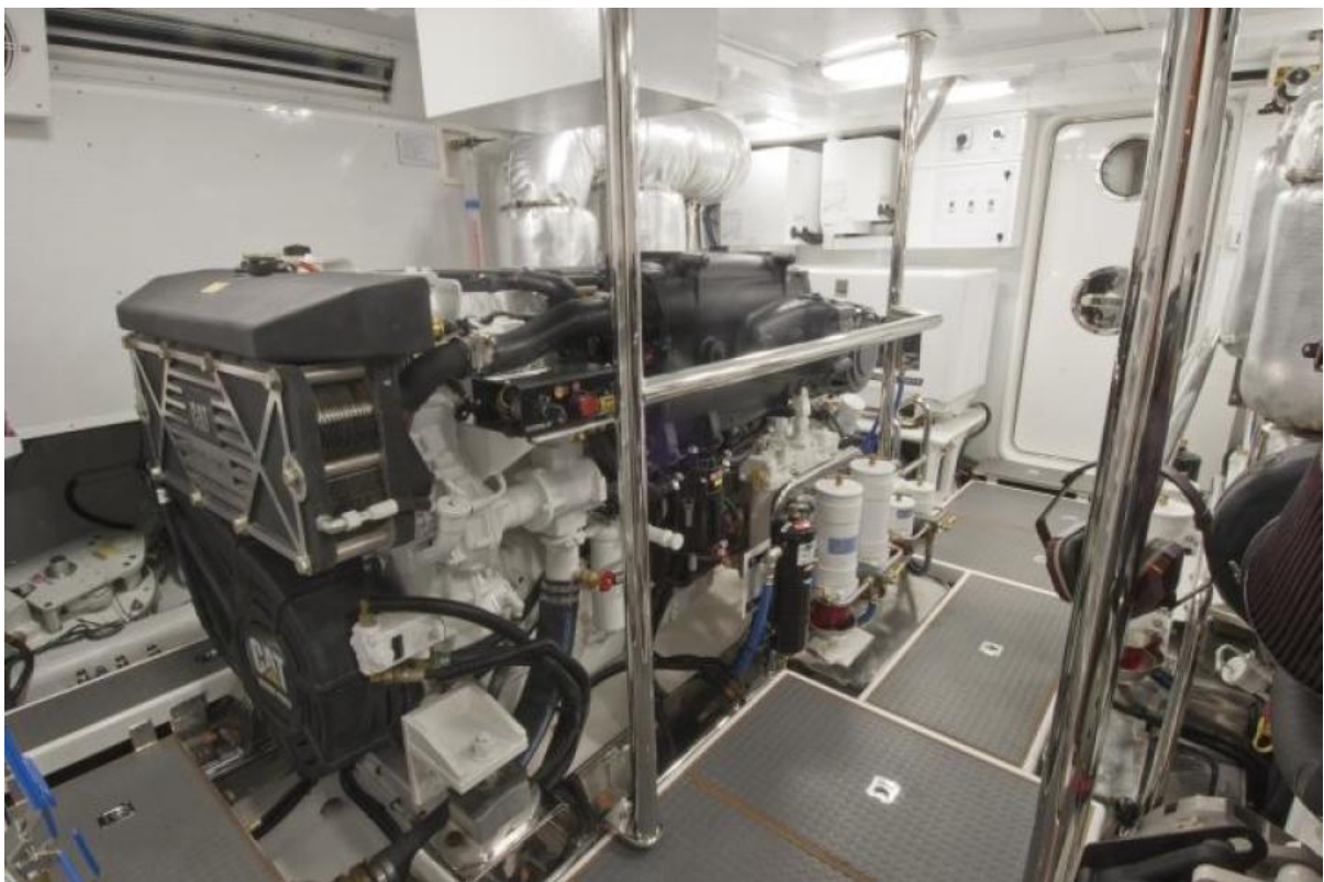
Engine Room Engine Room