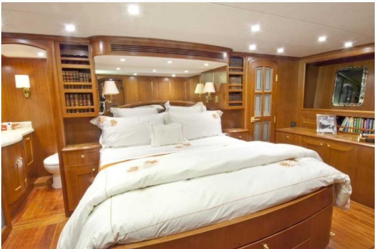
Master Stateroom Master Stateroom