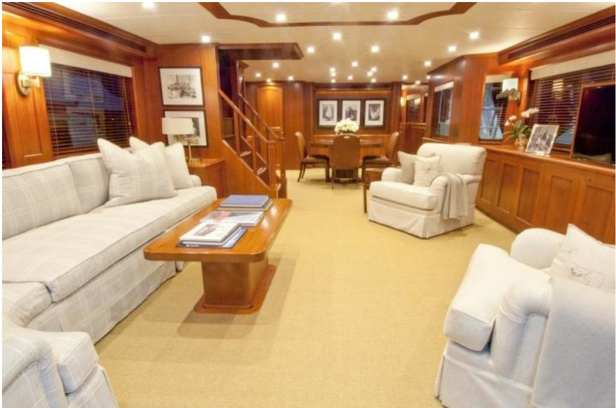
Salon Looking Forward Salon Looking Forward