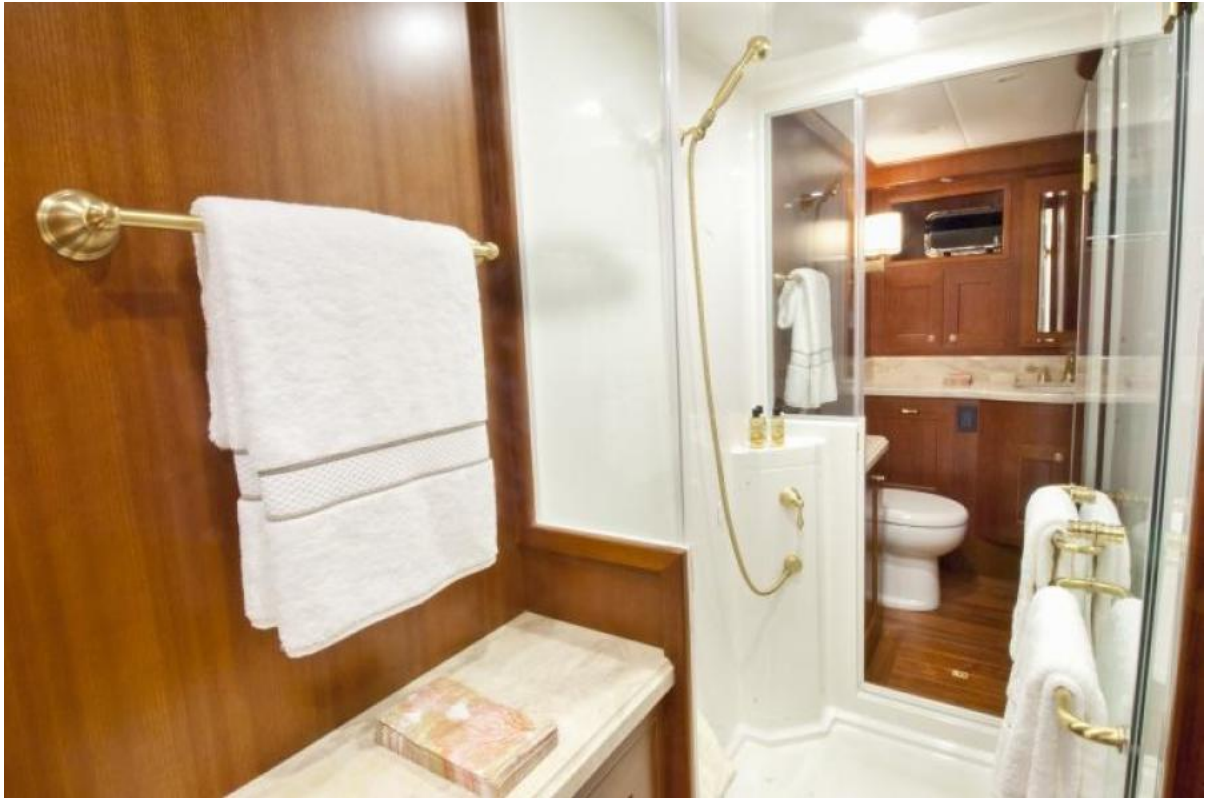
Master Head Master Head