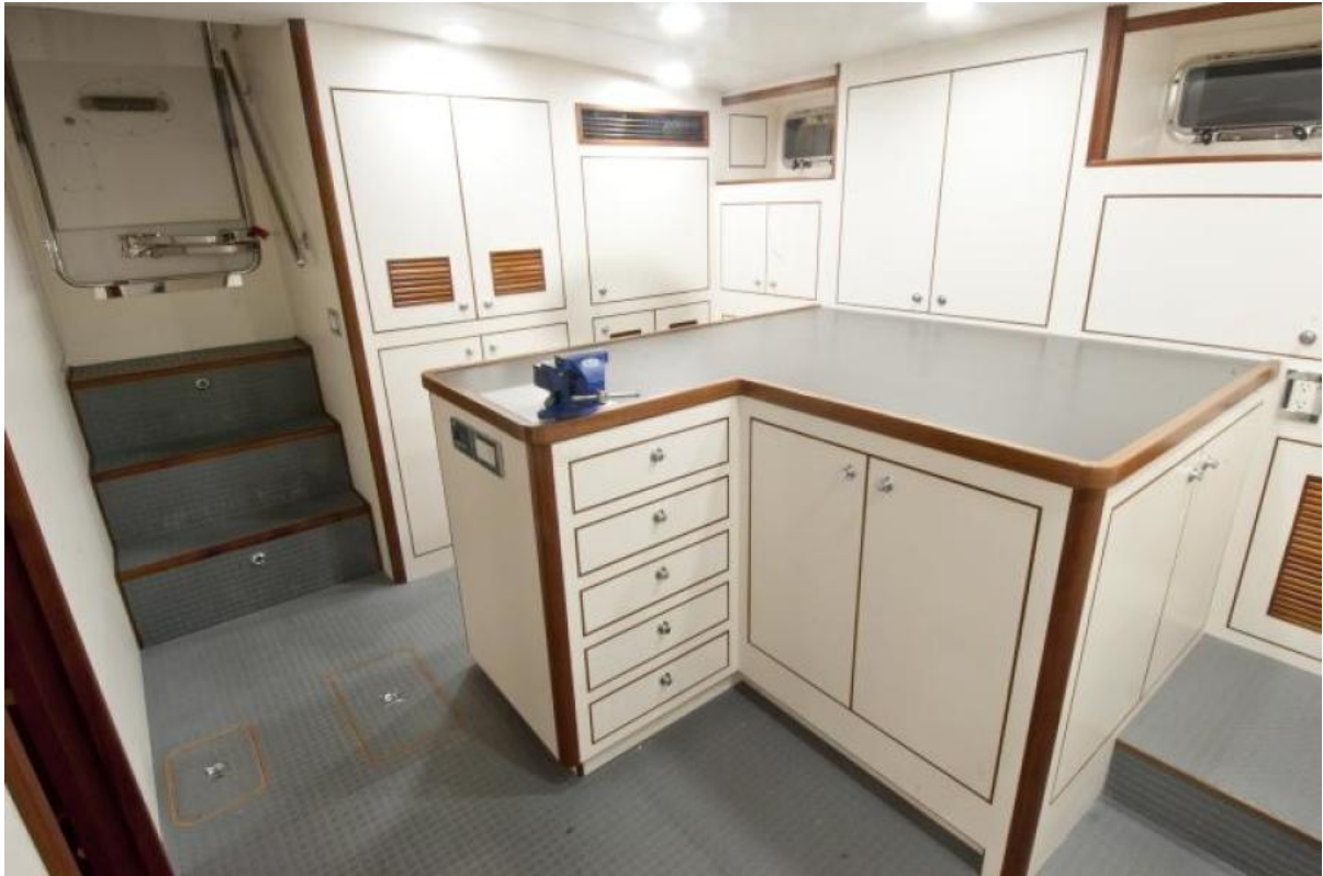
Utility Room Utility Room