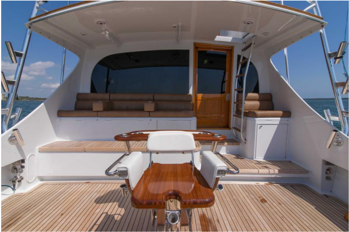
*Fighting Chair Replaced with Rocket Launcher