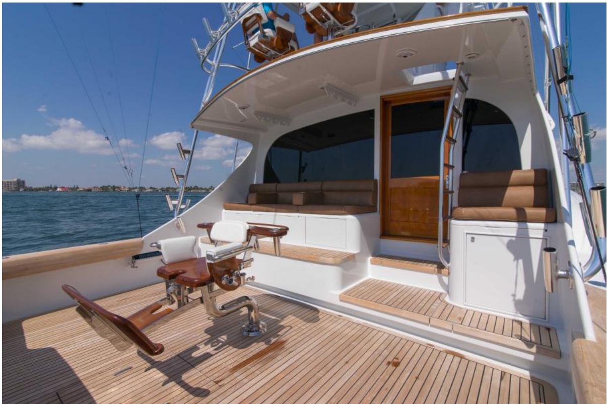
*Fighting Chair Replaced with Rocket Launcher