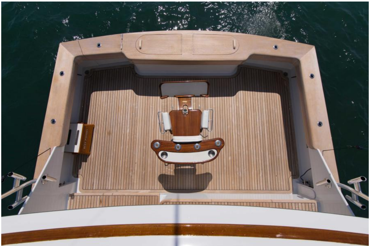
*Fighting Chair Replaced with Rocket Launcher