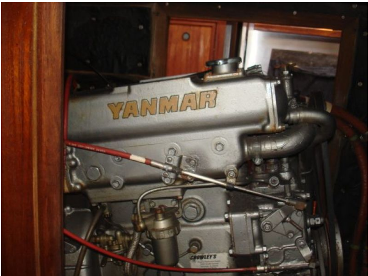
35 HP Yanmar Cruise along at 6+ knots when the windspeed drops.