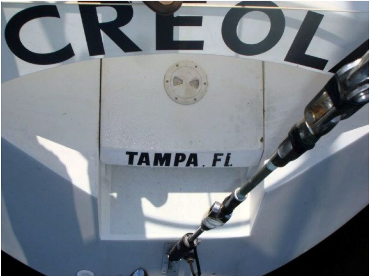
Swim ladder and transom Step up