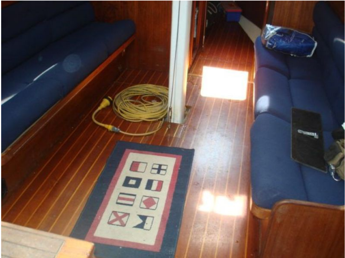
Teak & Holly in beautiful condition