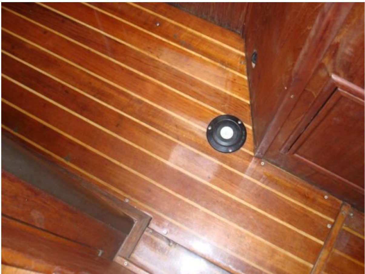
Fresh water foot pump