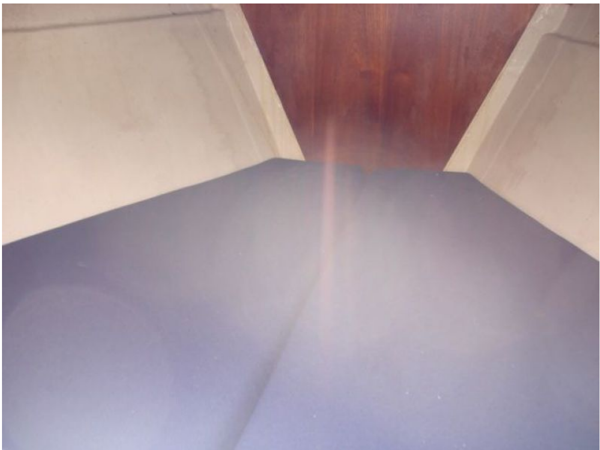
Forward "V" sleeps two crew members comfortably