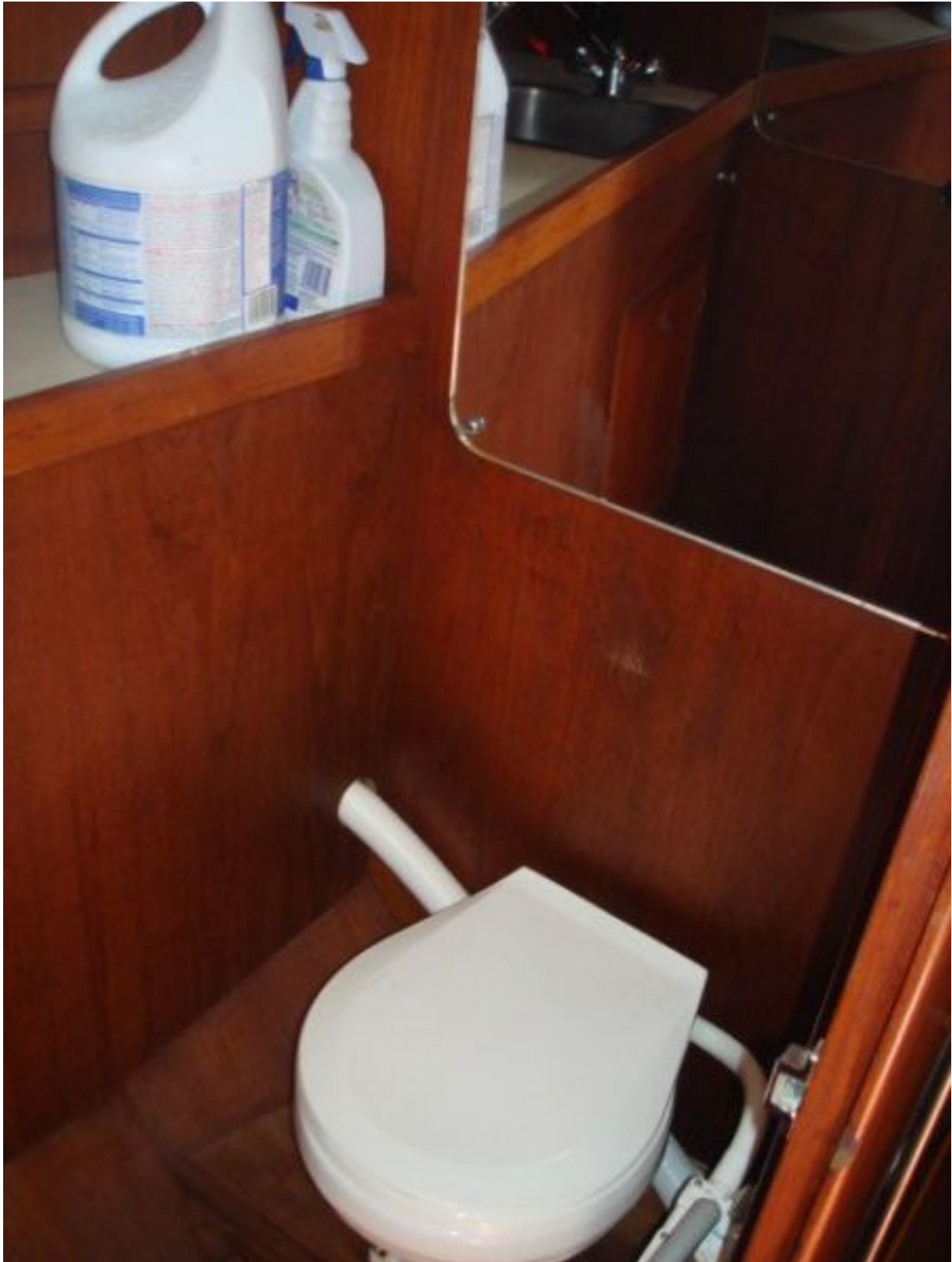
Manual marine toilet