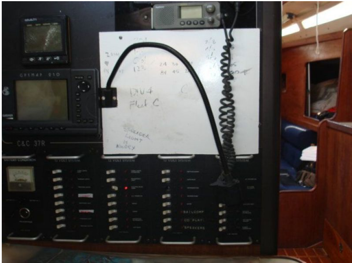
Wind, Speed & Radio Repeaters