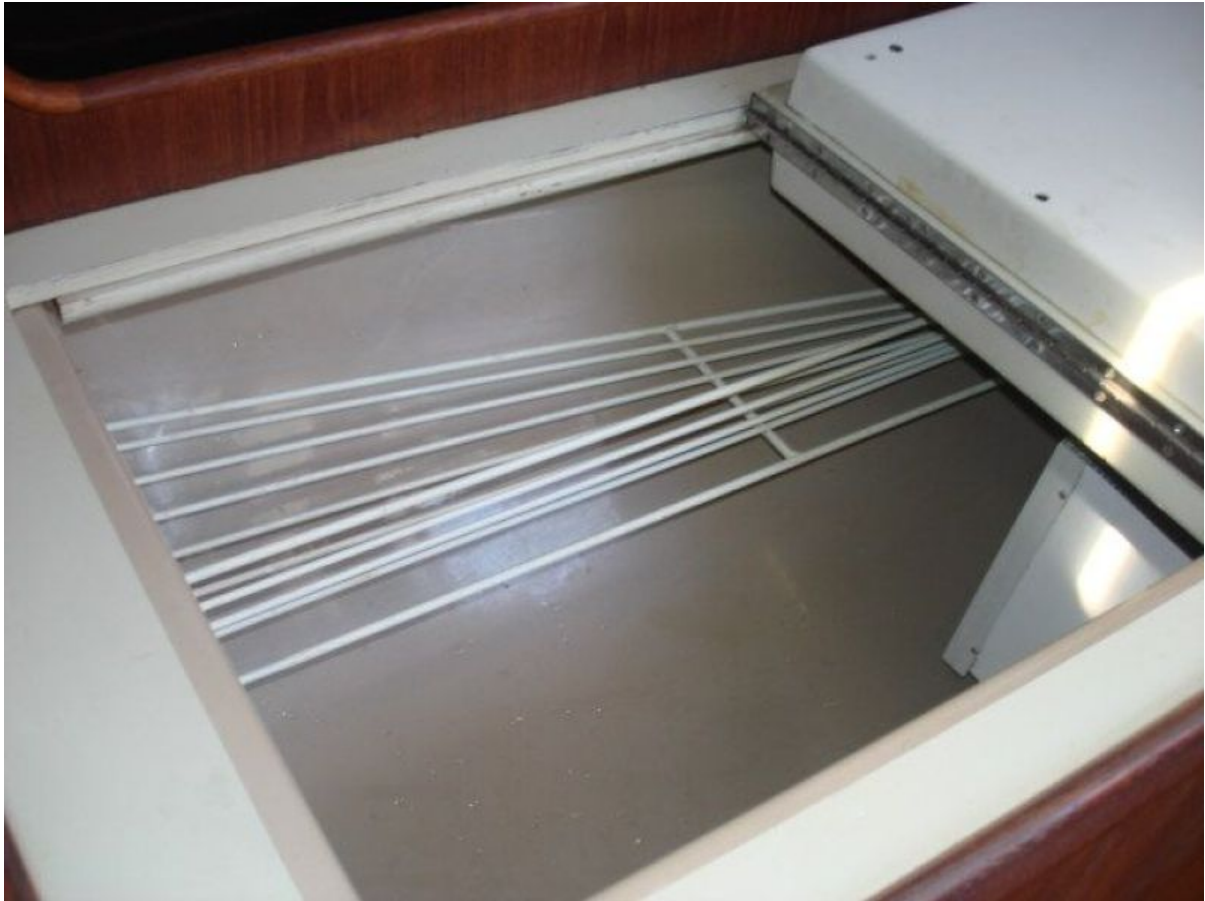
Refrigerated Icebox & freezer