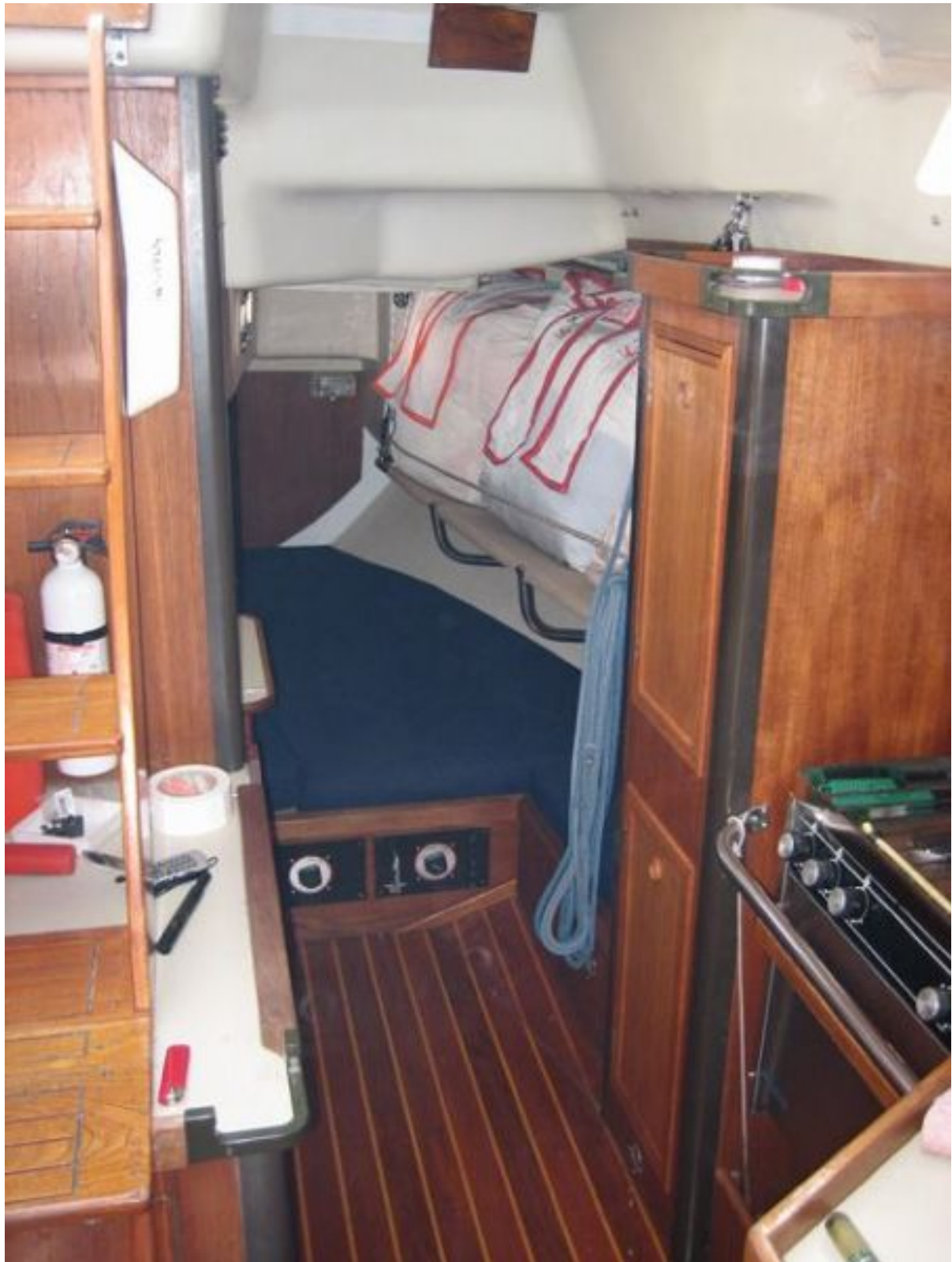
Aft of Galley