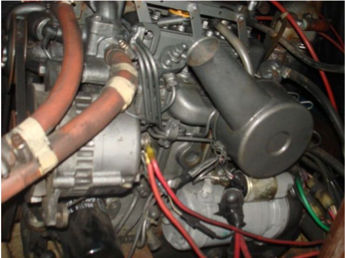
Yanmar (Portside view) Easy Access