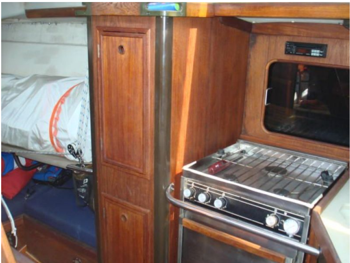
Loads of storage