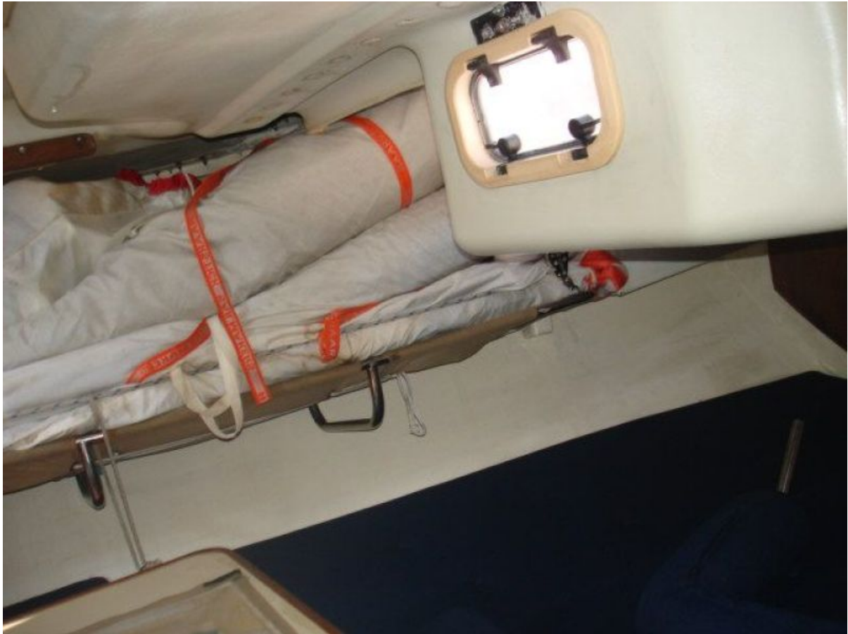
Pipe berths starboard & Port