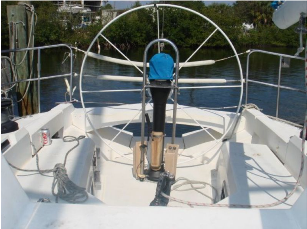
54" Destroyer Steering Wheel