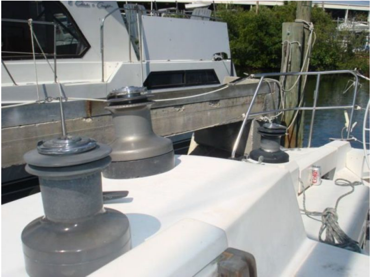
#35 Barient 2-Speed Winches