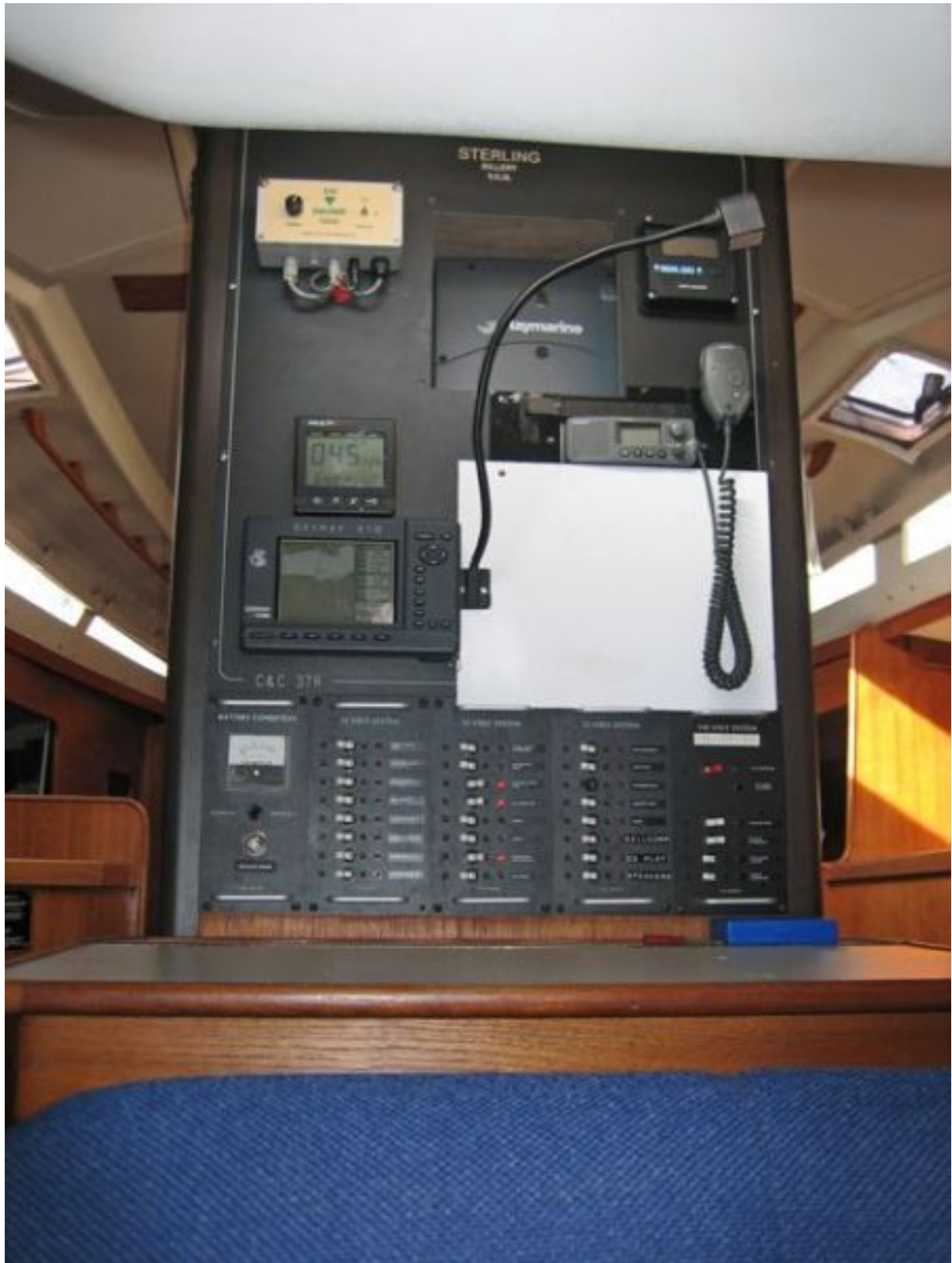
Electrical Panel/Nav Station