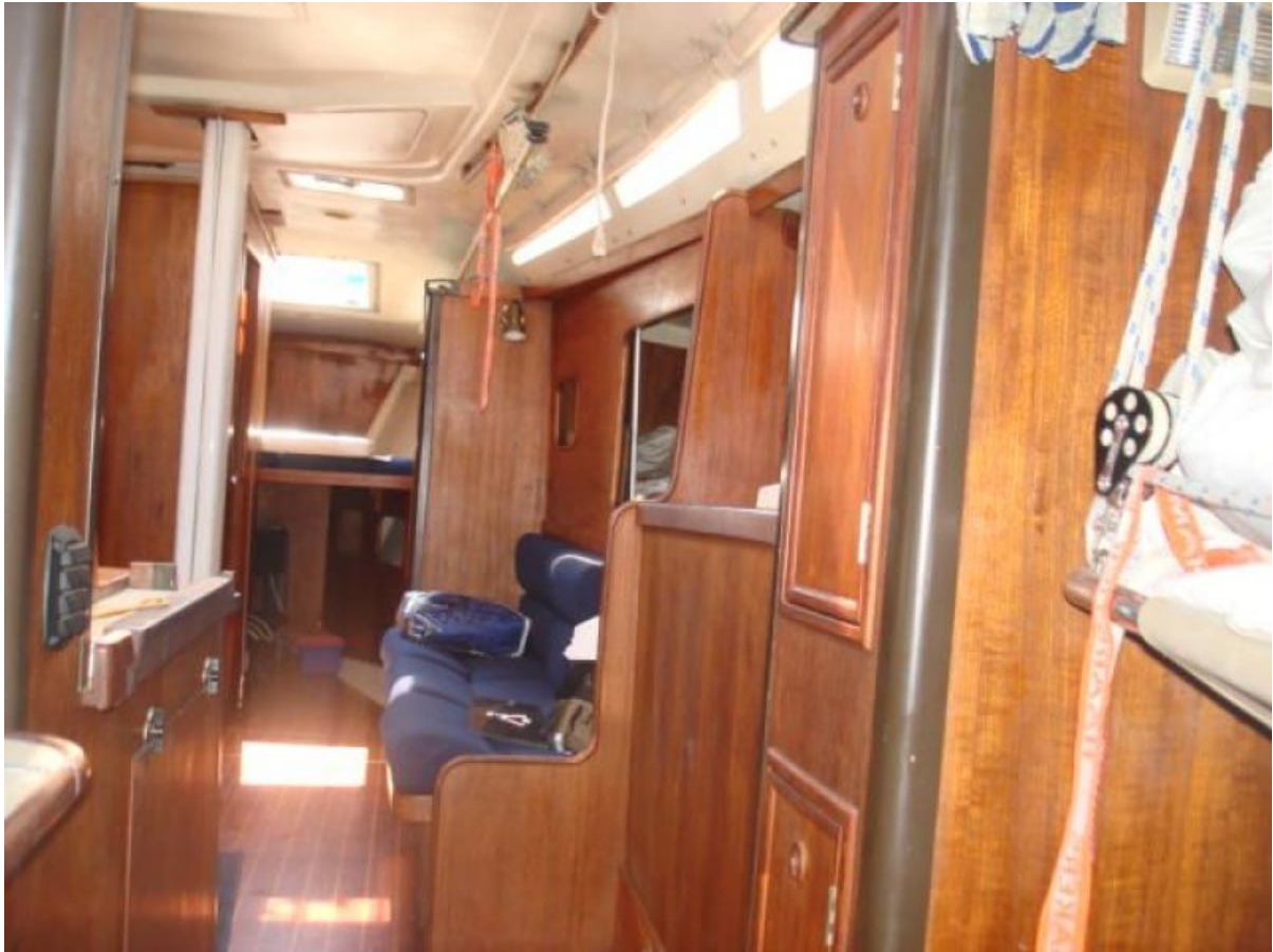
Looking aft port side