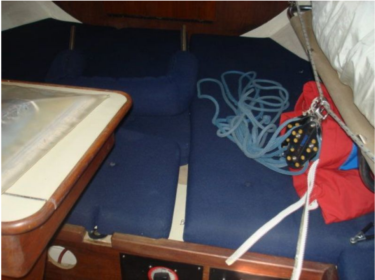
Aft cabin & Chart station This spacious area easily sleeps three adults.