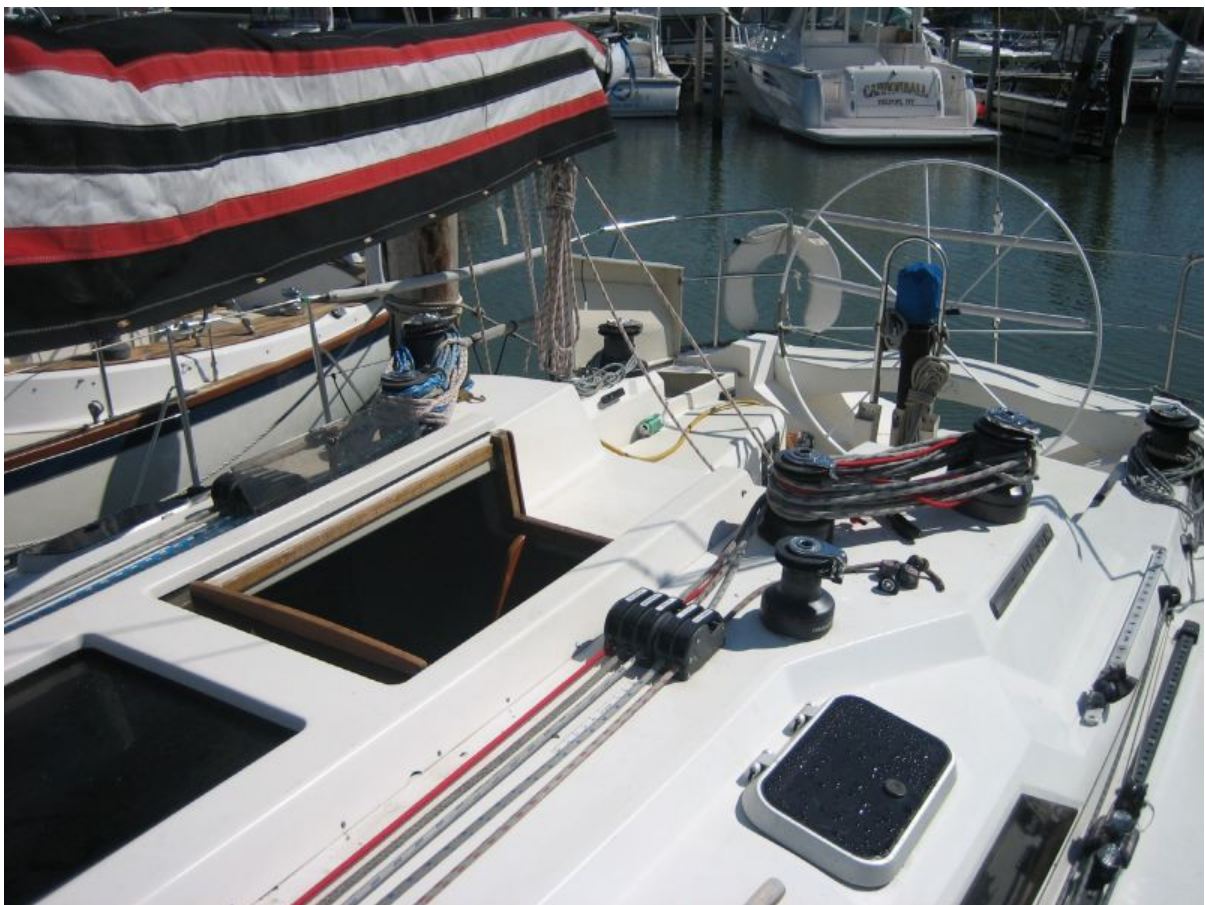
10 Line Clutches