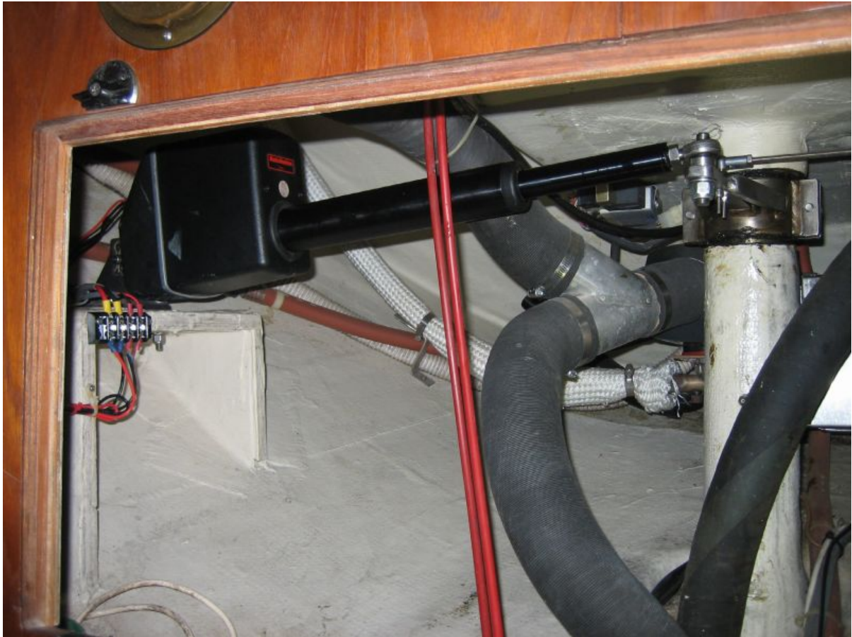
Ray Marine piston driven Auto-Pilot