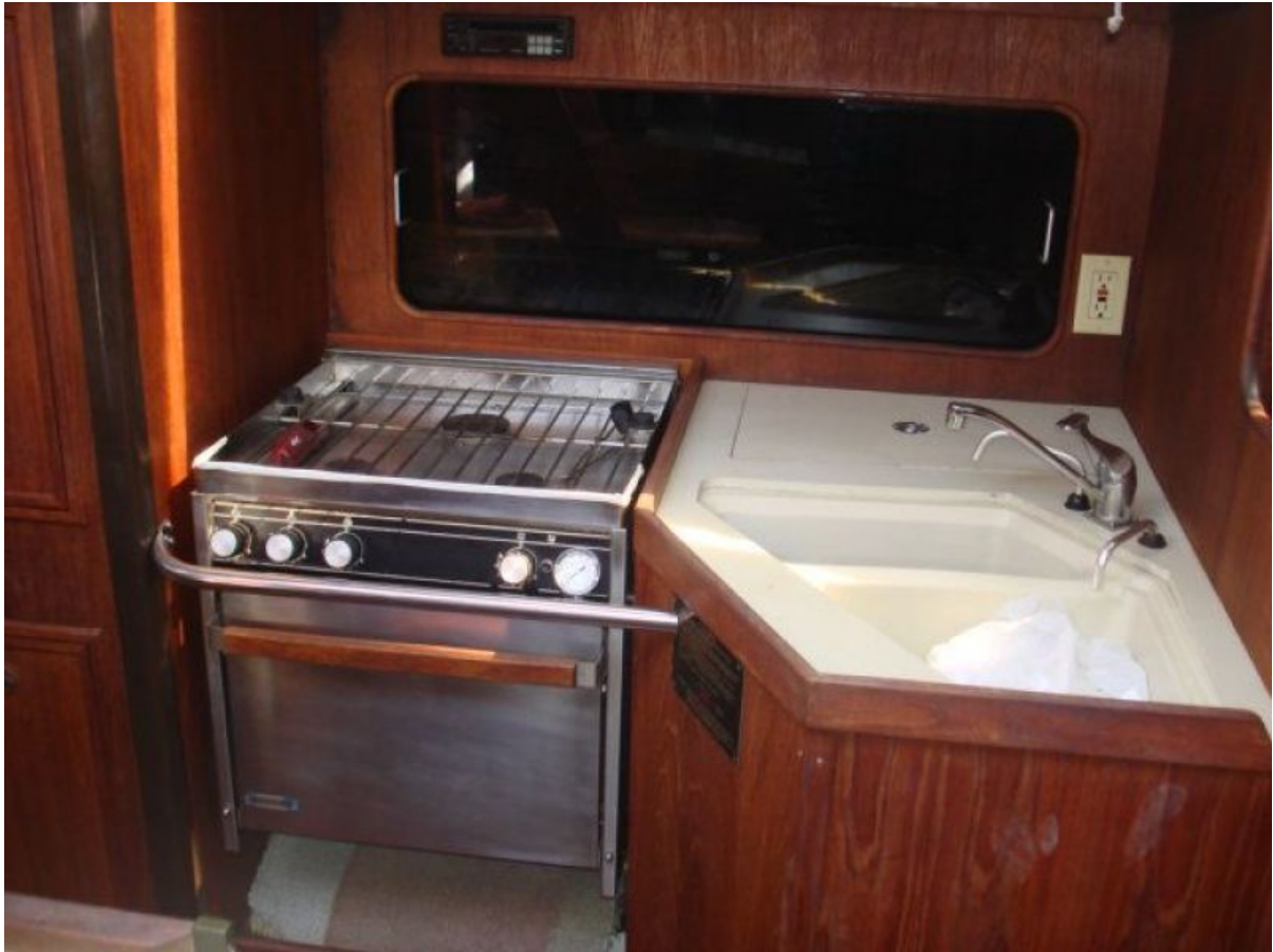
3-Burner Propane Stove