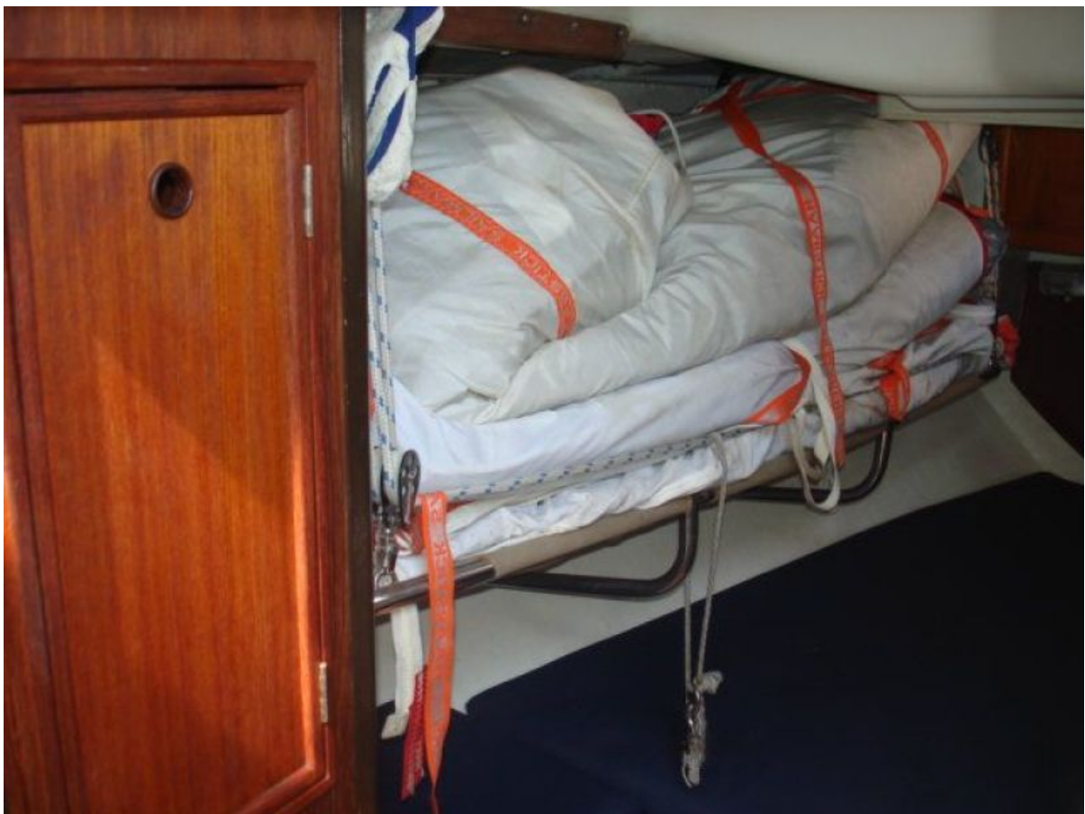
Pipe Berth Starboard Side