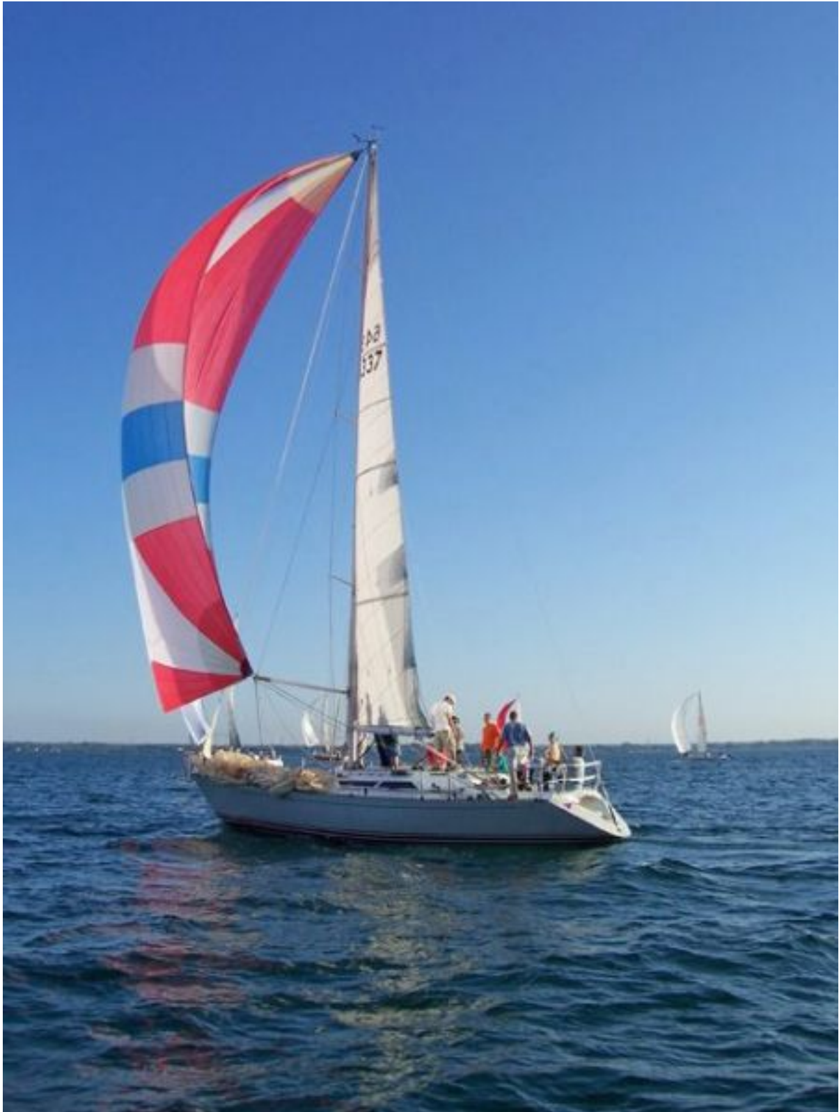
"Creola" Down Wind