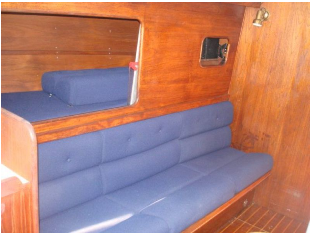
Pilot Berth Starboard Side