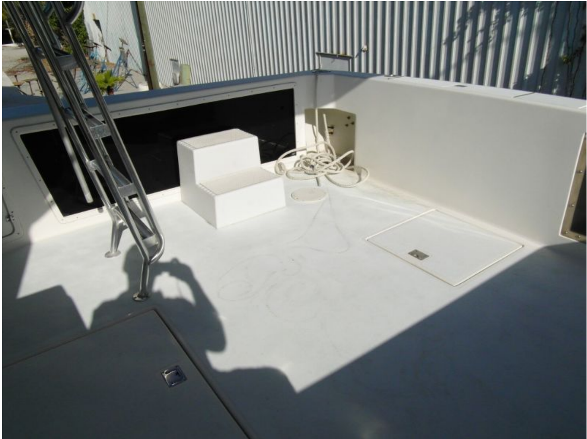
1995 Sportfish Cockpit Starboard