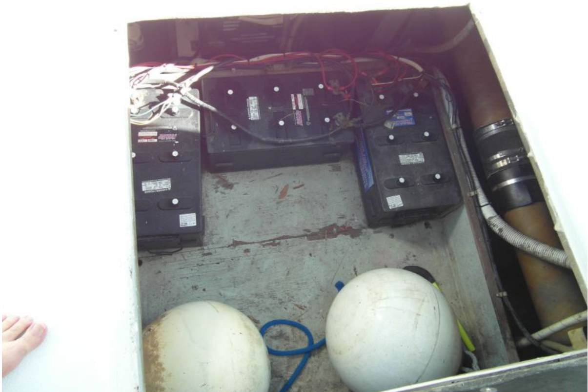
1995 Sportfish Batteries Below Cockpit