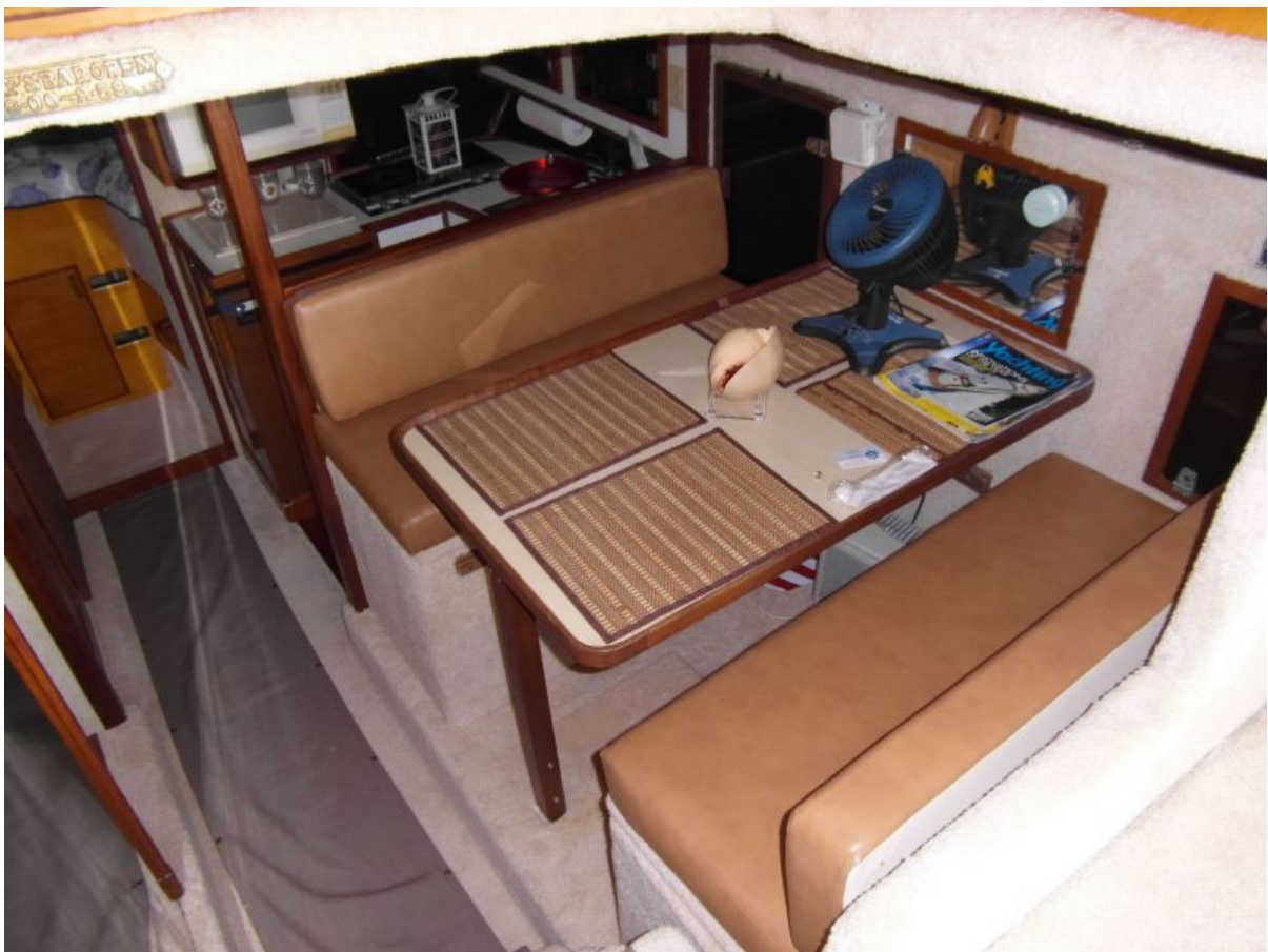
1995 Sportfish Dining From Salon