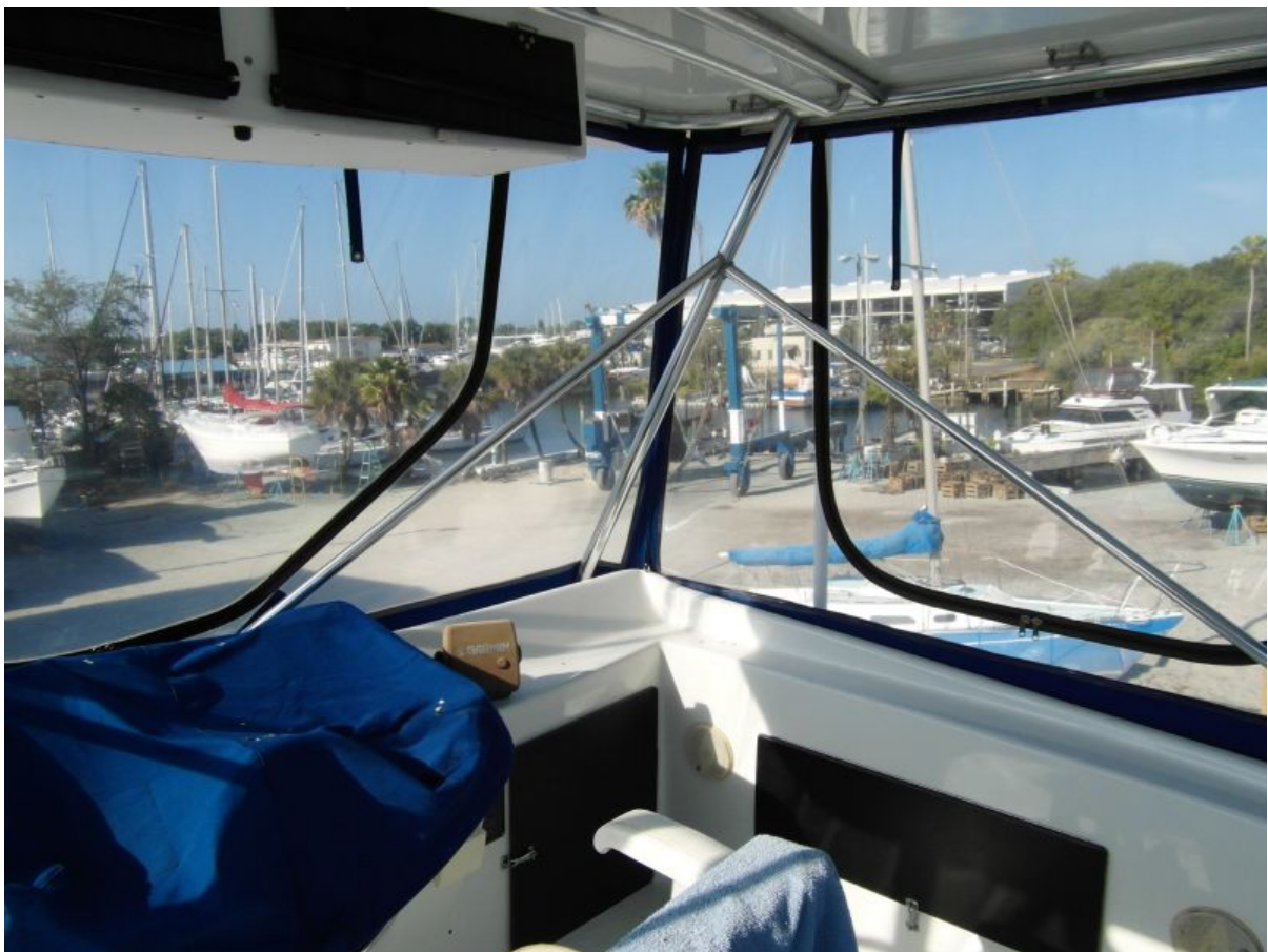
1995 Sportfish View From Flybridge