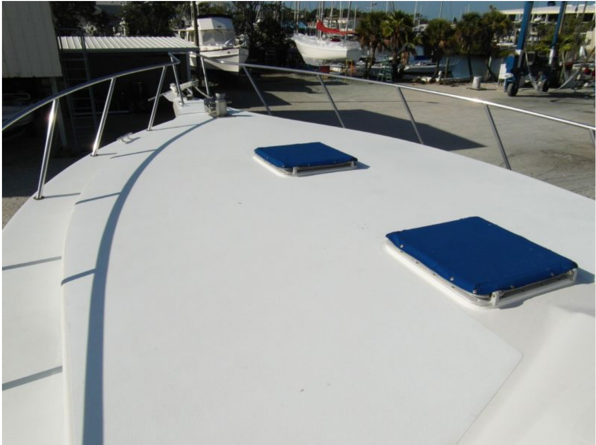
1995 Sportfish Bow