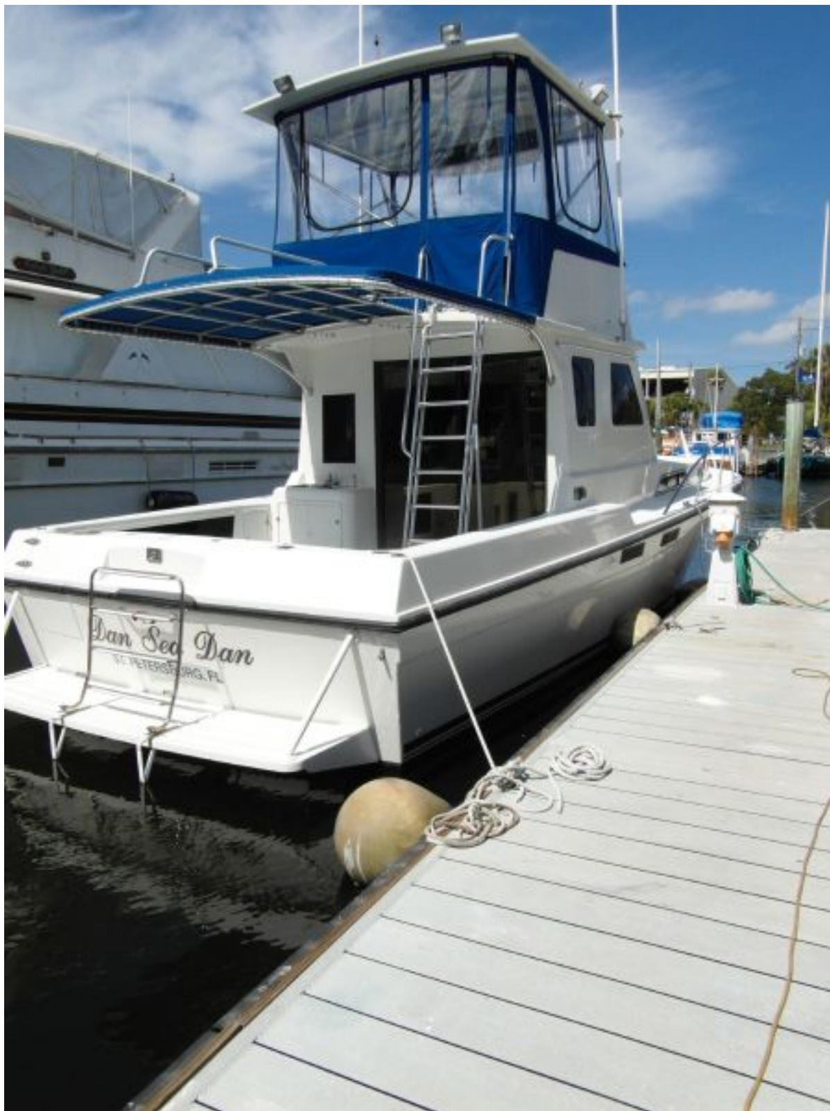
1995 Sportfish Starboard Stern NEW CANVAS / COVERED COCKPIT