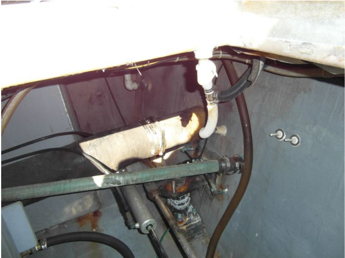
1995 Sportfish Engine Room