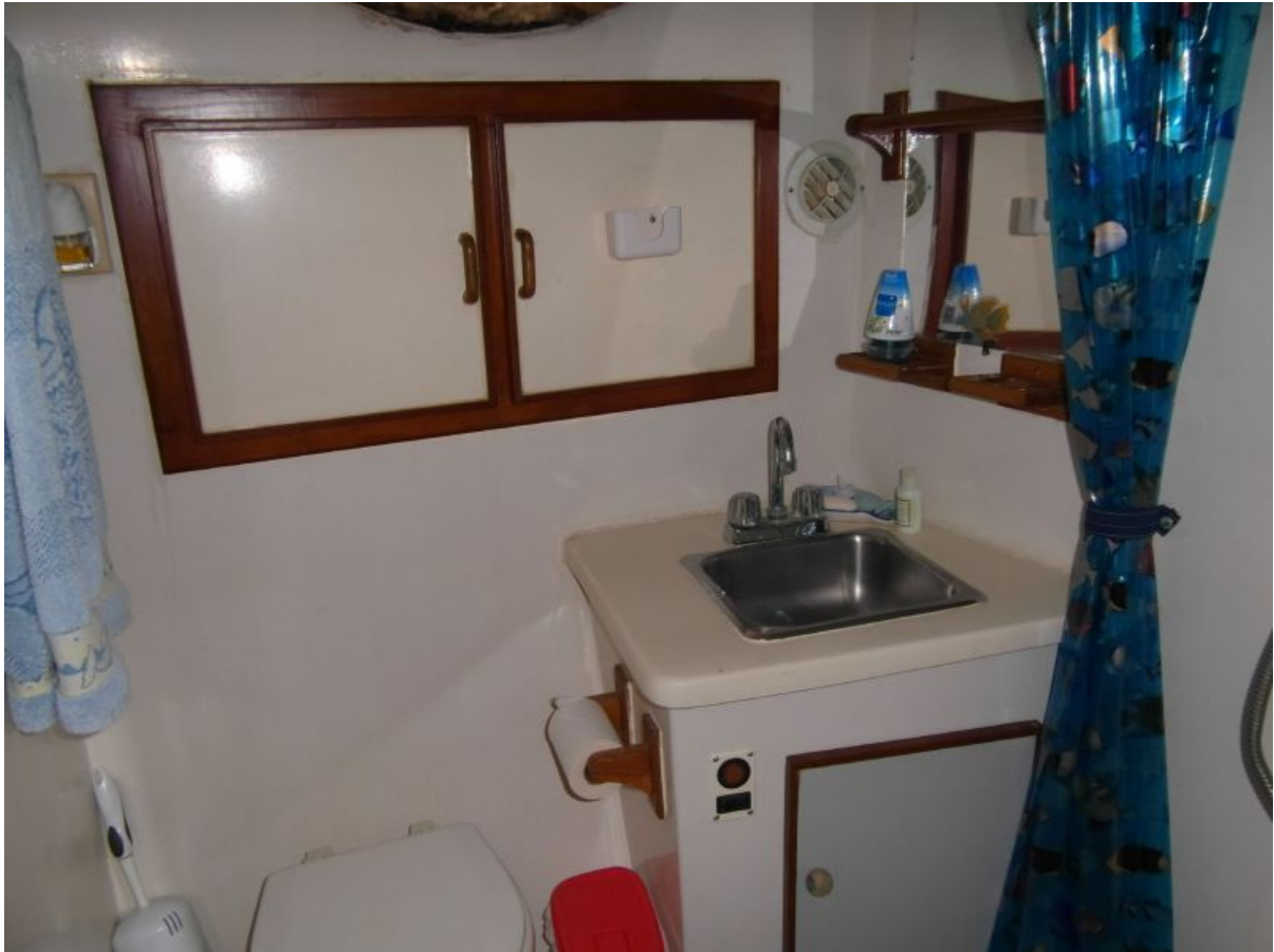
1995 Sportfish Head