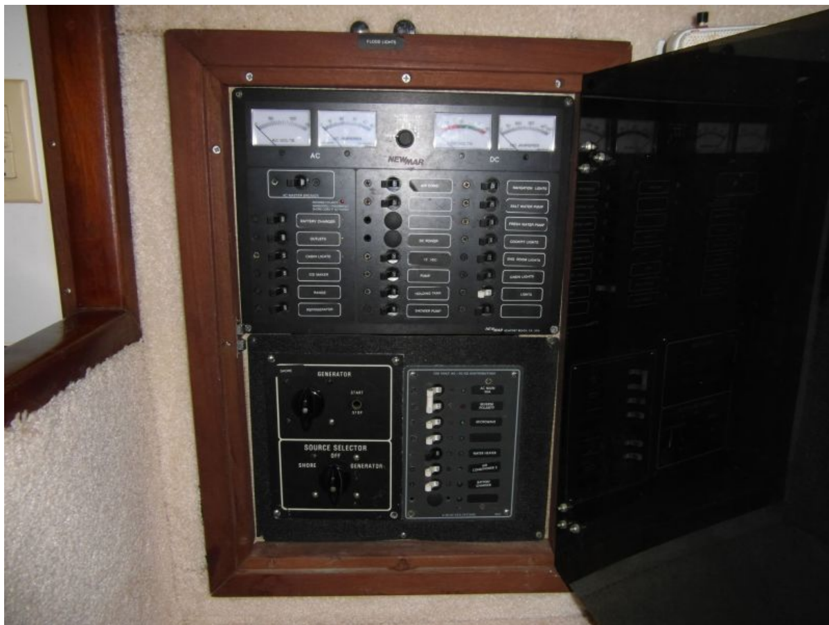
1995 Sportfish Control Panel