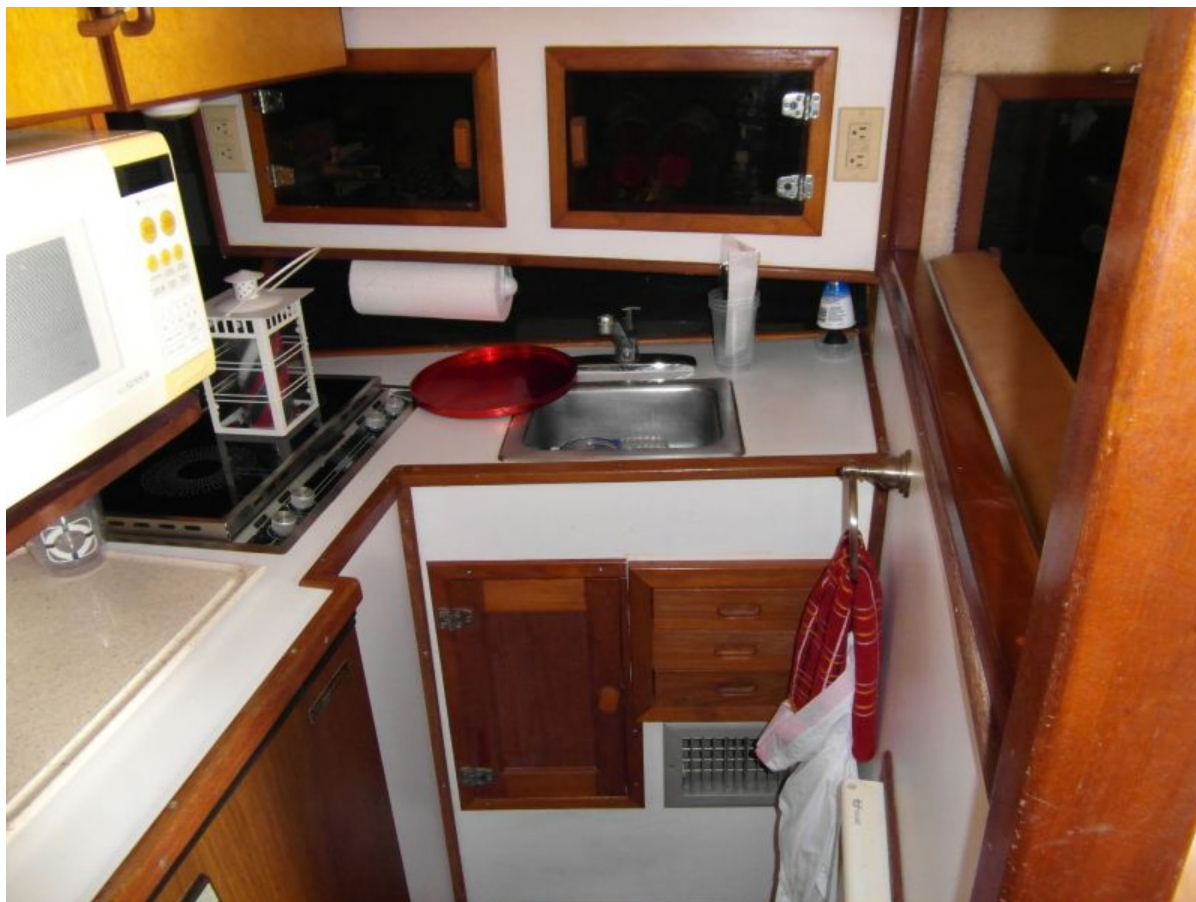
1995 Sportfish Starboard Galley