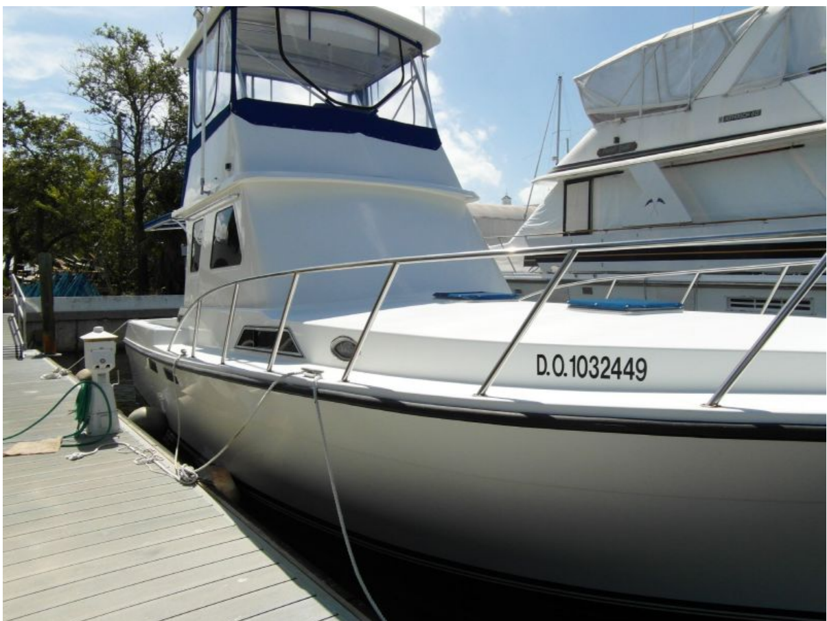
1995 Sportfish Starboard Bow