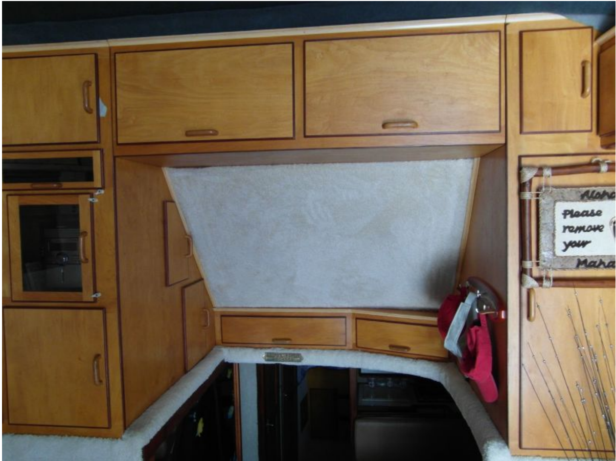
1995 Sportfish Salon Facing Forward