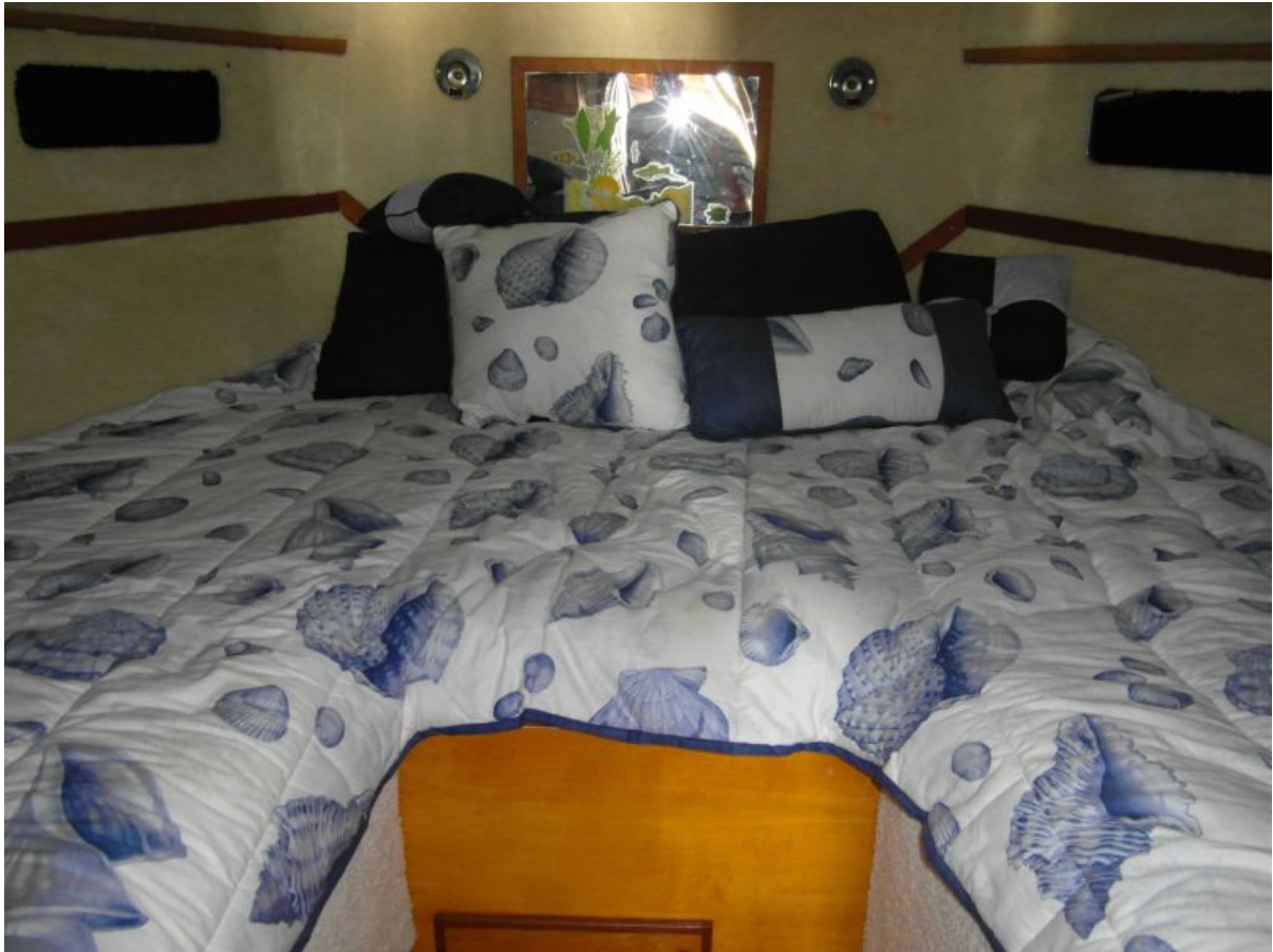
1995 Sportfish Forward Main Cabin