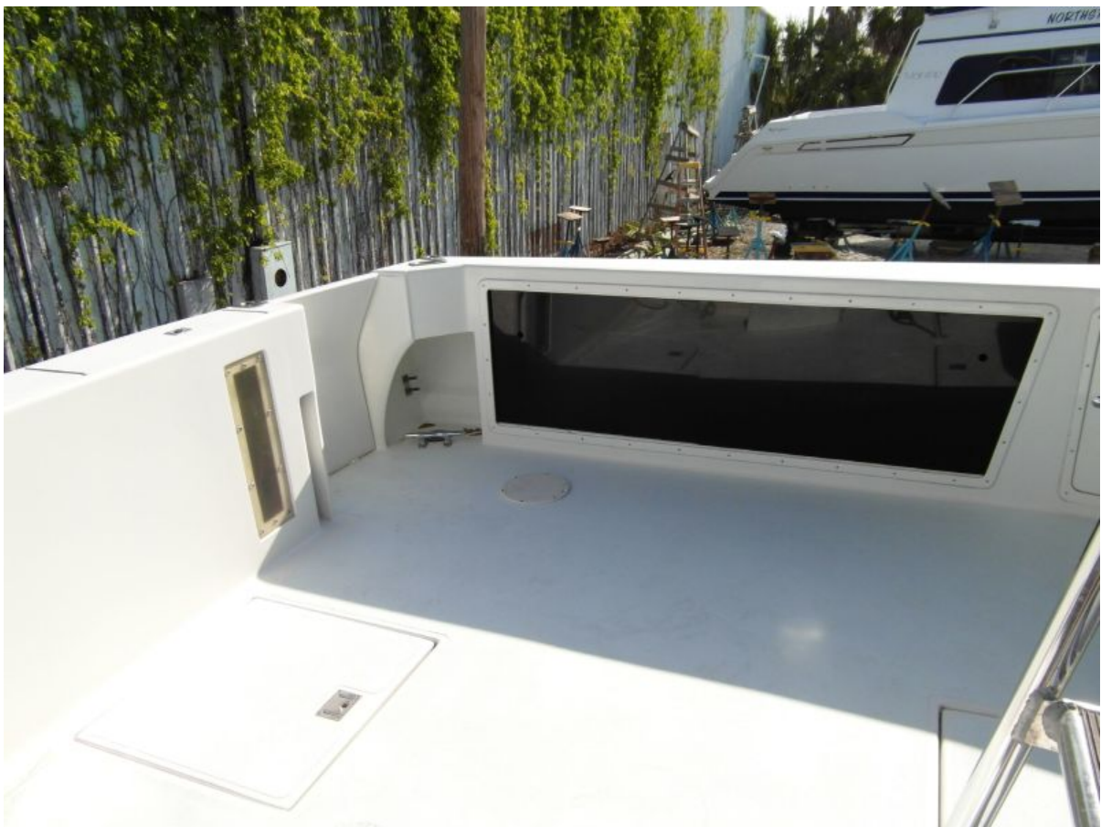
1995 Sportfish Cockpit Port