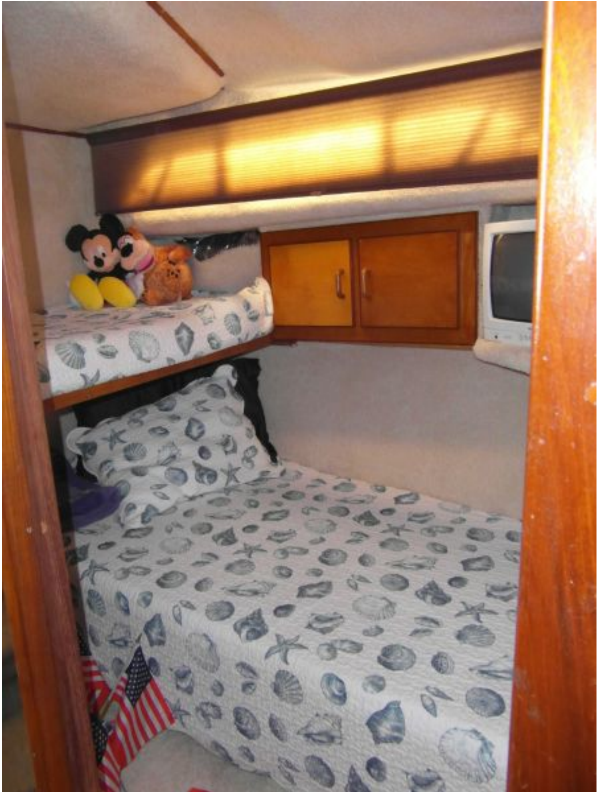
1995 Sportfish Portside Cabin