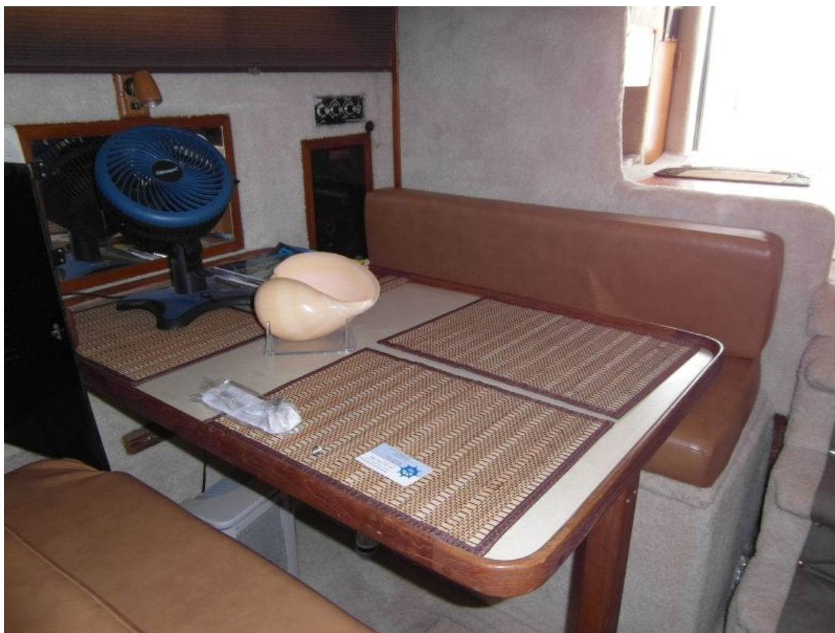
1995 Sportfish Dining Facing Aft