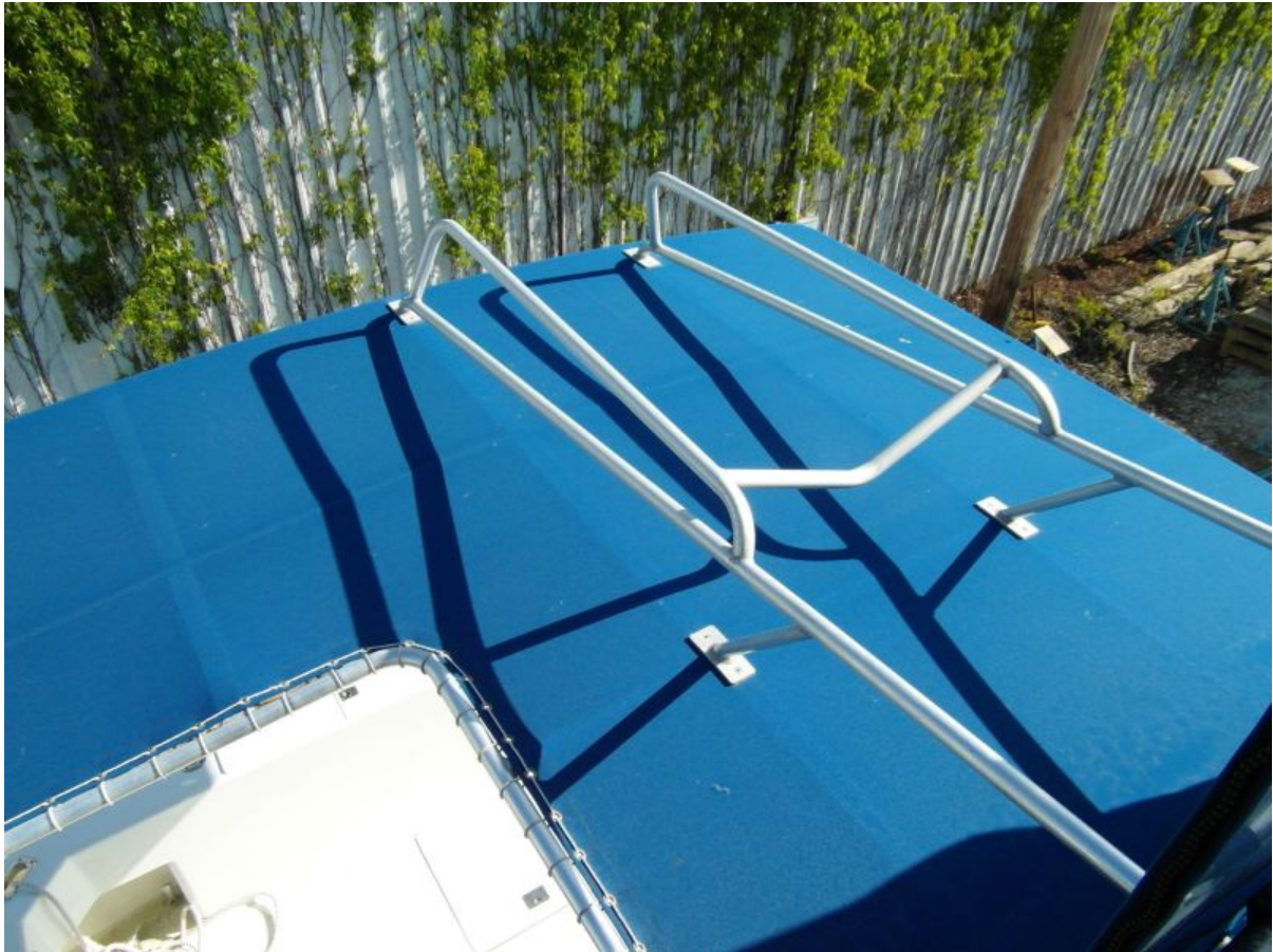
1995 Sportfish Tender Rack Over Cockpit