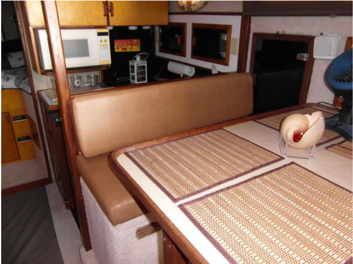
1995 Sportfish Dining Facing Forward