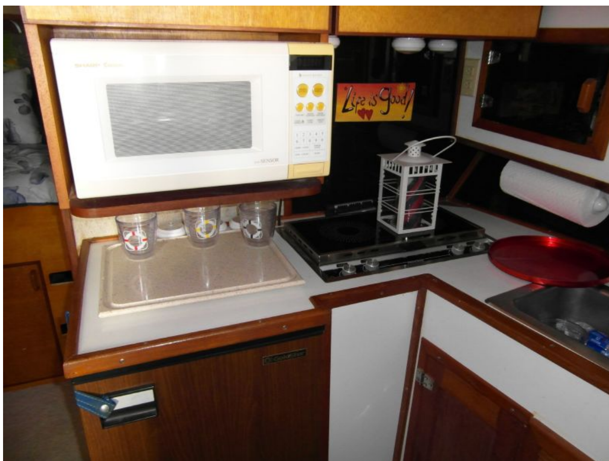
1995 Sportfish Galley Aft