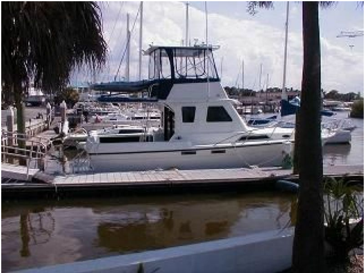
1995 Sportfish Custom