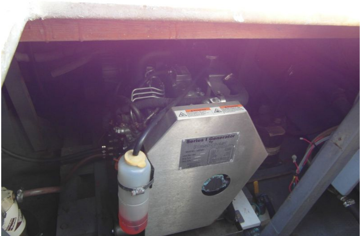
1995 Sportfish Engine Room