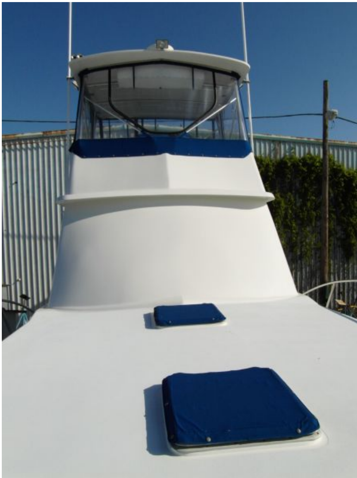
1995 Sportfish Flybridge