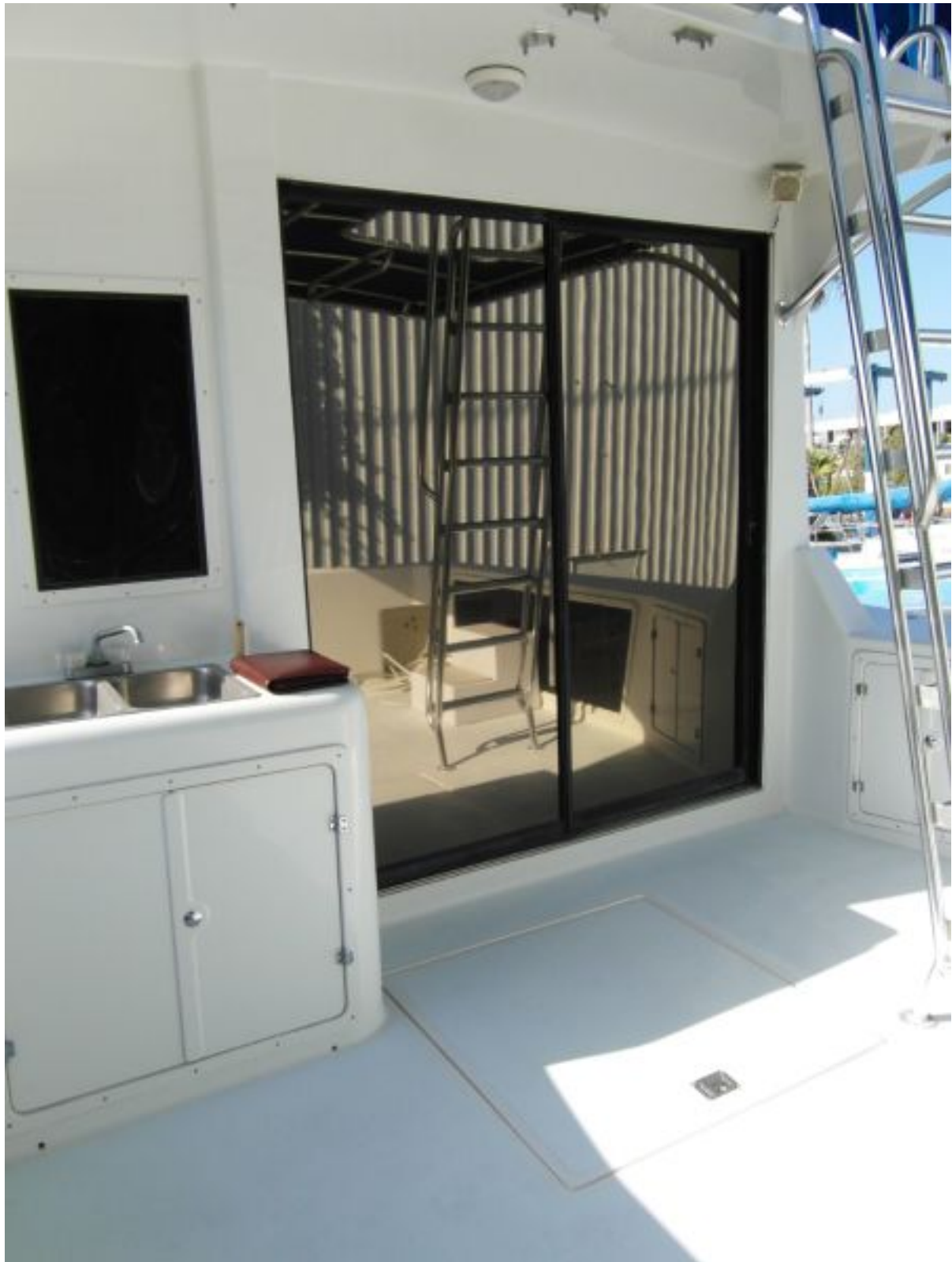
1995 Sportfish Entrance to Salon