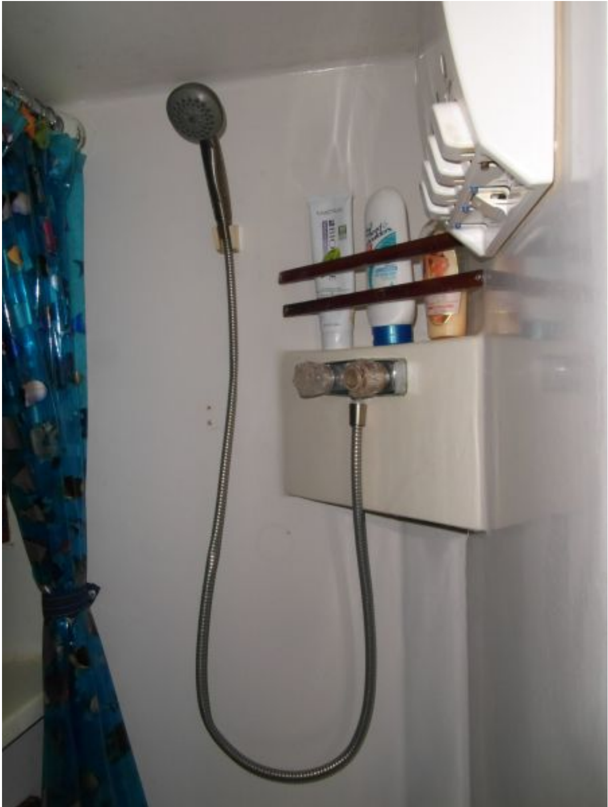
1995 Sportfish Shower