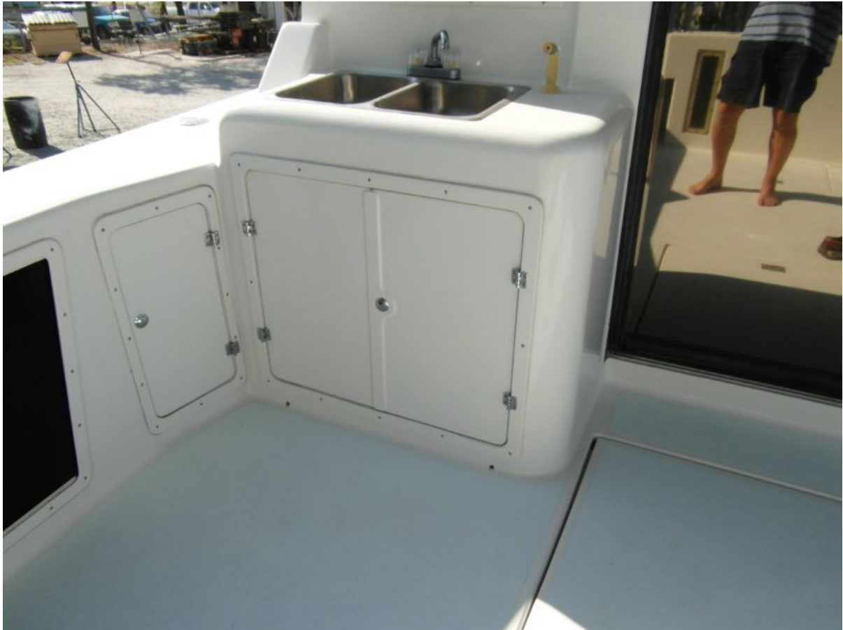
1995 Sportfish Cockpit Sink and Storage