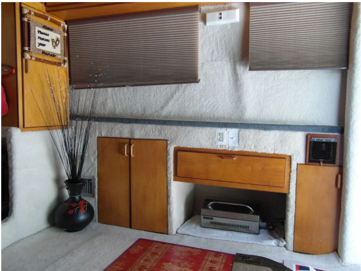
1995 Sportfish Salon Starboard View