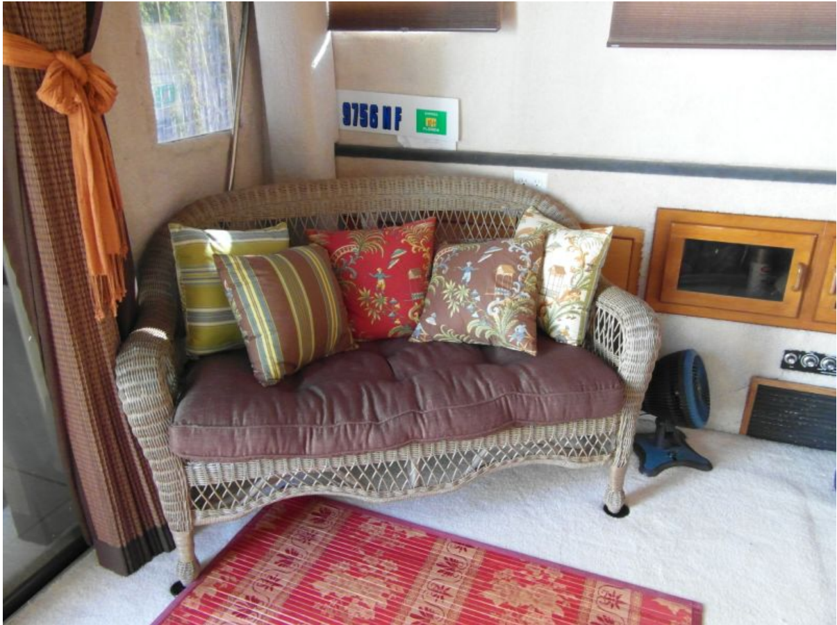
1995 Sportfish Salon Facing Port