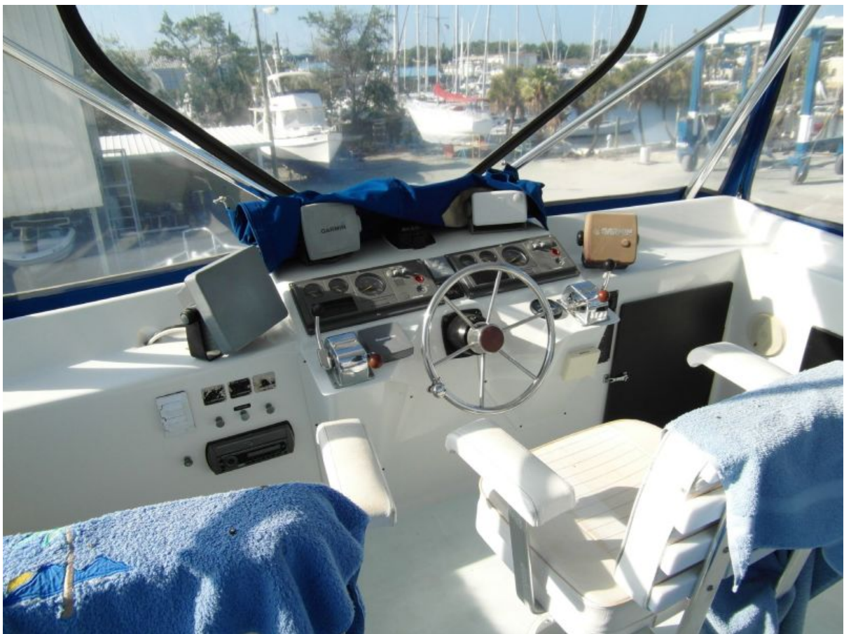
1995 Sportfish Flybridge Helm 2