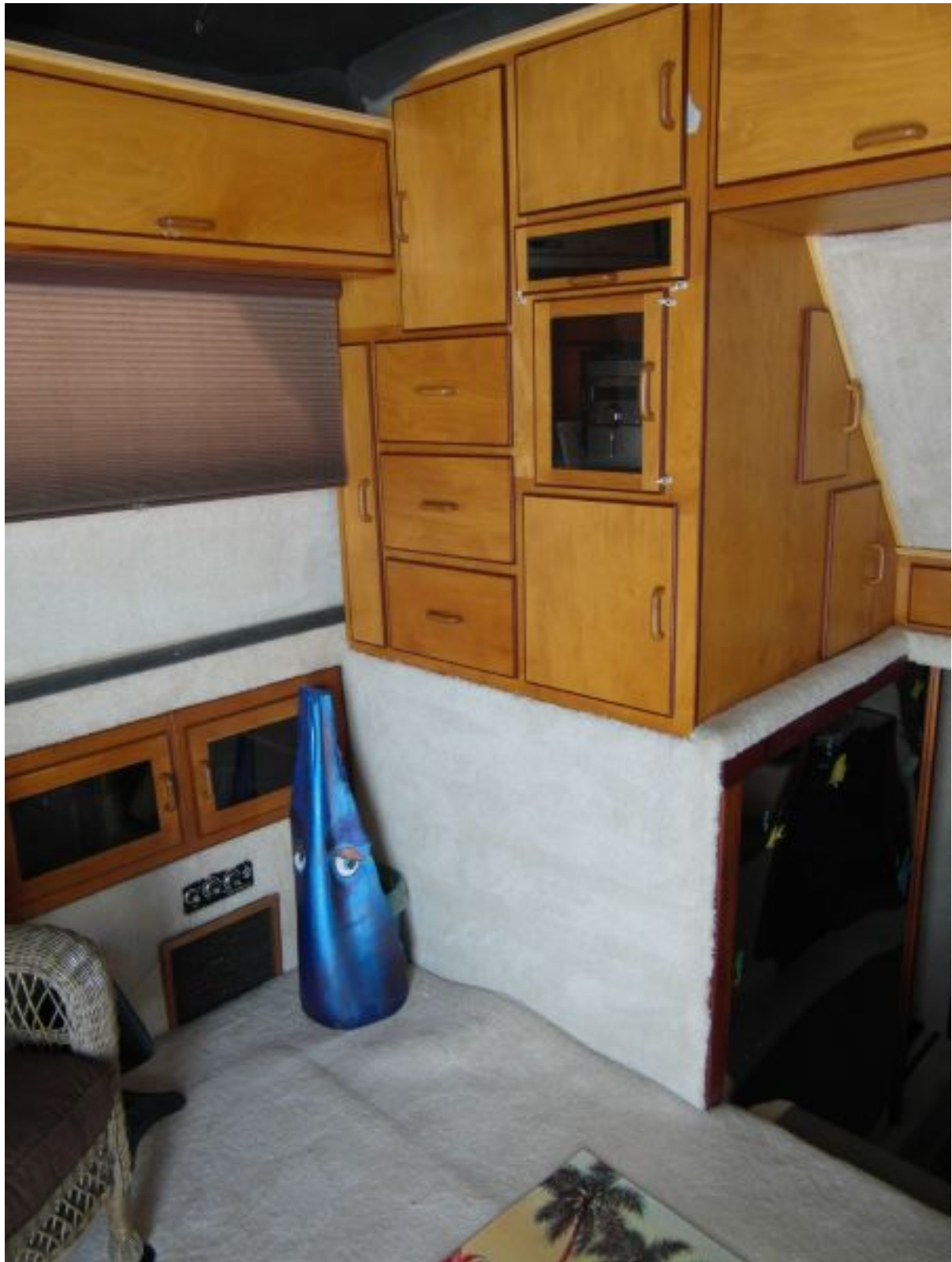
1995 Sportfish Salon Portside View