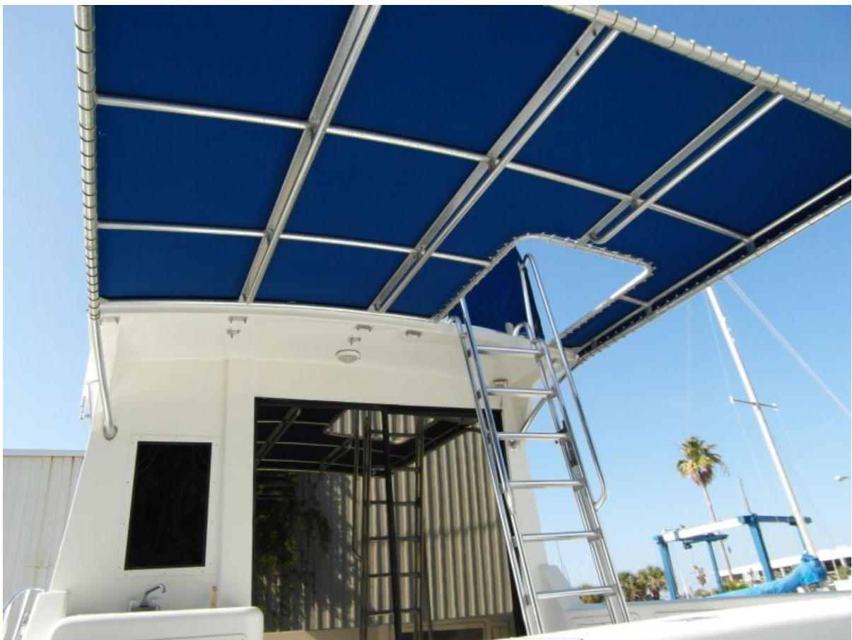
1995 Sportfish New Canvas Over Cockpit