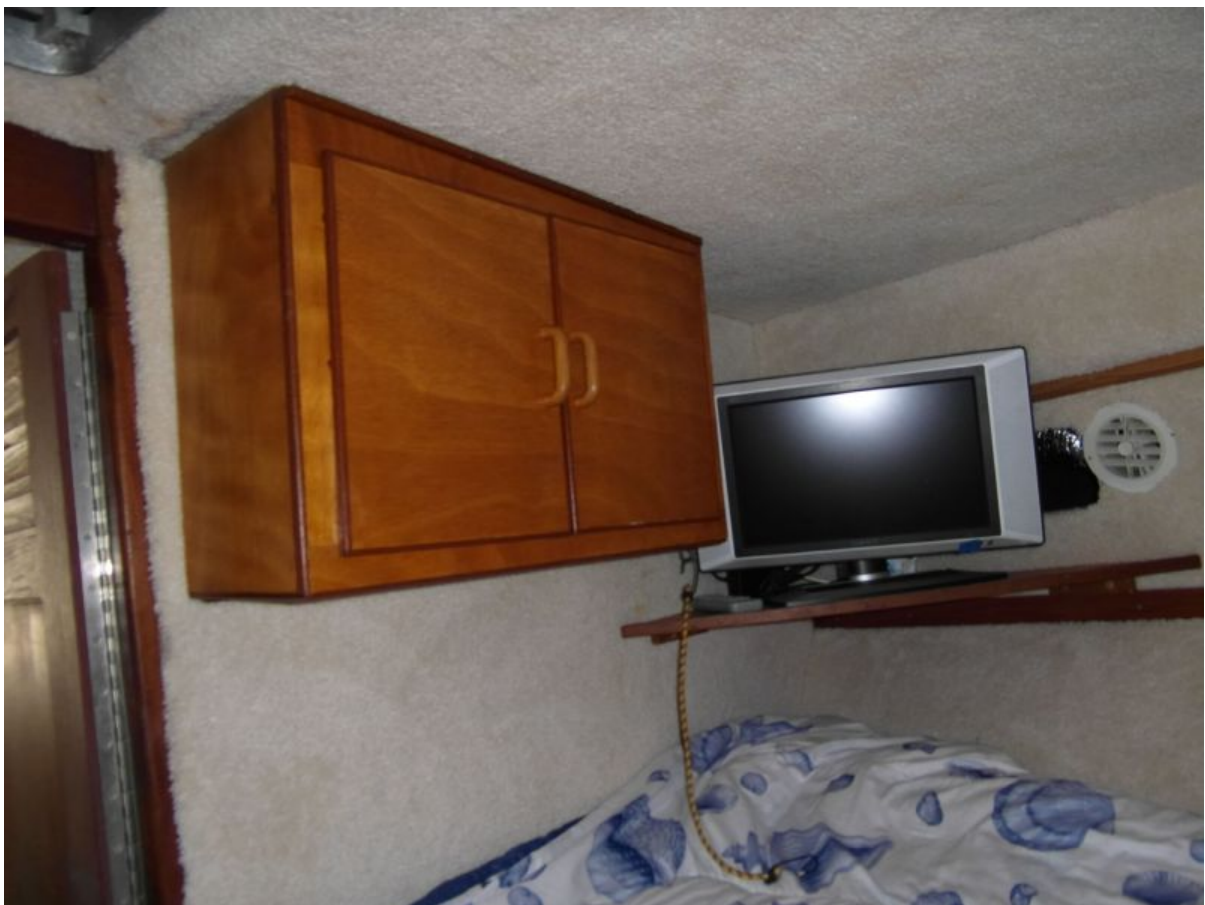
1995 Sportfish Main Cabin Storage and TV