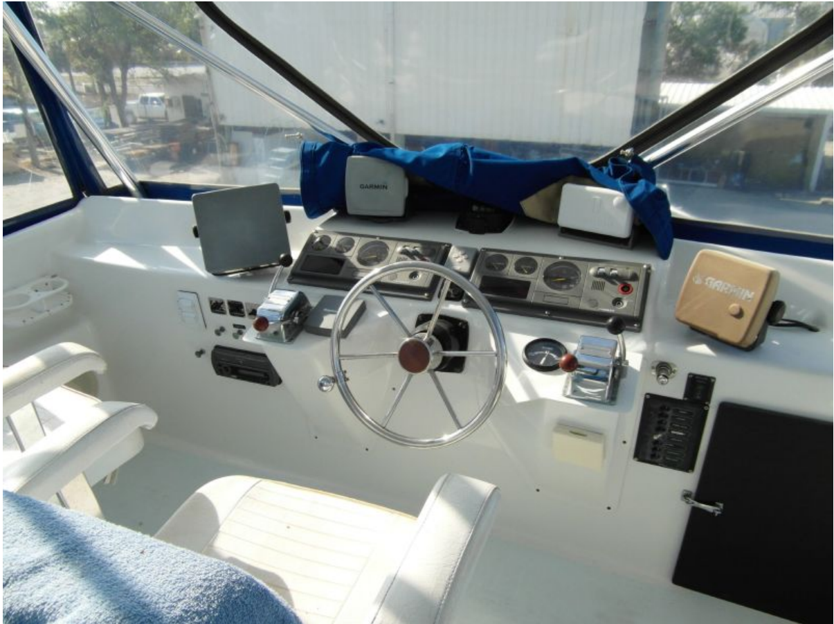
1995 Sportfish Flybridge Helm