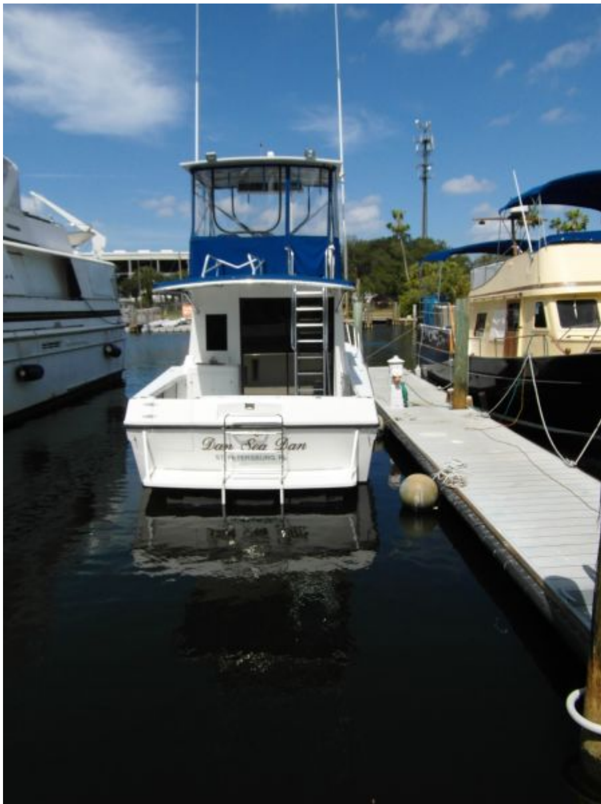
1995 Sportfish Aft Cockpit / Stern