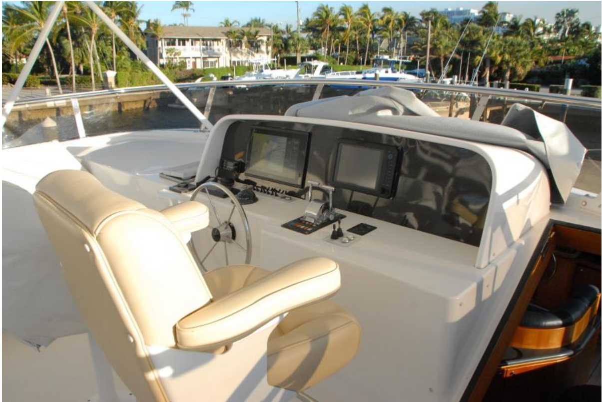
Flybridge / Helm