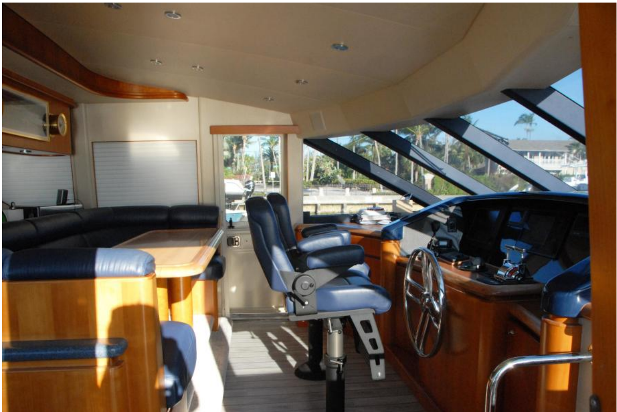
Pilothouse / Settee