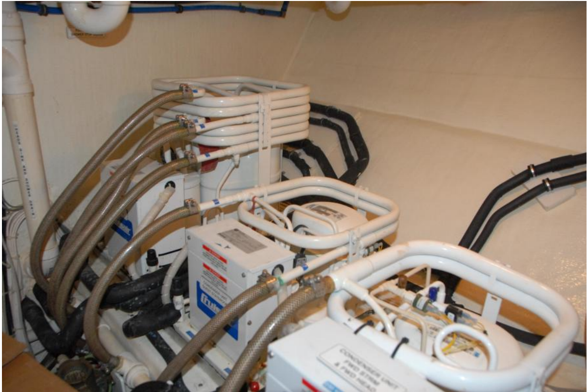
Pump Room / Forward