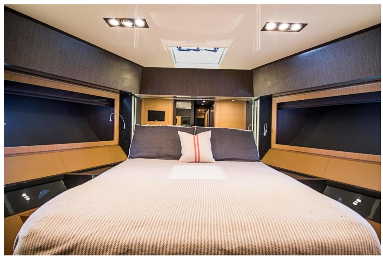
VIP 2 Stateroom