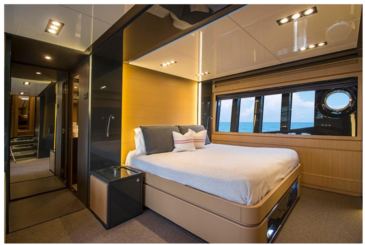
Master Looking Port