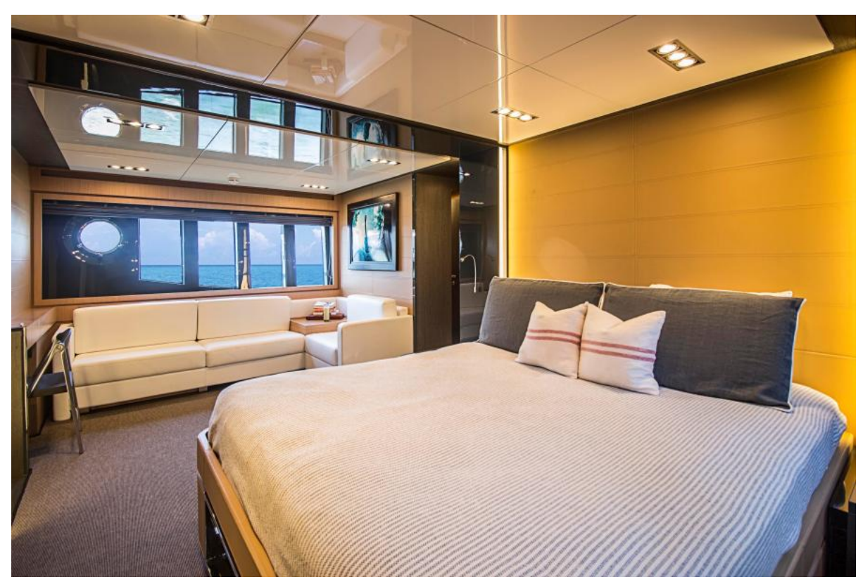
Master Looking Starboard