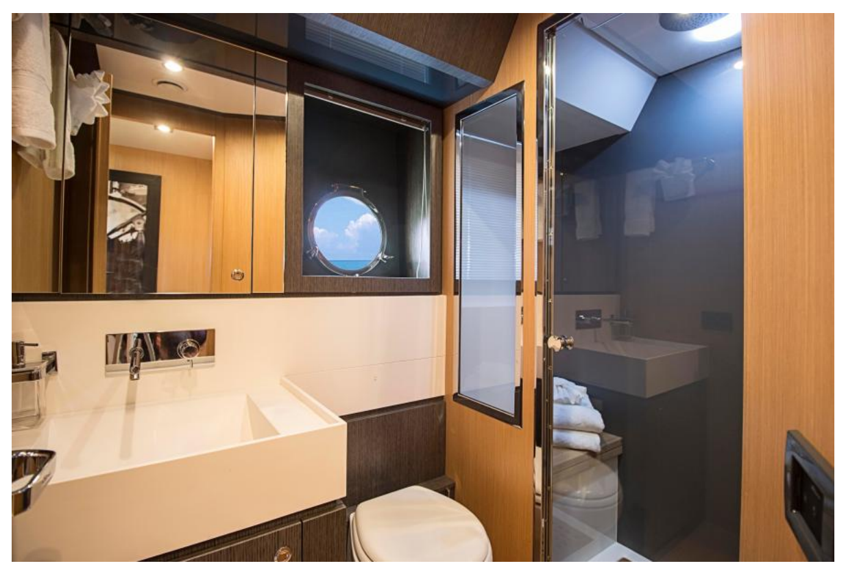
VIP 2 Head