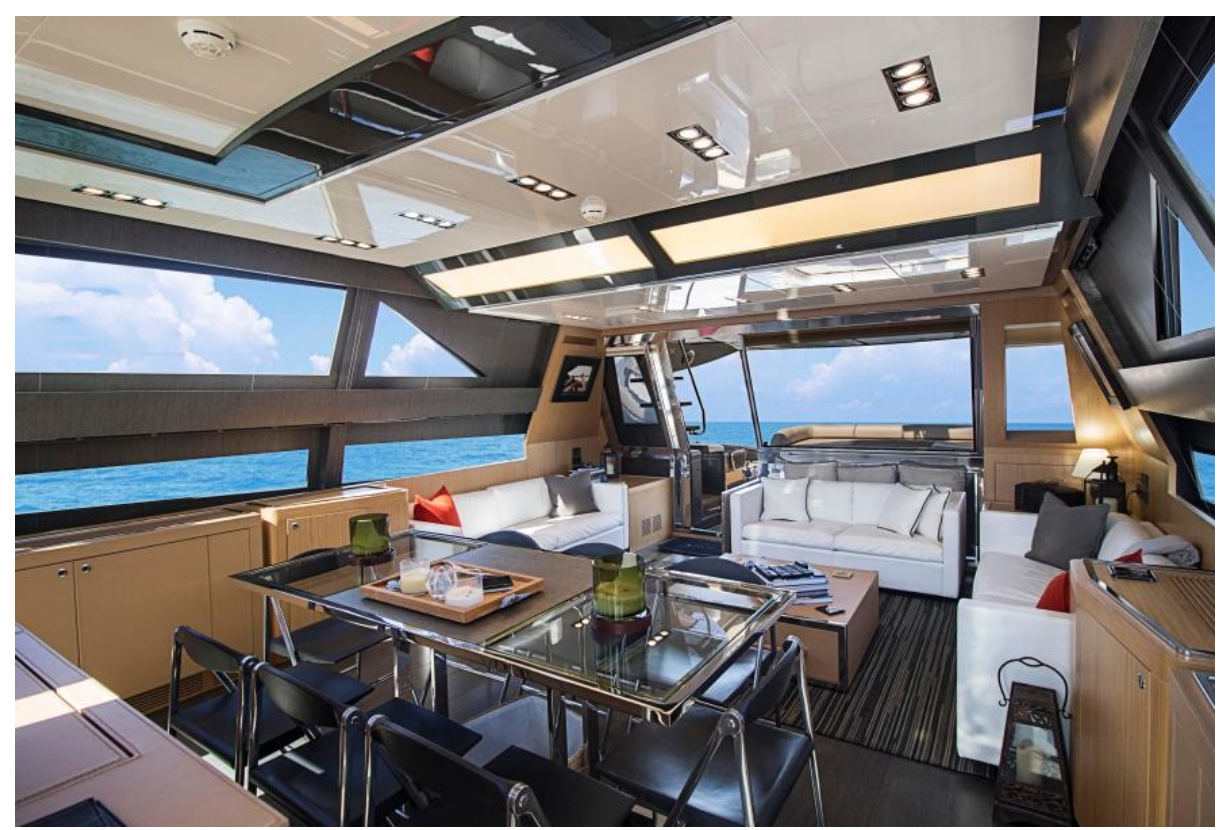
Salon Dining Facing Aft