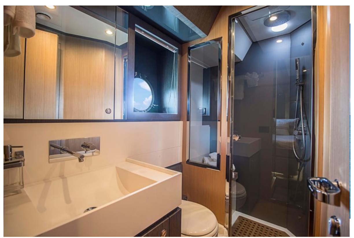
VIP 1 Head