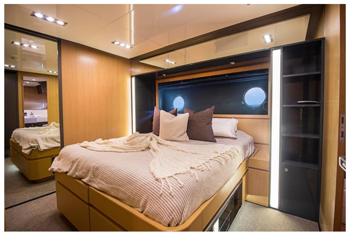
VIP 1 Stateroom