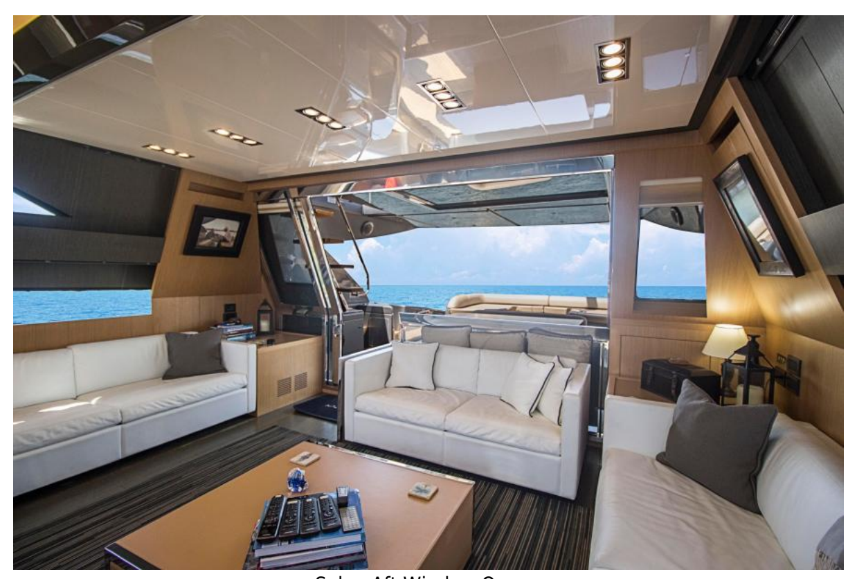
Salon Aft Window Open