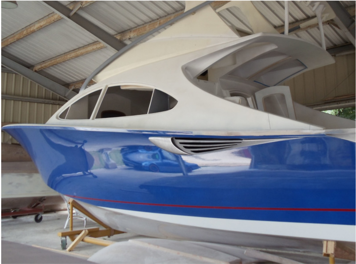
5 FY 41 Jager Side