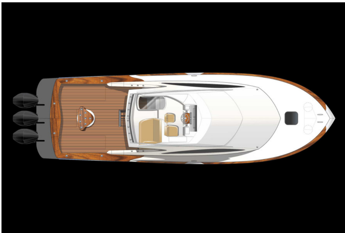
3 FY 41 Jager OB Topside