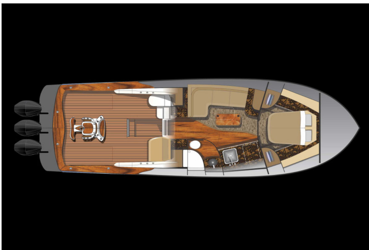
4 FY 41 Jager OB Cabin