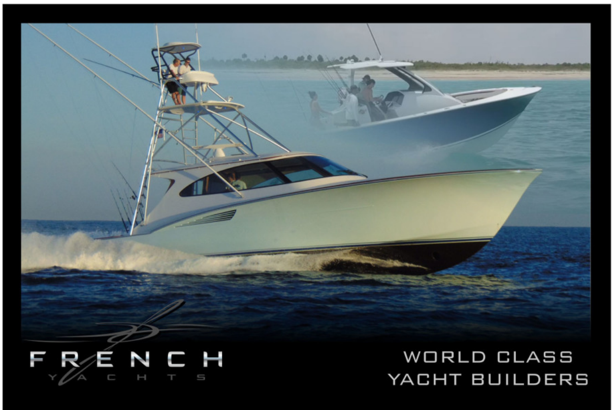
10 FY BUILDS STMT