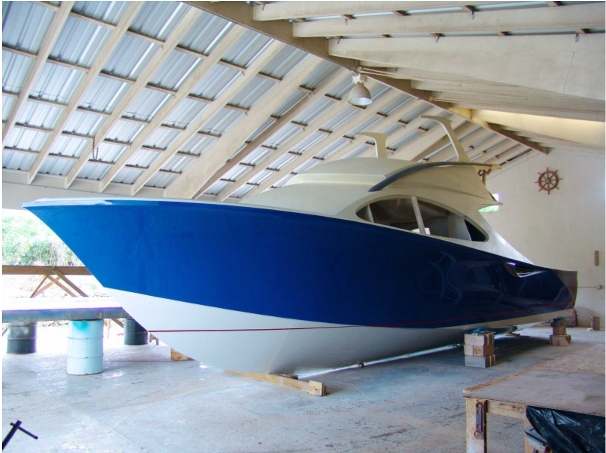
1 FY 41 Jager Bow