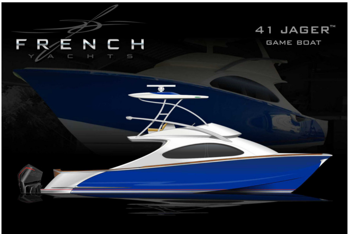
2 FY 41 Jager OB Profile