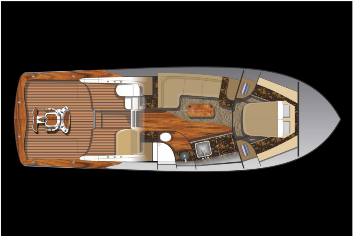
8 FY 41 Jager IB Cabin