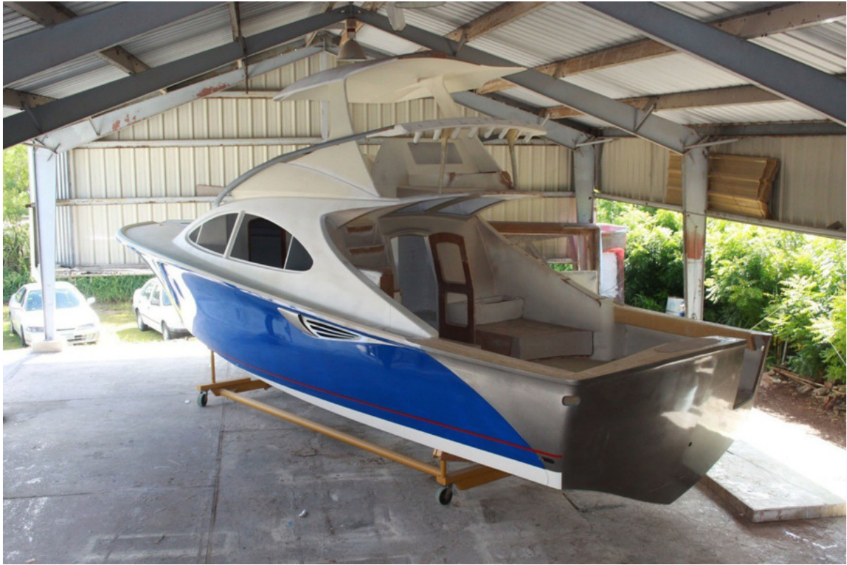
9 FY 41 Jager Stern