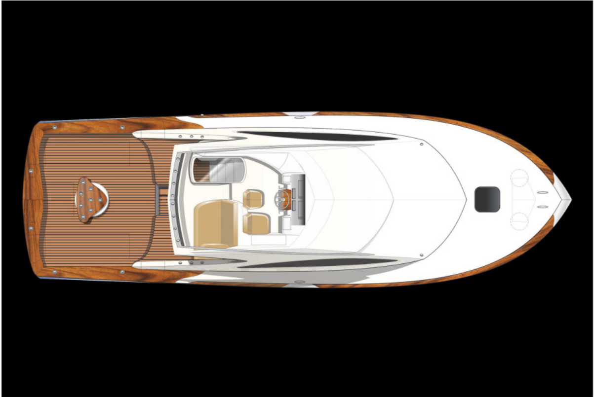
7 FY 41 Jager IB Topside