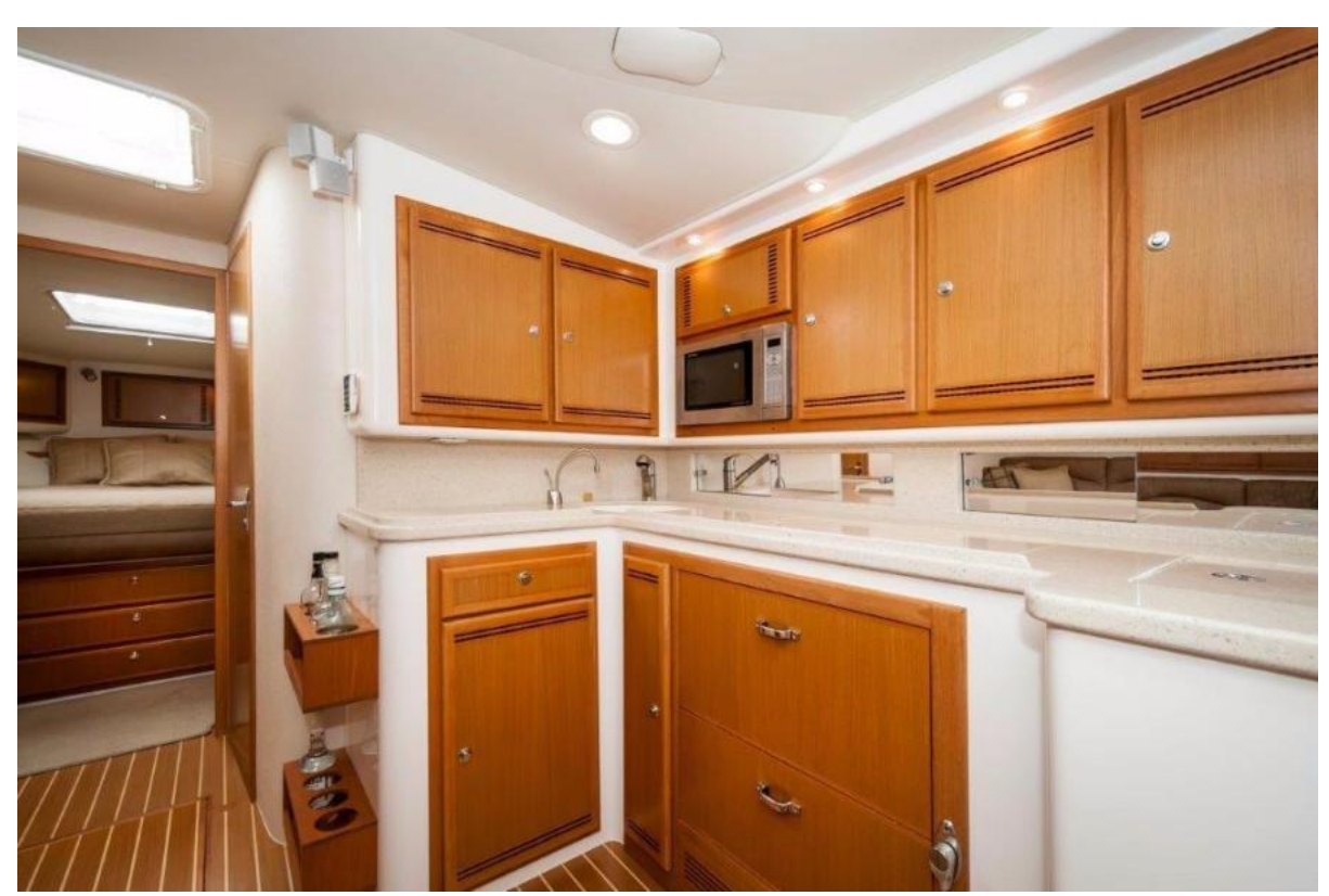
2008 45' Cabo Express Sea J's Passion Galley