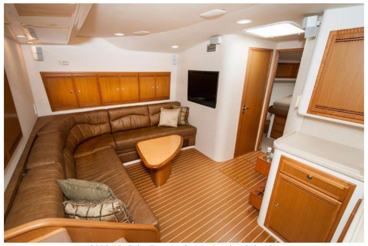
2008 45' Cabo Express Sea J's Passion Salon 2