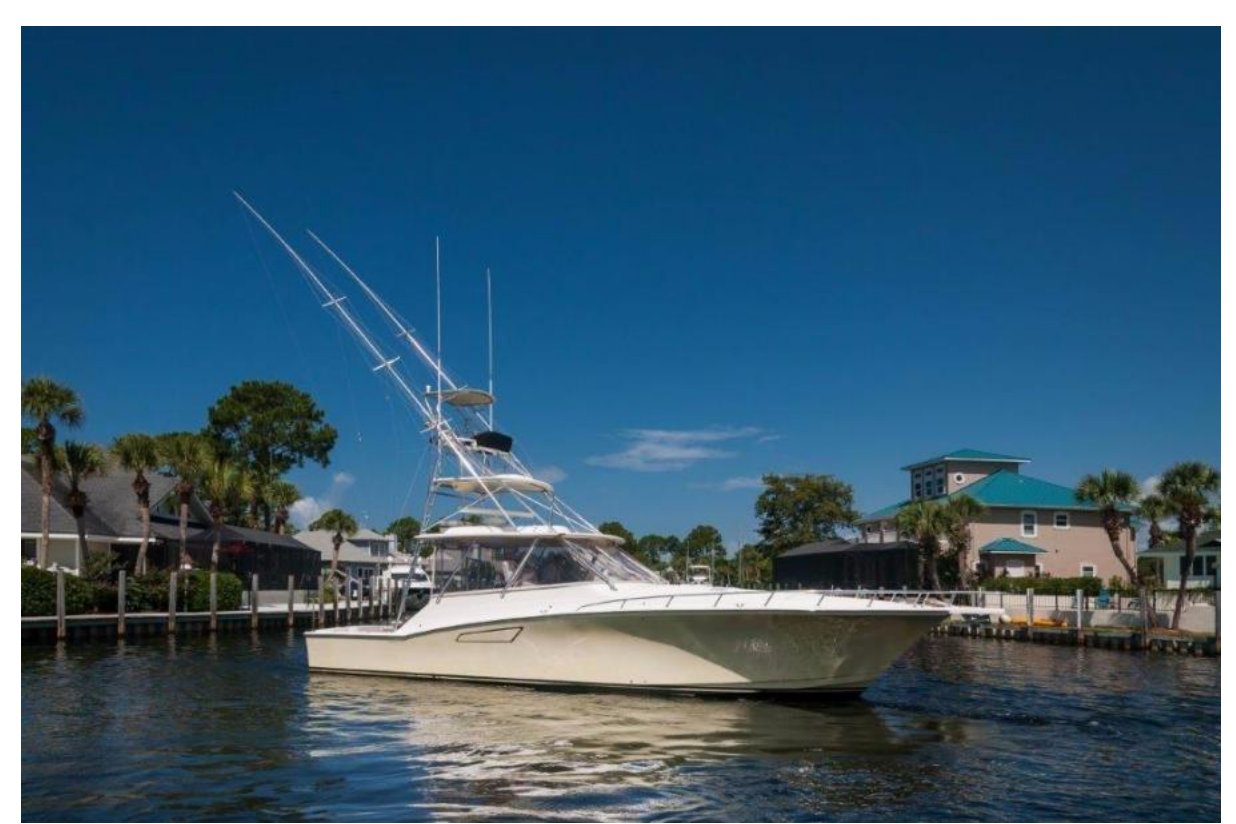
2008 45' Cabo Express Sea J's Passion Profile