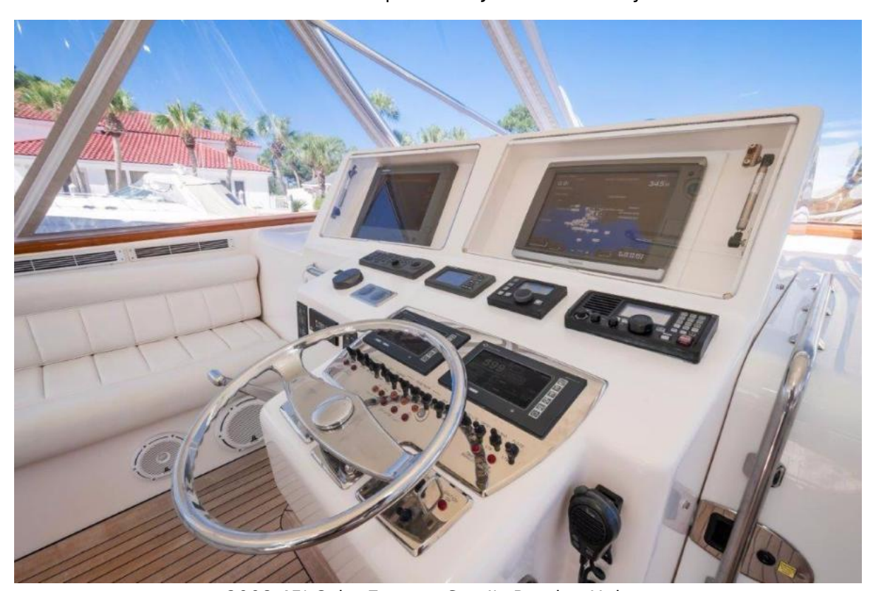
2008 45' Cabo Express Sea J's Passion Helm