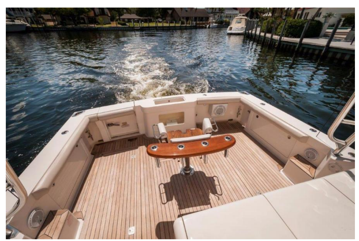
2008 45' Cabo Express Sea J's Passion Cockpit