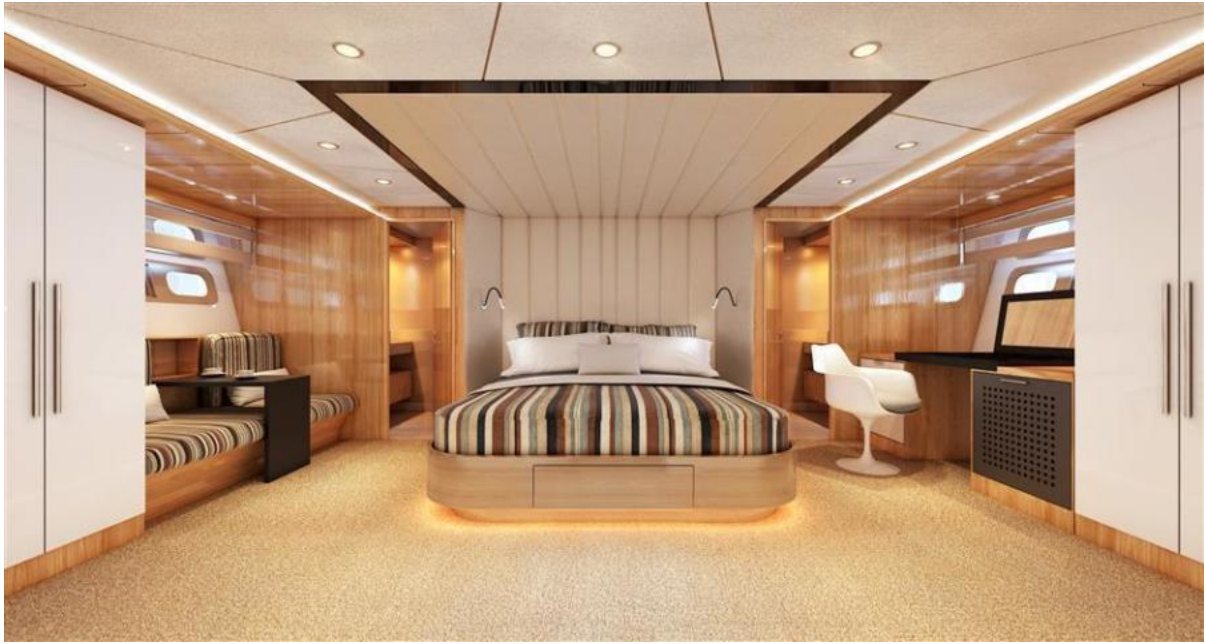
VIP Rendering of Next Launch