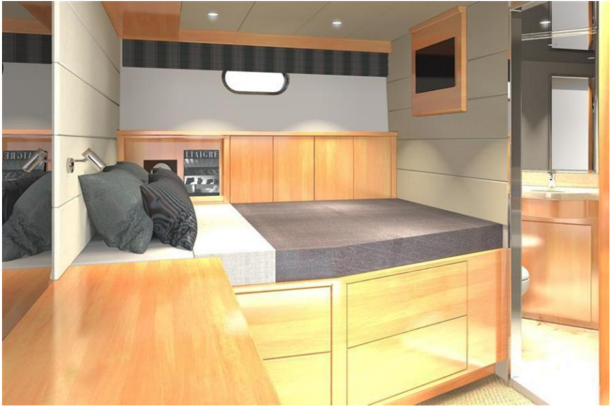
Crew Rendering of Next Launch