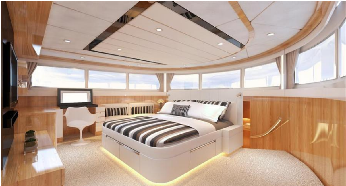
Master Rendering of Next Launch