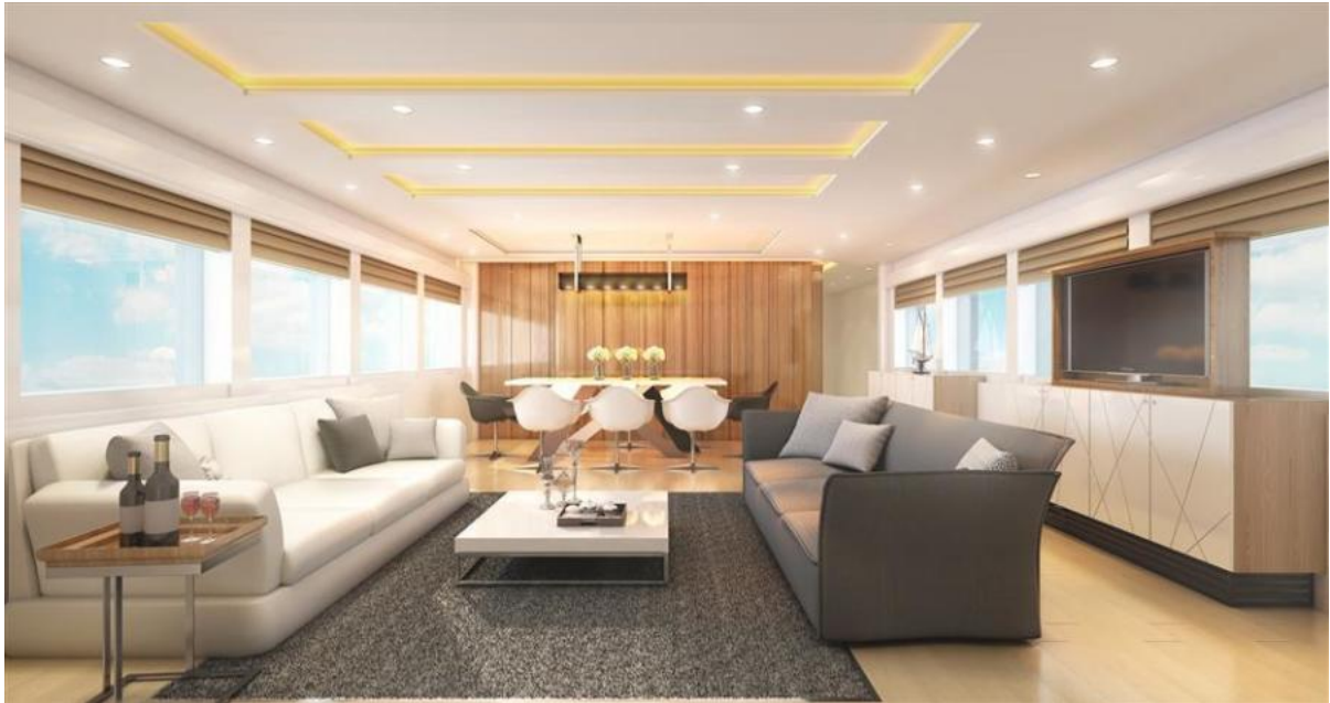
Salon Rendering of Next Launch