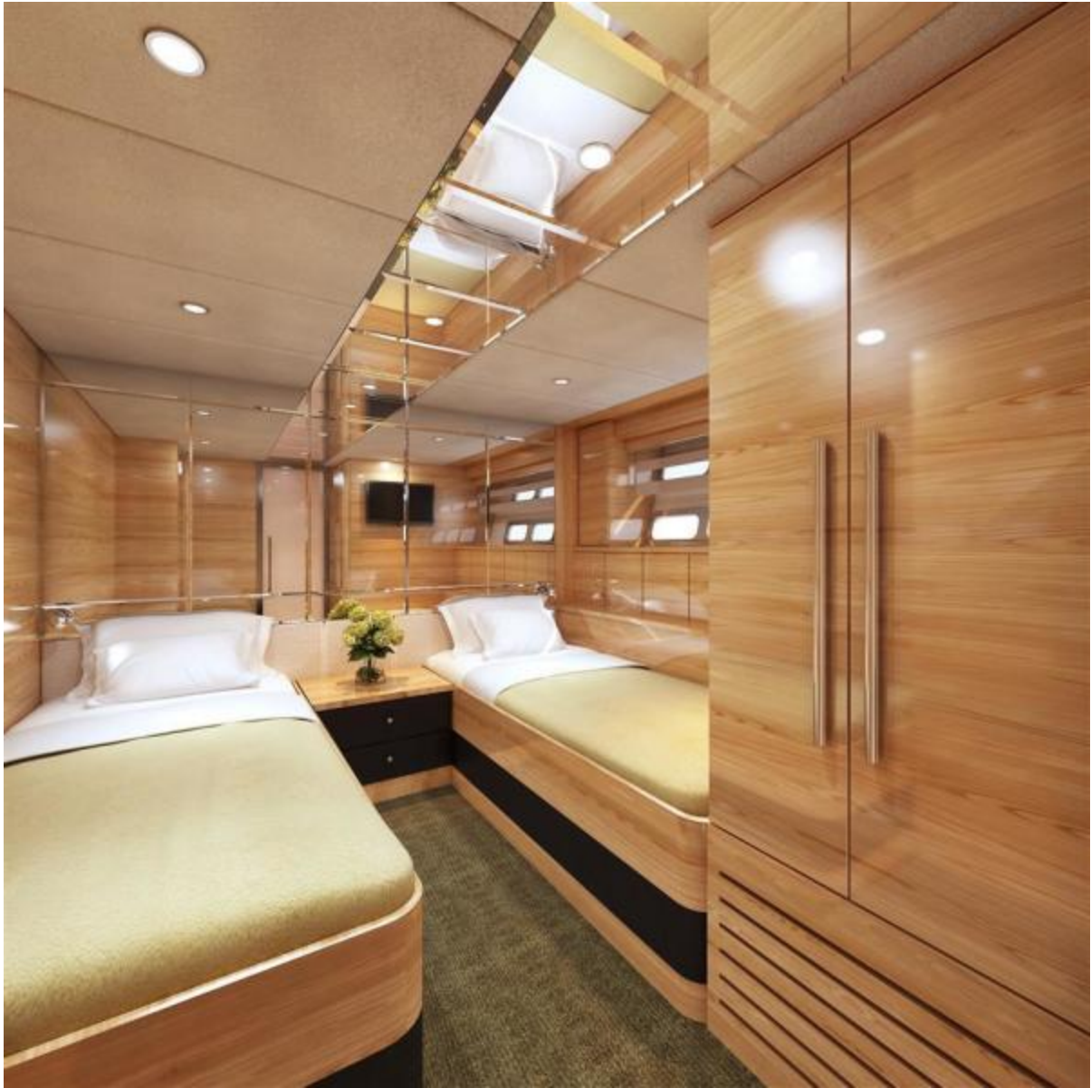
Guest Rendering of Next Launch