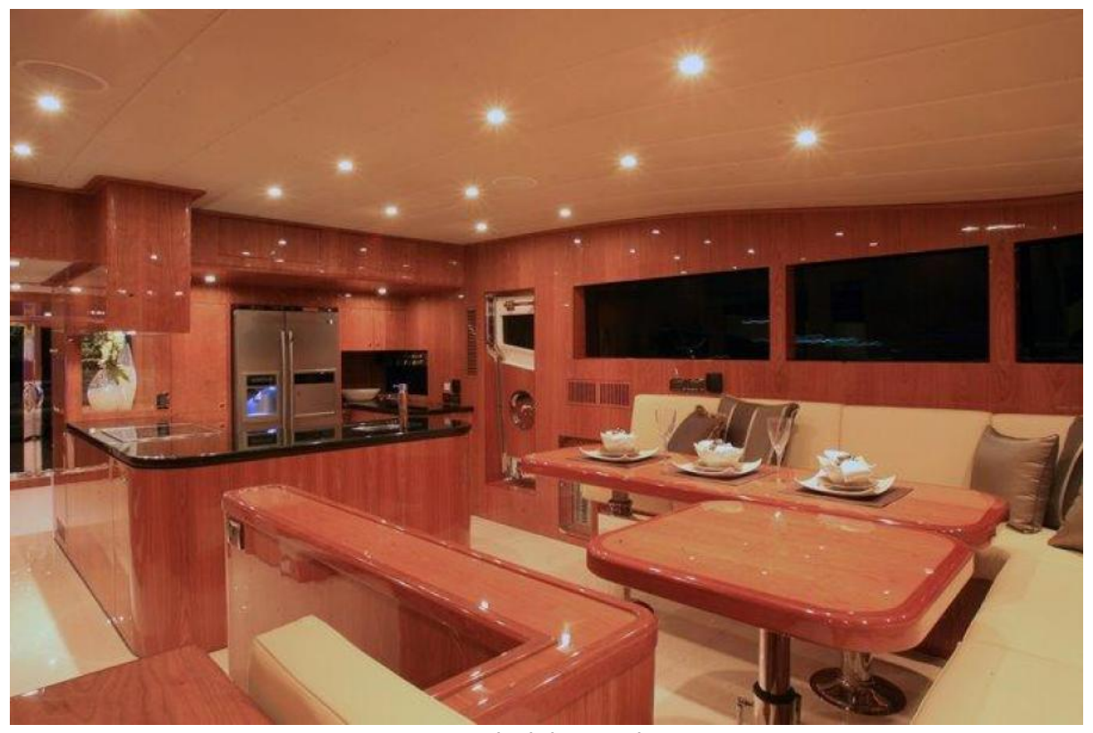
Forward Dining Option