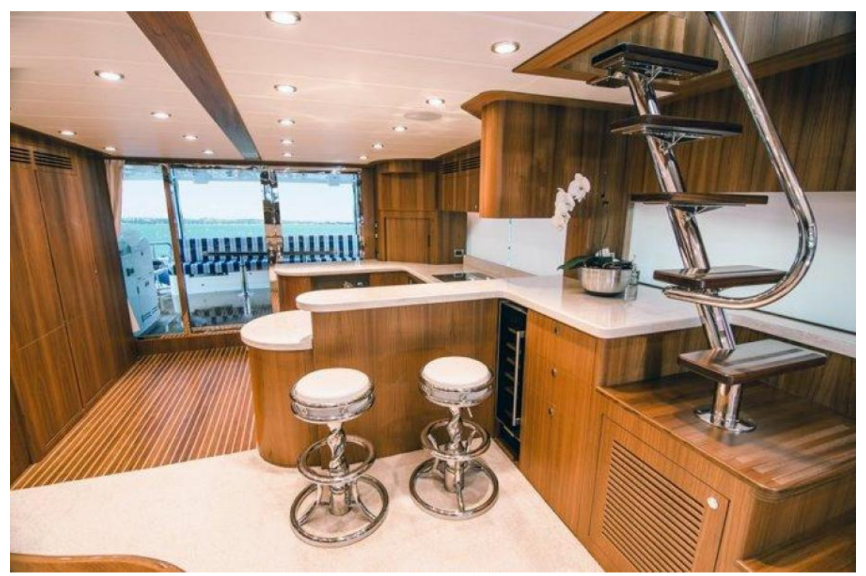
Aft Galley Option