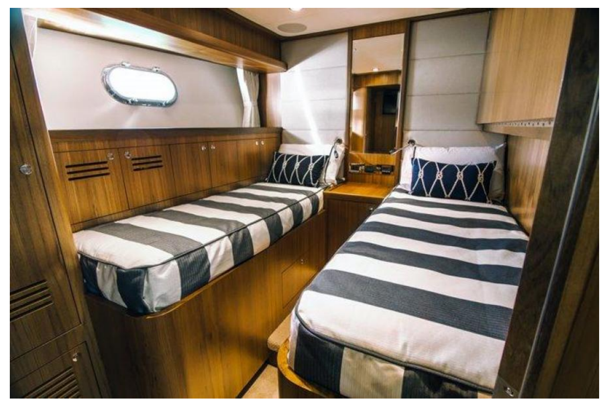
Port Side Midship Cabin