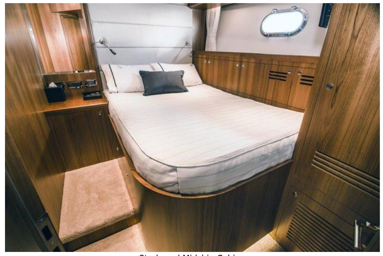
Starboard Midship Cabin