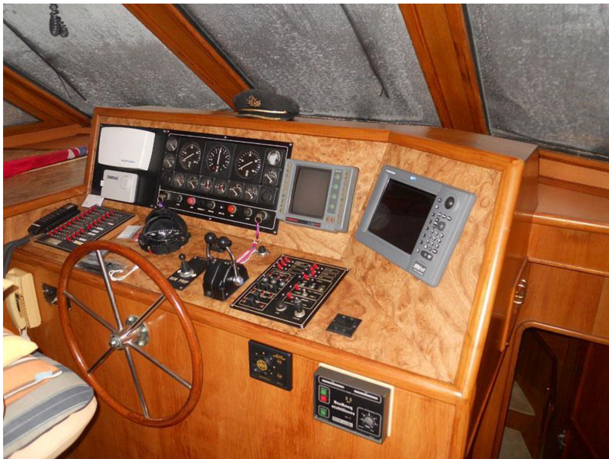
Pilothouse Helm Pilothouse Helm