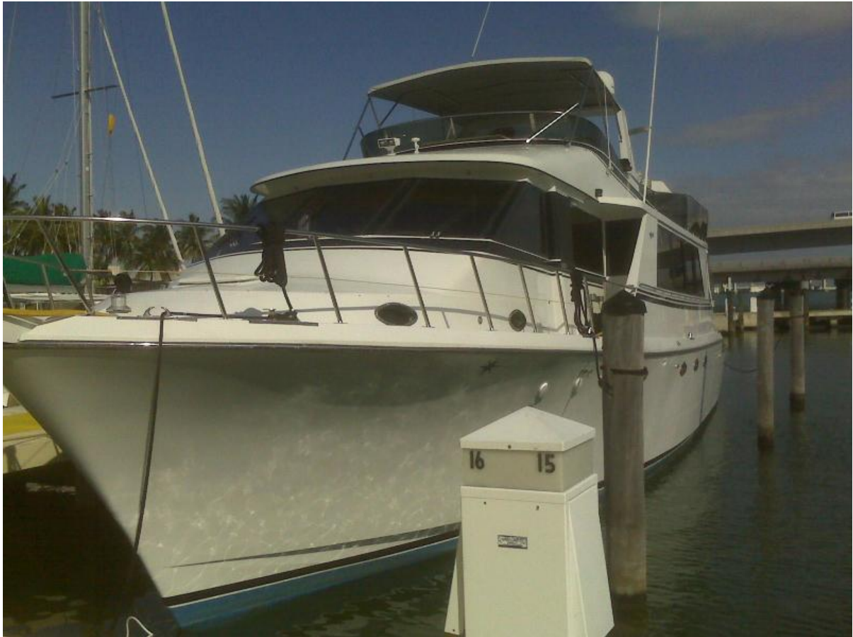
Blue Nova Blue Nova