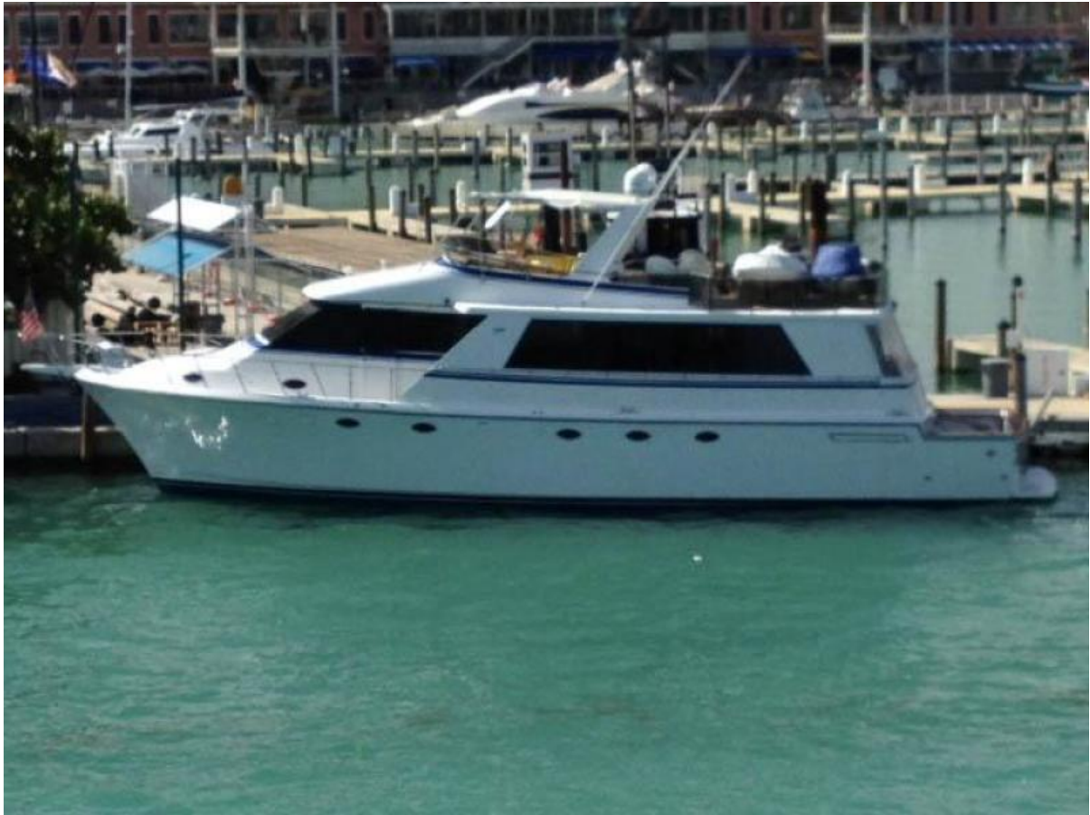
BLUE NOVA BLUE NOVA