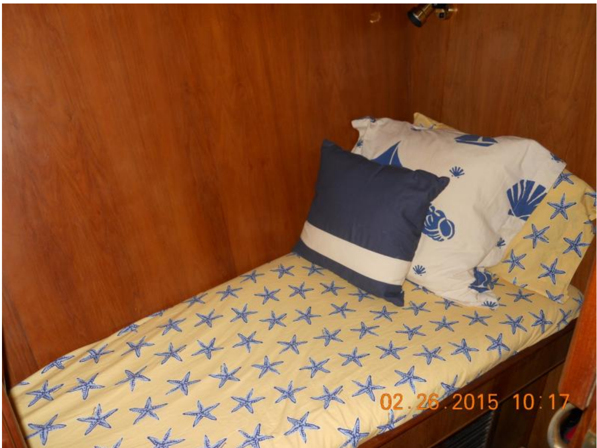
Crew Quarters Crew Quarters