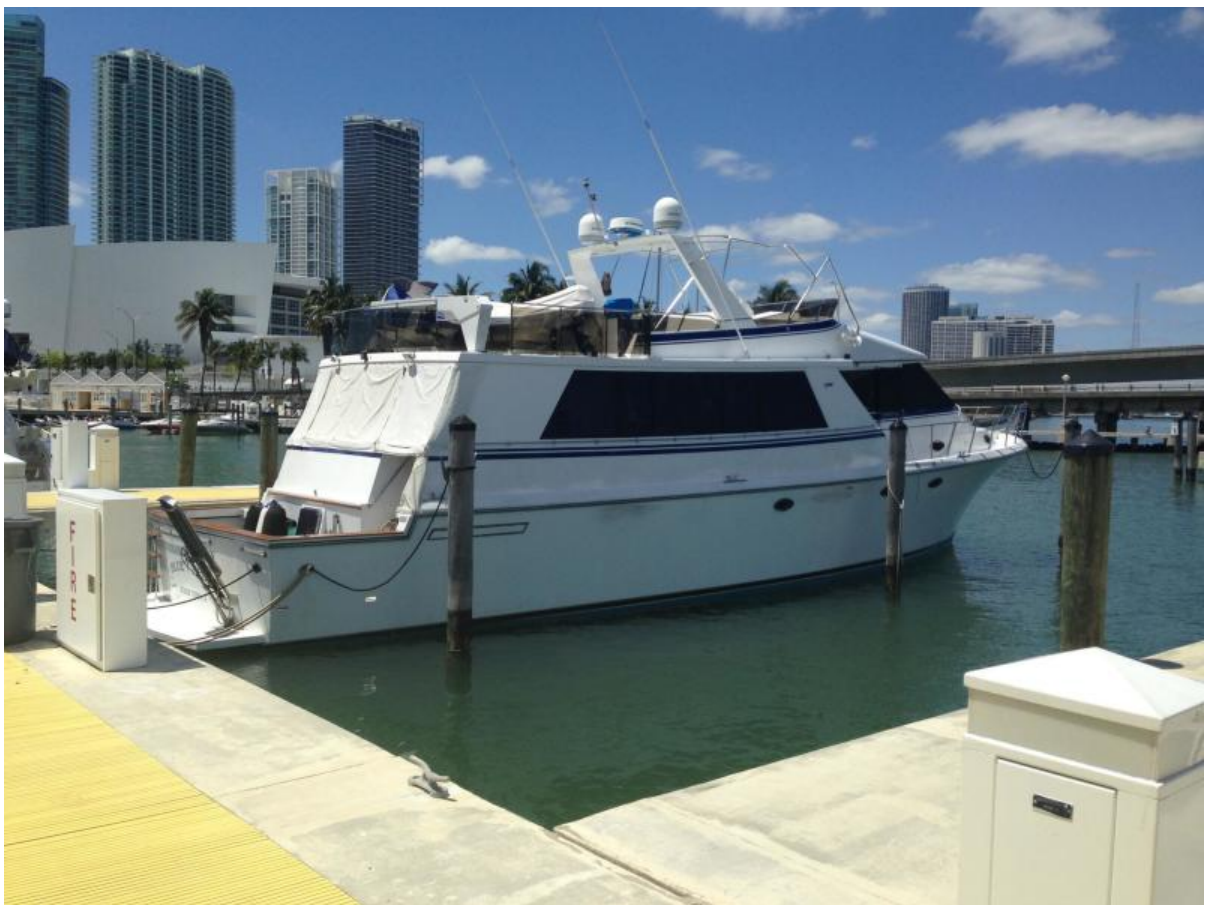
Blue Nova Blue Nova