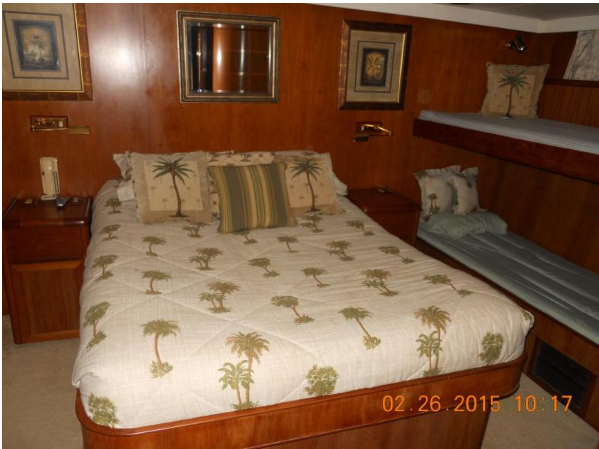
Master Stateroom Master Stateroom