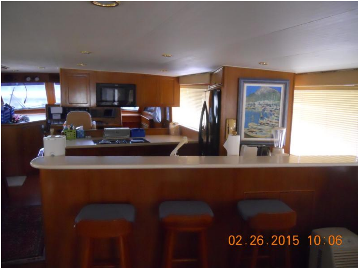
Breakfast Stools Breakfast Stools