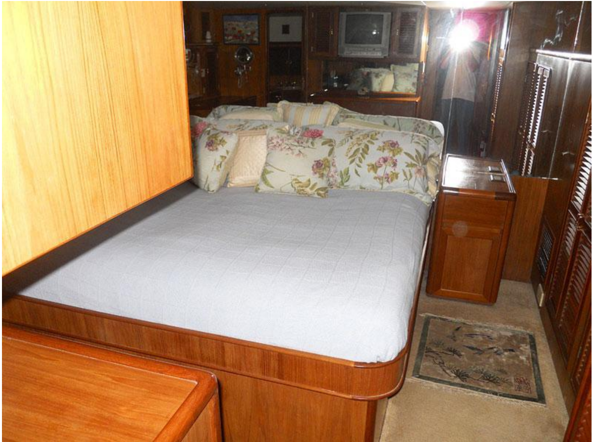
VIP Stateroom VIP Stateroom